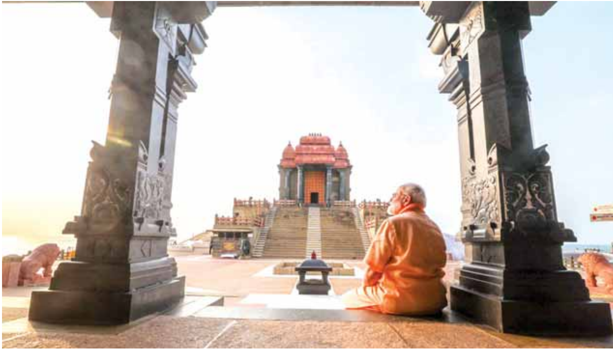
Prime Minister Narendra Modi at the Vivekananda Rock Memorial in Kanyakumari

Violence broke out between TMC and BJP supporters in Sandeshkhali in West Bengal, and complaints of EVM glitches and rigging at some booths were lodged. Barring incidents of clashes in Odisha, voting was almost peaceful. The counting of votes will be taken up on June 4. In Arunachal Pradesh and Sikkim, the counting for the