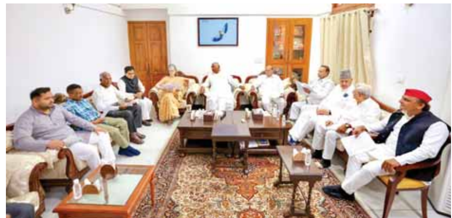
Congress leaders Mallikarjun Kharge, Sonia Gandhi, National Conference leader Farooq Abdullah, CPI(M)'s Sitaram Yechury, Samajwadi Party leader Akhilesh Yadav, RJD leader Tejashwi Yadav, AAP leaders Arvind Kejriwal and Sanjay Singh, CPI's D Raja during the INDIA Bloc's meeting in New Delhi on Friday

Congress president Mallikarjun Kharge on Saturday claimed that INDIA Bloc coalition will register a win over 295 plus Lok Sabha seats in the seven-phase general elections 2024 that concluded on Saturday. Kharge, along with top leaders of the Bloc including former Congress chief Sonia Gandhi, met at the residence of Congress president to discuss their strategy for the counting of votes on June 4. "INDIA Bloc will get a big majority, we have a people's survey with us," Kharge said after the Opposition meeting. He said the parties have also sought time from the Election Commission of India on Sunday for steps to be taken during counting of votes besides having conveyed their workers not to leave the counting hall till all formalities are over on June 4. Senior leaders of the Congress, Samajwadi Party,