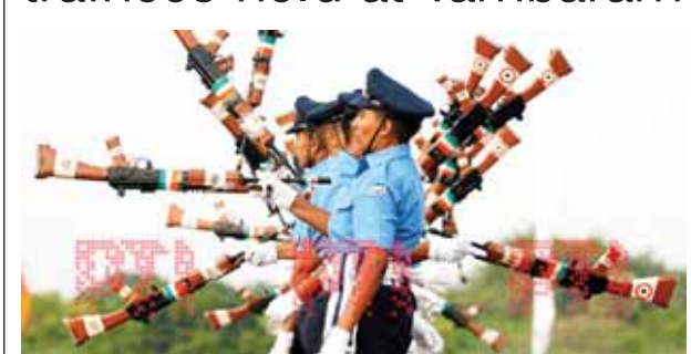
CHENNAI