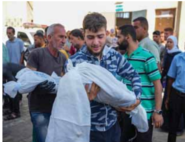
A Palestinian mourner carries the body of a child killed in Israeli bombardment of the Gaza Strip, during their funeral in Deir al Balah, Friday.

Families of Israeli hostages held by Hamas called for all parties to immediately accept a proposal detailed by US President Joe Biden to end the nearly 8-month-long war and bring their relatives home, but Israel's government said conditions for a cease-fire still must be met. Biden outlined a three-phase deal Friday proposed by Israel to Hamas, saying the militant group is "no longer capable" of carrying out another large-scale attack on Israel. He urged the Israelis and Hamas to come to an agreement to release some 100 remaining hostages, along with the bodies of around 30 more, for an extended cease-fire. Cease-fire talks ground to a halt last month after a major push by the US and other mediators to secure a deal in hopes of averting a full Israeli invasion of Gaza's southern city of Rafah. Israel says the Rafah operation is vital to uprooting Hamas