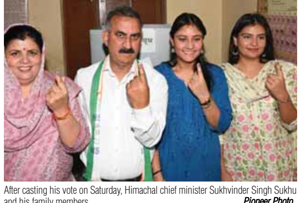
After casting his vote on Saturday, Himachal chief minister Sukhvinder Singh Sukhu and his family members.

Of the six assembly constituencies where bypolls are being held simultaneously, Dharamshala recorded a turnout of 66.27 per cent, Lahaul and Spiti 73.72 per cent, Sujapur 63 per cent, Barsar 50 per cent, Gagret 68.28 per cent and Kulehar 71.40 per cent. These figures were being revised at the time of going to press.