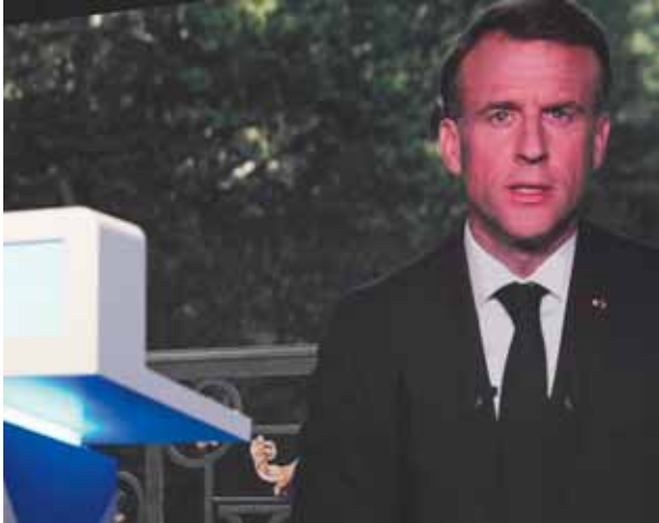
French President Emmanuel Macron appears on television screen at the French far-right National Rally party election night headquarters, Sunday,

Far-right parties rattled the traditional powers in the European Union with major gains in parliamentary seats, dealing an especially humiliating defeat to French President Emmanuel Macron, who called snap legislative elections. Some ballots in the vote for the European Parliament were still being counted Monday, but the outcome showed the 27-nation bloc’s parliament membership has clearly shifted to the right. Italian Premier Giorgia Meloni more than doubled her party’s seats in the assembly. And despite being hounded by a scandal involving candidates, the Alternative for Germany extreme right party still rallied enough seats to sweep past the slumping Social Democrats of Chancellor Olaf Scholz. Sensing a threat from the far right, the Christian Democrats of EU Commission President Ursula von der Leyen had