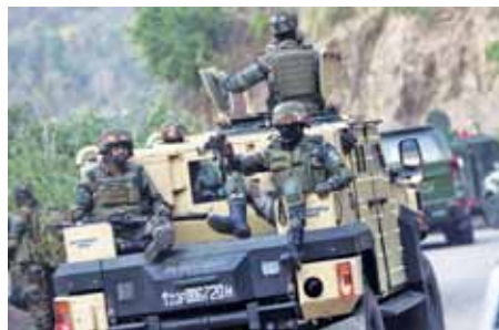
Army personnel during a search operation after a bus carrying pilgrims was ambushed by terrorists, in Reasi district of Jammu and Kashmir, on Monday. At least 9 people were killed and 33 others suffered injuries in the terror attack on the bus, according to officials

Technology; MoS (Independent Charge) of the Ministry of Earth Sciences; MoS in the Prime Minister's Office; MoS in the Ministry of Personnel, Public Grievances and Pensions; MoS in the Department of Atomic Energy; and MoS in the Department of Space. Arjun Ram Meghwal is MoS (Independent Charge) of the Ministry of Law and Justice; and MoS in the Ministry of Parliamentary Affairs. Jadhav Prataprao Ganpatrao is MoS (Independent Charge) of the Ministry of Ayush; and MoS in the Ministry of Health and Family Welfare. RLD leader Jayant Chaudhary is MoS (Independent Charge) of the Ministry of Skill Development and Entrepreneurship; and MoS in the Ministry of Education. Lok Janshakti Party (Ram Vilas) chief Chirag Paswan is all set to become the new Minister of Food Processing Industries.