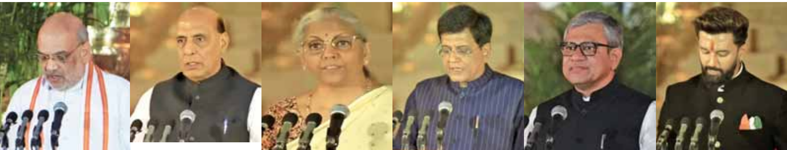
(Left to right): Amit Shah (Minister of Home Affairs; and Minister of Cooperation), Rajnath Singh (Minister of Defence), Nirmala Sitharaman (Minister of Finance; and Minister of Corporate Affairs), Piyush Goyal (Minister of Commerce and Industry), Ashwini Vaishnaw (Minister of Railways; Minister of Information and Broadcasting; and Minister of Electronics and Information Technology) and Chirag Paswan (Minister of Food Processing Industries)