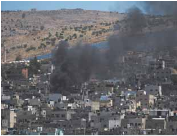
Smoke rises in the Palestinians Al Fara'a refugee camp in the occupied West Bank following an Israeli military raid, Monday, June 10, 2024. Israel’s military killed a 15-year-old Palestinian in an overnight raid on Al Fara’a refugee camp in the occupied West Bank, according to Palestinian health officials. The military said Monday that it had begun what it described as a “counterterrorism” raid into the camp. It said soldiers killed one militant and injured two more with live fire and said the heavy exchanges of gunfire were ongoing.

The director of the UN World Food Program said Sunday the programme has “paused” its distribution of humanitarian aid from an American-built pier off Gaza, saying she was “concerned about the safety of our people” after what had been one of the deadliest days of the war there. Saturday saw both an Israeli military assault that freed four hostages but left 274 Palestinians and one Israeli commando dead, and, Cindy McCain said, two of WFP’s warehouses in Gaza had been “rocketed” and a staffer injured. Sunday’s UN announcement of the pause appears the latest setback for the US sea route, set up to try to bring more aid to Gaza’s starving people. The US Agency for International Development described the pause as a step to allow for a security review by the humanitarian community in Gaza. USAID works with the World Food Program and their humanitarian partners in Gaza to distribute food and other aid com-