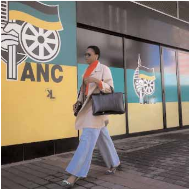
A woman walks past Luthuli House, the ANC headquarters in Johannesburg, South Africa, on June 5.

The African National Congress won 40 per cent of the national vote during the country's highly contested elections, followed by the Democratic Alliance with just over 21 per cent and the newly formed uMkhonto weSizwe Party with about 15 per cent of the vote in their first-ever elections. The ANC has opted to form a national unity government that will include most political parties that contested the elections instead of a straightforward coalition with a few parties. However, initial negotiations have laid bare the deep divisions between South Africa's political parties, with some already rejecting the proposed unity government while others have agreed to be part of it. The ANC's national executive committee, the party's highest decision-making body between conferences, will meet in Cape Town on Thursday to finalise the agreements it has made with the other parties and will make an announcement afterwards. On Wednesday, the Inkatha Freedom Party, the fifth-biggest party with 3.85 per cent of the vote, confirmed it had decided to join the national unity government that will be led by the ANC.