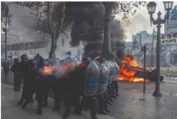
Police fire tear gas at anti-government protesters outside Congress, where lawmakers debate a reform bill promoted by Argentine President Javier Milei in Buenos Aires, Argentina, Wednesday.

In a reflection of the fierce backlash to the legislation and deep polarisation gripping Argentina's Congress, Vice President and head of the Senate Victoria Villarruel cast the tiebreaking vote in favour