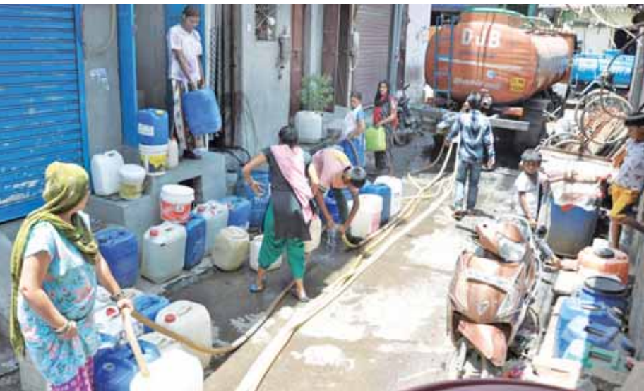
Residents of Anand Parbat area fill drinking water from a Delhi Jal Board tanker amid a water crisis in the national Capital