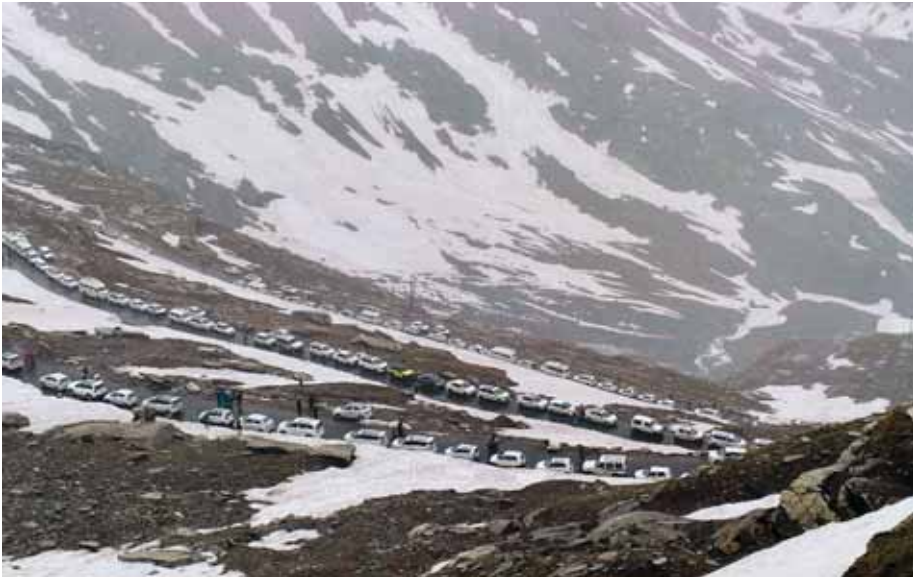
Traffic congestion on a road owing to tourists' rush near Rohtang Pass, in Manali, on Thursday