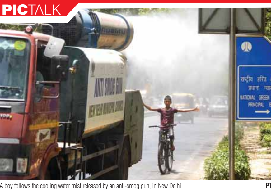
A boy follows the cooling water mist released by an anti-smog gun, in New Delhi

Delhi's water supply is significantly impacted by the historically low levels of the Yamuna river; in fact, some areas get water for only a few hours a day. Concerns over water-borne illnesses have been raised, which has led to disputes over access to water and forced many people to rely on contaminated sources. Water rationing, the establishment of cooling facilities and the distribution of drinking water to communities badly impacted by the problem are just a few of the steps the administration has taken. However, because of the situation's seriousness, these actions have not seen much success. Long-term fixes are necessary to preempt disasters. This entails making investments in infrastructure for water conservation, such as effective irrigation systems and rainwater collection, as well as encouraging the groundwater resources to be used sustainably. To counter the urban heat island effect, green spaces and cooling strategies must be included in urban planning. Furthermore, raising people's knowledge of climate change and its effects helps promote a resilient culture. Millions of people are starkly reminded of their vulnerability in the face of climate change by the heat and water crises in north India. The people of this country continue to be its greatest strength as it fights this humanitarian and environmental crisis.