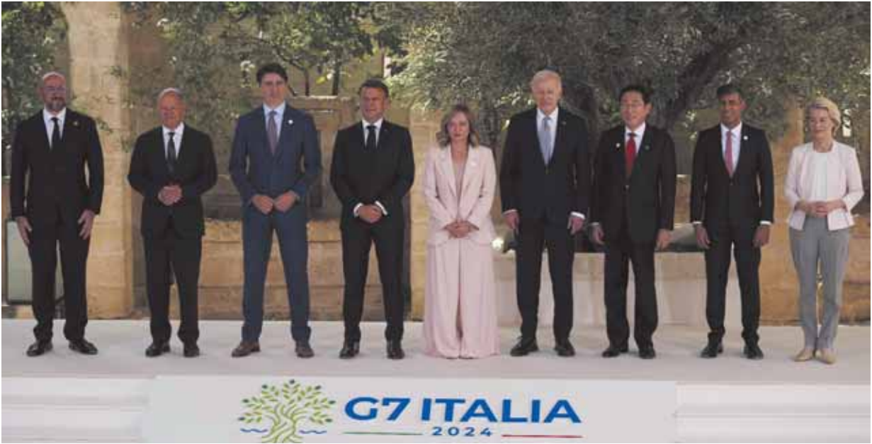
From left: European Council President Charles Michel, German Chancellor Olaf Scholz, Canada's Prime Minister Justin Trudeau, French president Emmanuel Macron, Italian Premier Giorgia Meloni, U.S. President Joe Biden, Japan's Prime Minister Fumio Kishida, British Prime Minister Rishi Sunak and European Commission President Ursula von der Leyen pose for a family photo at a G7 world leaders summit at Borgo Egnazia, southern Italy, Thursday.

As with any G7, an assortment of anti-global, anti-war and climate activists are staging protests around the summit venue, but far from where the leaders are meeting. One group is staging a "dinner for the poor" on Friday night calling for "peace, the rights of peoples and against the Big 7 who claim to decide the destiny of the world and our planet".