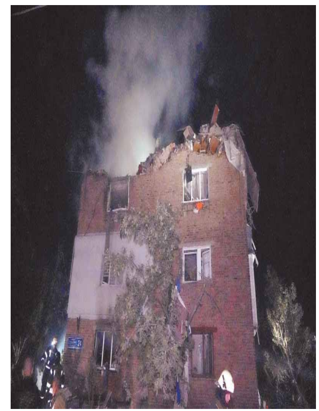
Firefighters put out a fire an apartment building damaged in the Russian missile attack in Kharkiv, Ukraine, Friday.