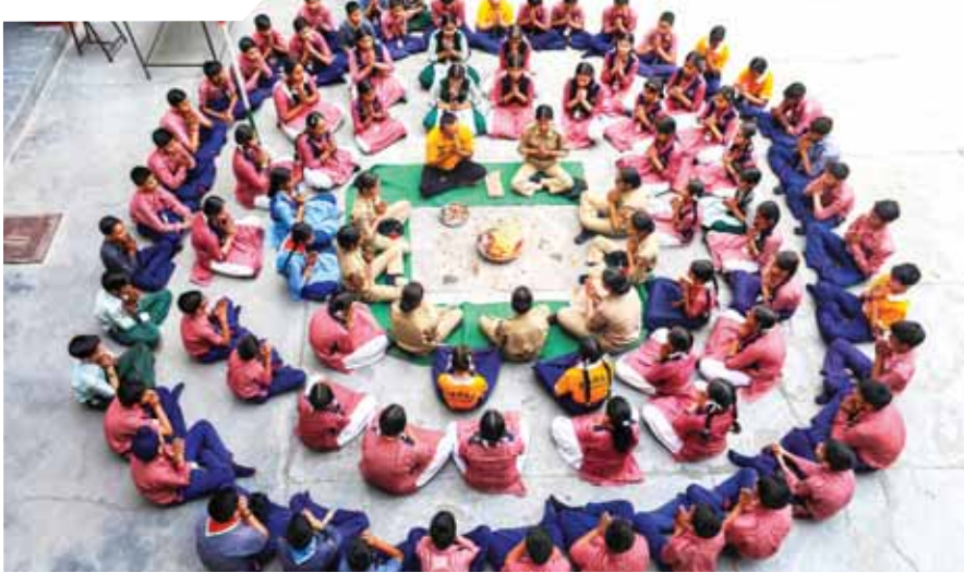
Children of a school offer prayers during a 'havan' for relief from the heatwave, in Jammu