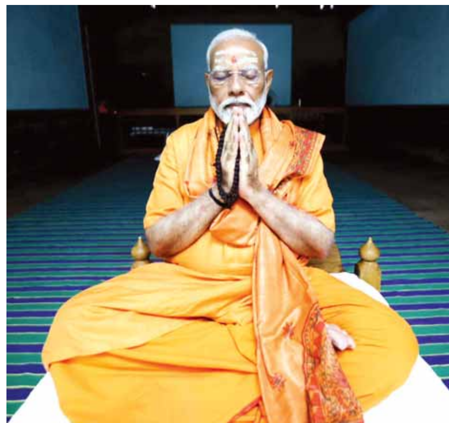
Prime Minister Narendra Modi meditates at the Vivekananda Rock Memorial, in Kanyakumari, on Friday