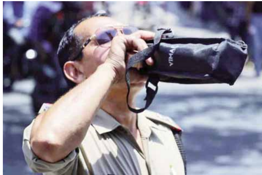
A man gulps water on a hot Friday in Dehradun where the maximum temperature crossed 43 degrees Celsius on Friday.....