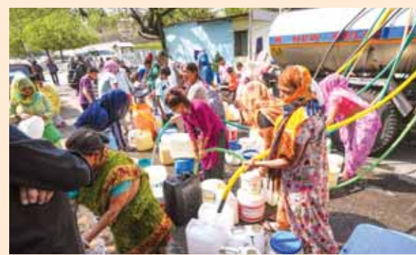
Residents fill water from a tanker amid water crisis at the Vivekanand Camp in Chanakyapuri area of New Delhi on Friday

Relief materials have been distributed to Imphal East, Imphal West, Bishnupur, Noney, Churanchanpur, Senapati and Kakching, the Minister said.