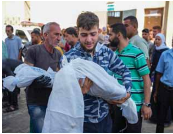
A Palestinian mourner carries the body of a child killed in Israeli bombardment of the Gaza Strip, during their funeral in Deir al Balah, Friday.

Families of Israeli hostages held by Hamas called for all parties to immediately accept a proposal detailed by US President Joe Biden to end the nearly 8-month-long war and bring their relatives home, but Israel's government said conditions for a cease-fire still must be met. Biden outlined a three-phase deal Friday proposed by Israel to Hamas, saying the militant group is "no longer capable" of carrying out another large-scale attack on Israel. He urged the Israelis and Hamas to come to an agreement to release some 100 remaining hostages, along with the bodies of around 30 more, for an extended cease-fire. Cease-fire talks ground to a halt last month after a major push by the US and other mediators to secure a deal in hopes of averting a full Israeli invasion of Gaza's southern city of Rafah. Israel says the Rafah operation is vital to uprooting Hamas