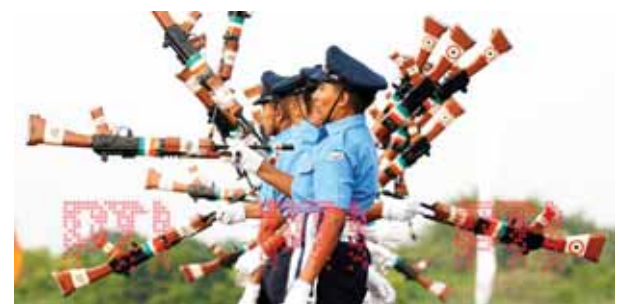
PTI ■ CHENNAI