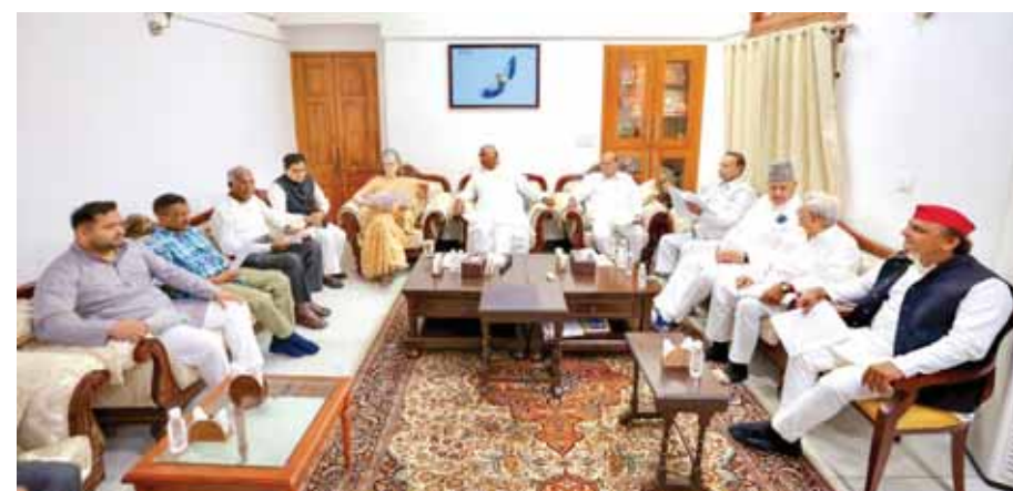
Congress leaders Mallikarjun Kharge, Sonia Gandhi, National Conference leader Farooq Abdullah, CPI(M)'s Sitaram Yechury, Samajwadi Party leader Akhilesh Yadav, RJD leader Tejashwi Yadav, AAP leaders Arvind Kejriwal and Sanjay Singh, CPI's D Raja during the INDIA Bloc's meeting in New Delhi on Friday

Congress president Mallikarjun Kharge on Saturday claimed that INDIA Bloc coalition will register a win over 295 plus Lok Sabha seats in the seven-phase general elections 2024 that concluded on Saturday. Kharge, along with top leaders of the Bloc including former Congress chief Sonia Gandhi, met at the residence of Congress president to discuss their strategy for the counting of votes on June 4. "INDIA Bloc will get a big majority, we have a people's survey with us," Kharge said after the Opposition meeting. He said the parties have also sought time from the Election Commission of India on Sunday for steps to be taken during counting of votes besides having conveyed their workers not to leave the counting hall till all formalities are over on June 4. Senior leaders of the Congress, Samajwadi Party,