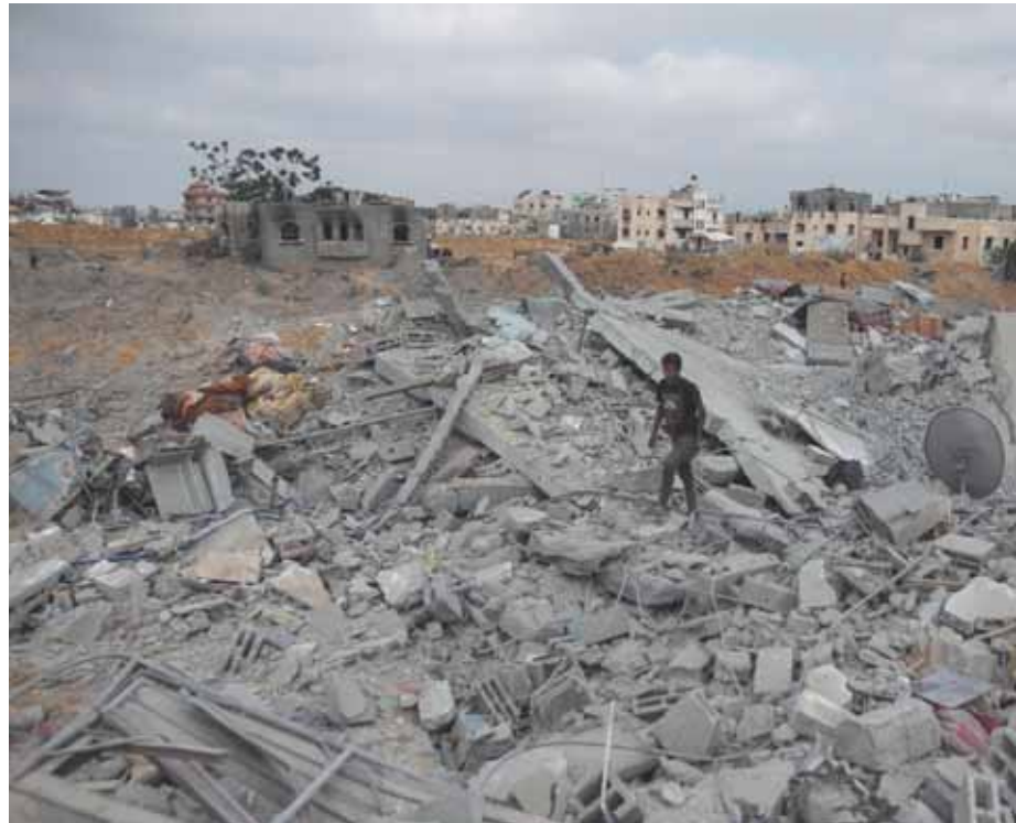
Palestinians look at the destruction after an Israeli airstrike in Khan Younis, Gaza Strip, Monday.

started more than a decade ago, but have not succeeded despite at times looking "promising". The Maldivian cabinet on Sunday also decided to appoint a special presidential envoy to identify the areas in which Palestine requires support from the Maldives and organise fundraising events to assist Palestinians through the UN Relief and Works Agency for Palestine Refugees in the Near East. The Gaza conflict began on October 7 after Hamas initiated an attack on Israel, killing over 800 and capturing 240 hostages, according to Israeli authorities. Israel launched a massive counter-offensive against the Palestinian militant group that has ruled Gaza since 2007. More than 36,000 people, including women and children, have been killed in Gaza in Israel's action, according to the Hamas-run health ministry in Gaza.