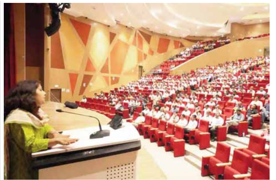
Personnel on vote counting duty participate in a training session in Dehradun on the eve of counting of votes polled in the Lok Sabha election

the dates of the local body elections, the BJP organisation and the government are prepared for the local body polls. Referring to the allegations levelled by the Congress, he said that the Congress will lose irrespective of when the local body elections are held.