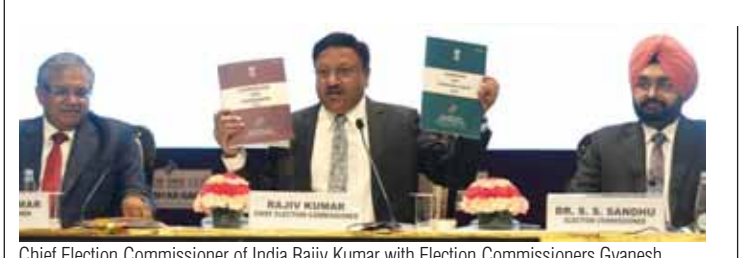
Chief Election Commissioner of India Rajiv Kumar with Election Commissioners Gyanesh Kumar and Dr SS Sandhu during a Press conference, in New Delhi, on Monday

mark of 272 seats needed to form the Government. The Congress and other INDIA Bloc parties have trashed the exit polls, claiming that these surveys were a work of "fantasy" and asserting that the opposition alliance will form the next Government. Further, the Congress led INDIA Bloc on Monday said the Election Commission (EC) has agreed to its request of counting the postal ballots first on June 4, when the results of the Lok Sabha polls are scheduled to be declared, and stressed that this is the participatory manner of promoting the spirit of democracy in a non-adversarial fashion.