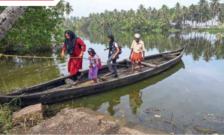
Children travel via a boat to reach their school that reopened after the summer vacation, in Thiruvananthapuram