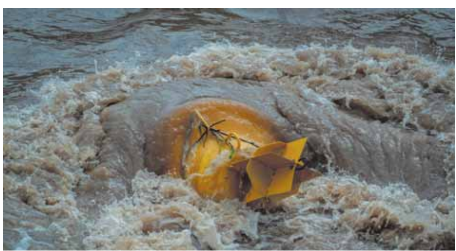
A buoy is pictured as the river Neckar has left its banks in Heidelberg, Germany on Monday. Big parts of southern Germany have been flooded after heavy rainfalls during the last days. In background the castle.

The floods caused extensive transport disruption, with long-distance rail routes to Munich from the north and west out of action on Monday. Scholz visited Reichertshofen, north of Munich, inspecting a sandbagged river bank and meeting regional officials including Markus Söder, Bavaria's governor.