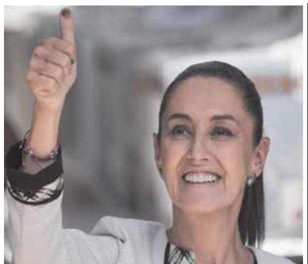
Ruling party presidential candidate Claudia Sheinbaum shows her ink-stained thumb after voting during general elections in Mexico City, Sunday.

more aggressive approach toward organised crime. By Monday morning, with the 76.1% of the polling place tallies counted by Mexico's electoral authority, Sheinbaum had 58.6% of the vote, followed by Gálvez with 28.3%. Longshot candidate Jorge Álvarez Máynez trailed with 10.5% of the vote. Sheinbaum's Morena party was also projected to hold its majorities in both chambers of Congress. If the margin holds, it would approach López Obrador's landslide victory in 2018. He won the presidency after two unsuccessful tries with 53.2% of the votes, in a three-way race where National Action took 22.3% and the Institutional Revolutionary Party took 16.5%. The elections were widely seen as a referendum on López Obrador, who has expanded social programs but largely failed to reduce cartel violence in Mexico. In Mexico City's main plaza, the Zocalo, Sheinbaum's lead did not draw the kind of cheering, jubilant crowds that greeted López Obrador's victory in 2018. Those present were enthusiastic, but comparatively few in number. Sara Rios, 76, a retired literature professor at Mexico's National Autonomous University, celebrated after hearing that Gálvez had conceded. "The only way that we move forward is by working together," Rios said.