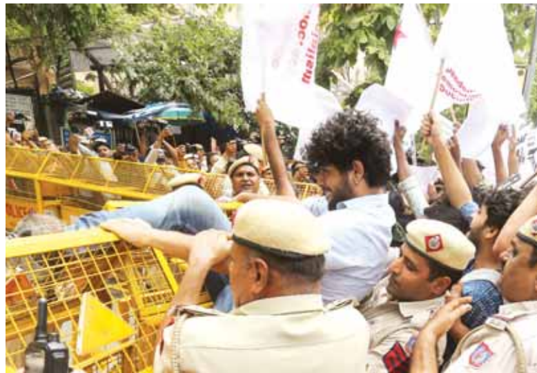
Students stage a protest over the NEET-UG and UGC-NET examinations issue (L) and Congress leader Rahul Gandhi at a Press conference at AICC Headquarters on Thursday

A day after the UGC-NET was cancelled, Education Ministry officials on Thursday said no complaints were received about the exam but a suo motu action was taken on the basis of inputs