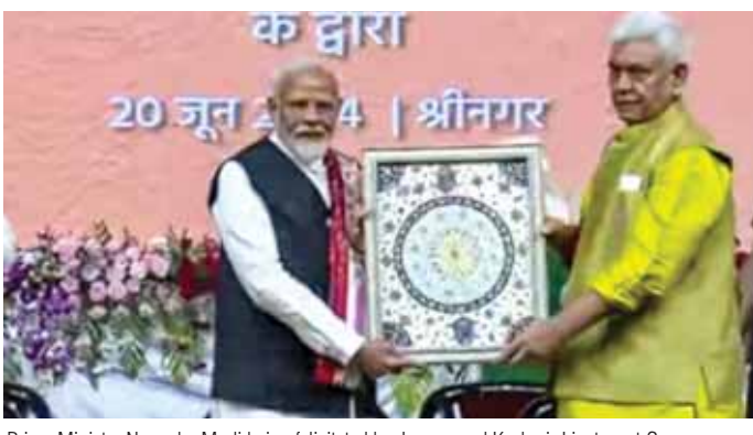
Prime Minister Narendra Modi being felicitated by Jammu and Kashmir Lieutenant Governor Manoj Sinha during "Empowering Youth, Transforming J&K" event, in Srinagar, on Thursday

Addressing a gathering at the 'Empowering Youth, Transforming J&K' event in Srinagar, Modi said the Union Government has taken the recent terror attacks very seriously. "I assure you that we will not hesitate to teach a lesson to the enemies of Jammu & Kashmir." Referring to the much-awaited Assembly polls the Prime Minister said, "The people of Jammu and Kashmir elect their representatives at the local level, through whom you find ways to solve problems, what can be better than this? Therefore, now the preparations for the Assembly elections have also started. The time is not far when you will elect the new Government of Jammu and Kashmir with your votes. That day will also come soon