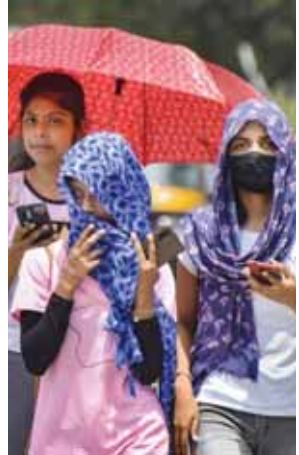
Residents beat the heat with dupatta and umbrella in Delhi File photo

The Centre for Holistic Development (CHD), an NGO working for the homeless, claimed that deaths of 192 homeless people due to extreme heat were recorded in Delhi