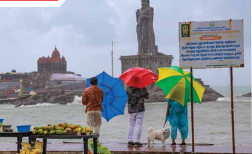
People use umbrellas to shield themselves during rains, in Kanyakumari