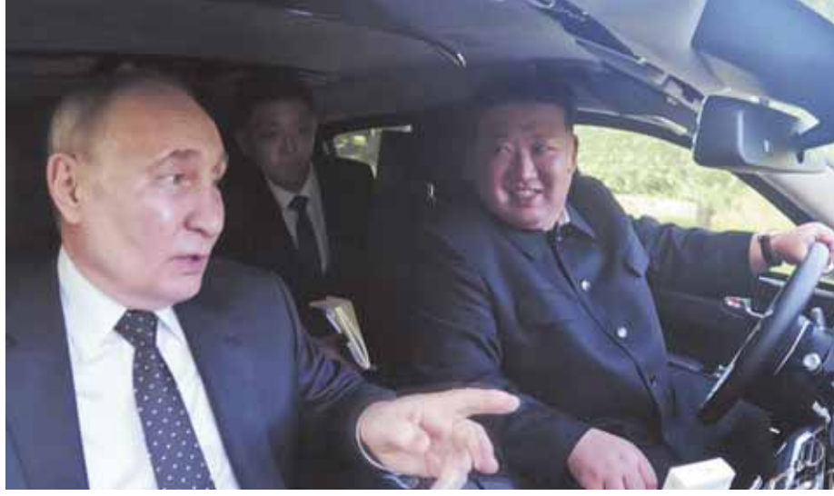
In this photo provided by the North Korean government, North Korean leader Kim Jong Un, right, drives a car which was presented by Russia's President Vladimir Putin, left, at a garden of the Kumsusan State Guest House in Pyongyang, North Korea Wednesday.

Russian President Vladimir Putin signed a series of deals with his Vietnamese counterpart To Lam on Thursday, during a state visit that comes as Moscow is seeking to bolster ties in Asia to offset growing international isolation over its military actions in Ukraine. The two signed agreements to further cooperation on education, science and technology, oil and gas exploration and health. They also agreed to work on a roadmap for a nuclear science and technology centre in Vietnam. Following the talks, Putin said that the two countries share an interest in "developing a reliable security architecture" in the Asia-Pacific Region based on not using force and peacefully settling disputes with no room for "closed military-political blocs".