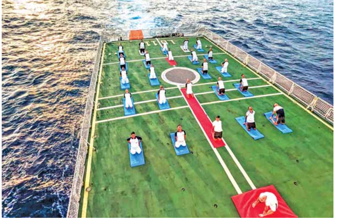
Indian Coast Guard (ICG) personnel perform yoga aboard ICG's ship Samarth during preparations on the eve of the International Day Of Yoga