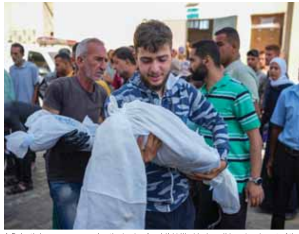
A Palestinian mourner carries the body of a child killed in Israeli bombardment of the Gaza Strip, during their funeral in Deir al Balah, Friday.

Families of Israeli hostages held by Hamas called for all parties to immediately accept a proposal detailed by US President Joe Biden to end the nearly 8-month-long war and bring their relatives home, but Israel's government said conditions for a cease-fire still must be met. Biden outlined a three-phase deal Friday proposed by Israel to Hamas, saying the militant group is "no longer capable" of carrying out another large-scale attack on Israel. He urged the Israelis and Hamas to come to an agreement to release some 100 remaining hostages, along with the bodies of around 30 more, for an extended cease-fire. Cease-fire talks ground to a halt last month after a major push by the US and other mediators to secure a deal in hopes of averting a full Israeli invasion of Gaza's southern city of Rafah. Israel says the Rafah operation is vital to uprooting Hamas