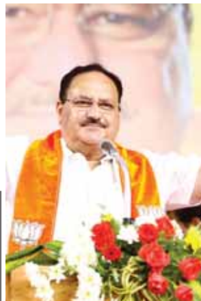
more than 370 Lok Sabha seats and the NDA more than

PIONEER NEWS SERVICE ■ NEW DELHI People have voted for a capable, powerful, developed and self-reliant India and to put aside appeasement, nepotism and corruption, BJP chief JP Nadda said on Saturday, exuding confidence that his party will win