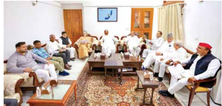
Congress leaders Mallikarjun Kharge, Sonia Gandhi, National Conference leader Farooq Abdullah, CPI(M)'s Sitaram Yechury, Samajwadi Party leader Akhilesh Yadav, RJD leader Tejashwi Yadav, AAP leaders Arvind Kejriwal and Sanjay Singh, CPI's D Raja during the INDIA Bloc's meeting in New Delhi on Friday

Kharge, along with top leaders of the Bloc including former Congress chief Sonia Gandhi, met at the residence of Congress president to discuss their strategy for the counting of votes on June 4. "INDIA Bloc will get a big majority, we have a people's survey with us," Kharge said after the Opposition meeting. He said the parties have also sought time from the Election Commission of India on Sunday for steps to be taken during counting of votes besides having conveyed their workers not to leave the counting hall till all formalities are over on June 4. Senior leaders of the Congress, Samajwadi Party,