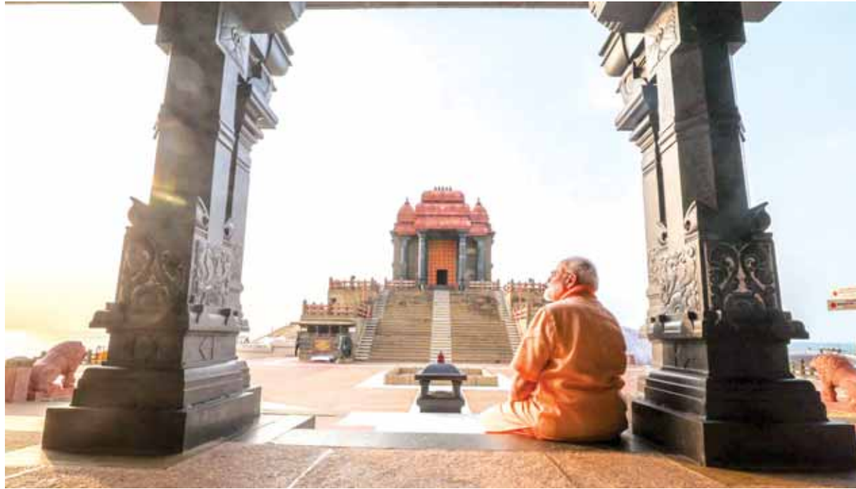
Prime Minister Narendra Modi at the Vivekananda Rock Memorial in Kanyakumari

The counting of votes will be taken up on June 4. In Arunachal Pradesh and Sikkim, the counting for the