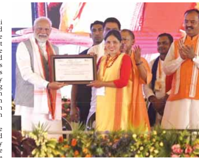
Prime Minister Narendra Modi with CM Yogi Adityanath attends the Kisan Samman Sannam, in Varanasi, on Tuesday

The PM attributed the success in winning a third term for his Government to the achievements of the past decade, which focused on the comprehensive growth of farmers, youth, women, and the poor. He highlighted the massive participation of about 64 crore voters in the world's largest democratic election, which he compared to being 1.5 times larger than the combined population of the G7 countries and 2.5 times larger than that of