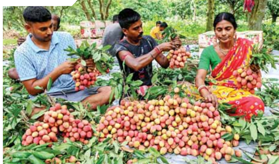
Farmers prepare bunches of harvested litchi, at an orchard, in Nadia