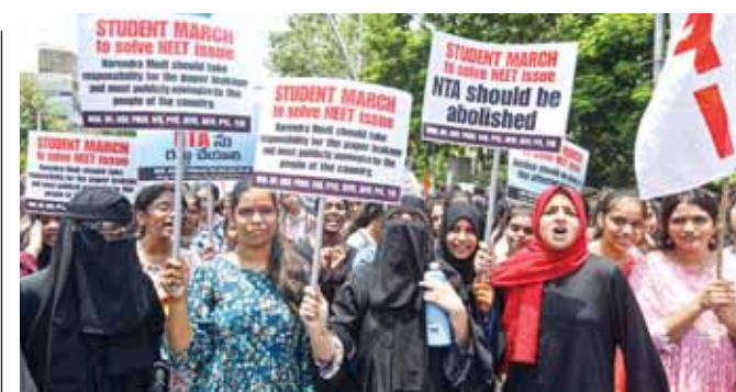
Members of various student unions take part in a protest rally over the alleged irregularities in NEET 2024 exam results, in Hyderabad, on Tuesday