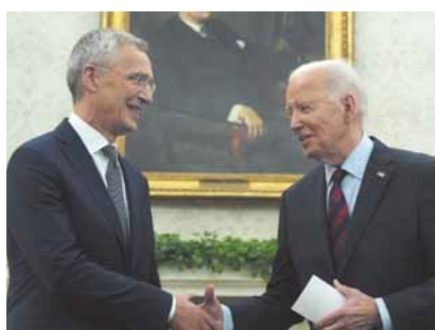
President Joe Biden meets with NATO Secretary General Jens Stoltenberg in the Oval Office at the White House, Monday.

married to a US citizen could also potentially qualify for the same process, according to senior administration officials who briefed reporters on the proposal on the condition of anonymity. There is no requirement on how long the couple must have been married, and no one becomes eligible after Monday. That means immigrants who reach that 10-year mark after Monday will not qualify for the program, according to the officials.