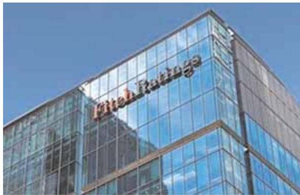
Bank (ADB) estimates growth at 7 per cent, S&P Global Ratings and Morgan Stanley project growth rate of 6.8 per cent.

from the March GEO)," Fitch said in its global economic outlook report. Investment will continue to rise but more slowly than in recent quarters, while consumer spending will recover with elevated consumer confidence, it said. For the fiscal years 2025-26 and 2026-27, Fitch projected growth rates of 6.5 per cent and 6.2 per cent, respectively. Fitch's estimates for FY25 are in line with that of RBI which earlier this month projected Indian economy to expand 7.2 per cent in the current fiscal on the back of improving rural demand and moderating inflation. While the Asian Development