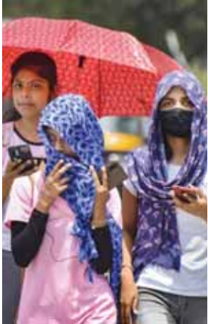
Residents protect themselves from blistering heat in Delhi File photo

With a severe heatwave sweeping vast swathes of the country, the National Capital has seen a huge upsurge in mortalities caused by sunstrokes and other heat-related ailments. As more than 210 people have so far succumbed to the heat fury not seen in decades in Delhi or elsewhere in the country. Of the 210 dead in Delhi, 192 were homeless people who have been bearing the brunt of the extreme heat in the city. A total of 22 fatalities caused by suspected heat-related illnesses have been recorded at the Ram Manohar Lohia and Safdarjung hospitals in the last 24 hours. The Centre for Holistic Development (CHD), an NGO working for the homeless, claimed that deaths of 192 homeless people due to extreme heat were recorded in Delhi between June 11 and June 19,