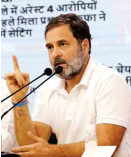
Congress leader Rahul Gandhi at a Press conference at AICC Headquarters on Thursday