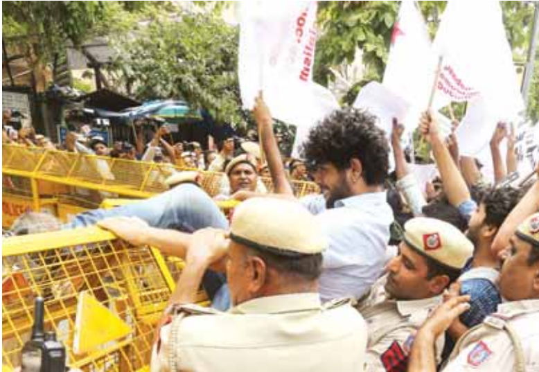
Students stage a protest over the NEET-UG and UGC-NET examinations issue (L) and Congress leader Rahul Gandhi at a Press conference at AICC Headquarters on Thursday

A day after the UGC-NET was cancelled, Education Ministry officials on Thursday said no complaints were received about the exam but a suo motu action was taken on the basis of inputs available with them to protect