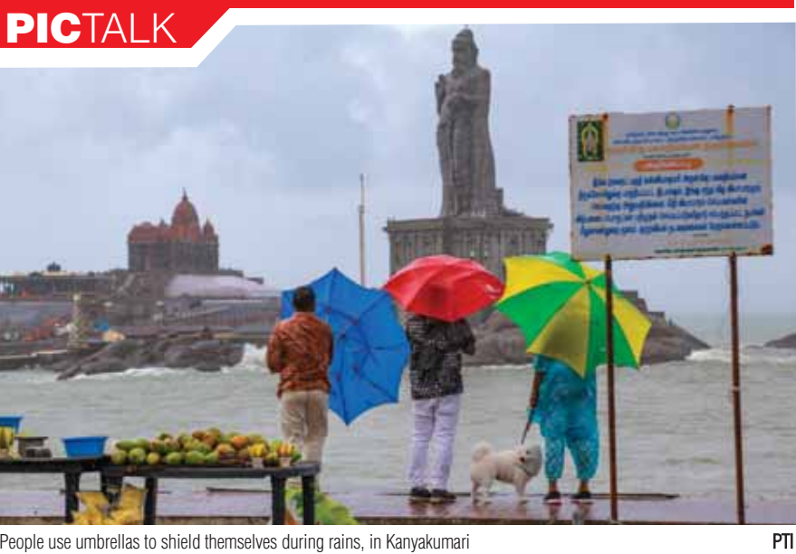
People use umbrellas to shield themselves during rains, in Kanyakumari

and unpredictable market prices, further exacerbates the financial instability of farmers. These factors underscore the need for interventions that go beyond MSP hikes to address the underlying challenges faced by farmers. While the MSP increase is a positive step, it alone is unlikely to resolve the multifaceted issues confronting the agricultural sector. Comprehensive reforms are essential to ensure sustainable improvements in the livelihoods of farmers. To achieve this, the Government must consider a holistic approach that includes enhancing agricultural infrastructure, improving access to credit and providing insurance against crop failures. Encouraging crop diversification and improving market access can also help mitigate risks associated with price volatility and reduce farmers' reliance on a few staple crops. Strengthening procurement systems to ensure timely procurement and fair pricing is crucial to making the MSP more effective. The Cabinet's approval of increased MSP for 14 Kharif crops, though inadequate, is a welcome development that reflects the Government's recognition of the pressing challenges faced by the agricultural sector. A concerted effort to implement systemic reforms alongside fair pricing mechanisms is essential for the advancement of India's farmers and the agricultural sector as a whole..