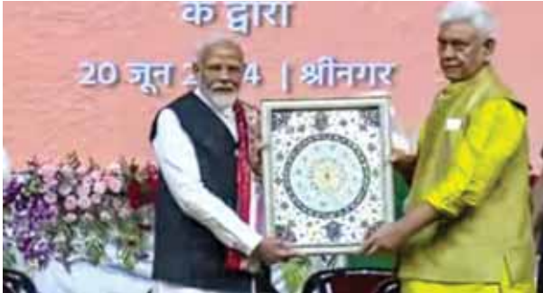
Prime Minister Narendra Modi being felicitated by Jammu and Kashmir Lieutenant Governor Manoj Sinha during "Empowering Youth, Transforming J&K" event, in Srinagar, on Thursday