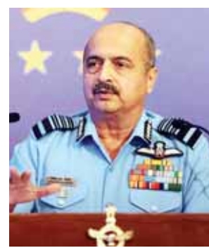
PIONEER NEWS SERVICE ■ NEW DELHI

"This 'multi-faceted landscape' requires such military personnel who are not only adept at combat but also possess a deep