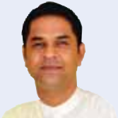
RAJYOGI BRAHMAKUMAR NIKUNJ JI

The world is a stage where we each have a unique, pre-scripted part to play