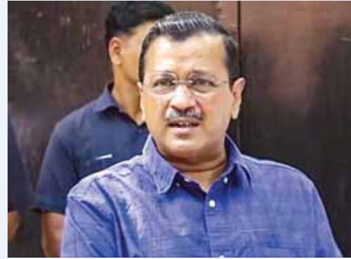
Delhi Chief Minister Arvind Kejriwal File photo

"The Vacation Judge while passing the Impugned Order did not appropriately appreciate the material/documents submitted on record and pleas taken by ED and