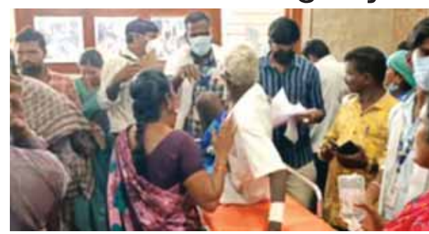
■ NEW DELHI

The National Human Rights Commission (NHRC) on Tuesday said it has issued notices to the Tamil Nadu Government and police chief in connection with the hooch tragedy in Kallakurichi district and sought a report in a week. The death toll in the Kallakurichi hooch tragedy climbed to 58 on Monday. As many as 219 people have been admitted to various hospitals.