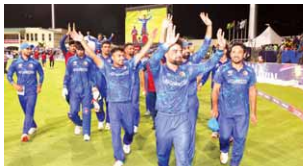
After scripting history on Tuesday by storming into the semi-finals of T20 World Cup, Afghanistan players celebrate

Sachin Tendulkar, Virender Sehwag, former Australia all-rounder Tom Moody, almost all Indian Premier League (IPL) teams and former India cricketers Yuvraj Singh,