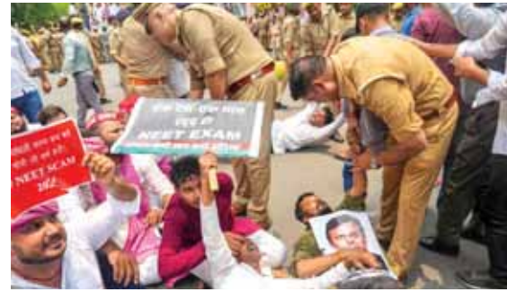
Police personnel detain Samajwadi Party workers protesting over the alleged irregularities in NEET 2024 results, near party chief Akhilesh Yadav's residence, in Lucknow, on Tuesday

According to sources present in the meeting, the committee took stock of the current situation and