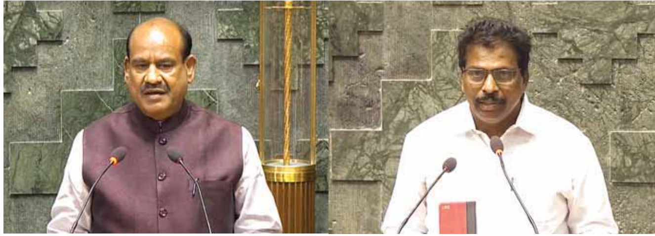
BJP MP Om Birla takes oath as a member of the House during the first session of the 18th Lok Sabha, in New Delhi, on Tuesday. Congress MP Kodikunnil Suresh (R) takes oath as a member of the House on Monday

"I appeal again that they should think about keeping in mind the dignity of the post of Speaker. We have the numbers but still, we are requesting that there should be no election for the post of Speaker because this post does not belong to any party," the