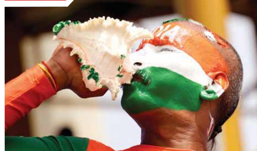
An Indian cricket fan blows into a shell horn prior to the ICC Men's T20 World Cup cricket match