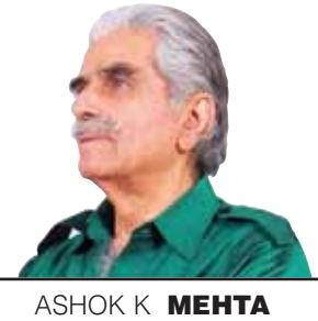
ASHOK K MEHTA

The Govt's decision to extend the tenure of Chief of Army Staff by 30 days, instead of announcing the new appointee has sparked controversy and conjecture