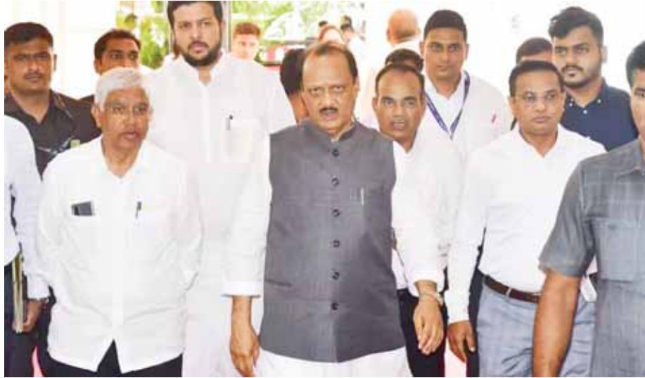
Security Guard and Sashastra Seema Bal. “This will benefit approximately twelve thousand soldiers,” he said. In two other fiscal reliefs, Ajitdada announced a reduction in Stamp Duty penalty

Ajitdada — as Ajit Pawar is known in the state political circles — announced a reduction in tax on diesel in greater Mumbai, Thane and Navi Mumbai from 24 per cent to 21 per cent, tax on petrol from 26 per cent plus Rs 5.12 per litre to 25 per cent plus Rs 5.12 per litre. “Owing to the reduction in tax, the price of petrol per litre in the municipal areas of Thane, Brihanmumbai and Navi Mumbai will come down by approximately 65 paise per litre, while the diesel price will get reduced by approximately Rs. 2.07 per litre,” Ajitdada said. In another fiscal relief, the deputy chief minister announced exemption from professional tax for soldiers working for five central armed forces — the Assam Rifles, Central Industrial Security Force, Indo-Tibetan Border Police, National