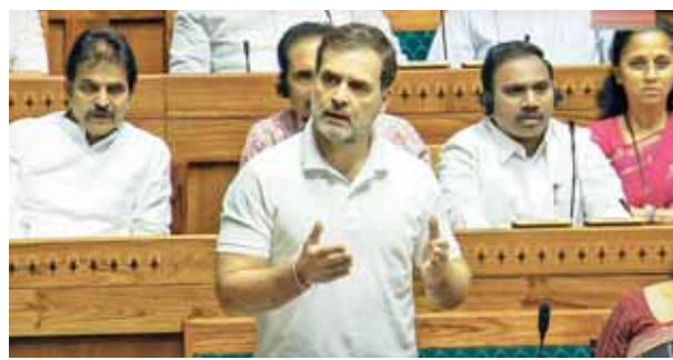
Leader of Opposition Rahul Gandhi speaks in the Lok Sabha during ongoing Parliament session in New Delhi on Friday

Both Dhankar and Speaker Om Birla and Parliamentary Affairs Minister Kiren Rijiju told Opposition members that they could discuss the matter during the course of the Motion of Thanks on the President's address but the