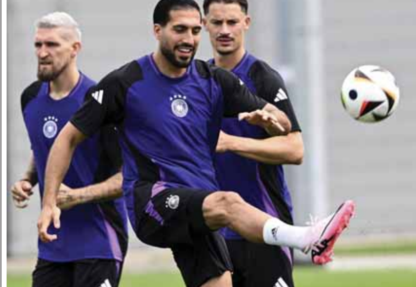
AP ■ DORTMUND (GERMANY)

Germany takes on Denmark in the Ground of 16 at Euro 2024 on Saturday. Germany will have to make changes in defense for the game as it tries to carry the host-nation buzz deeper into the knockout stages. Kickoff is at 9 p.m. Local (1900 GMT) in Dortmund. Here's what to know about the match: Match facts- This is the only game in the round of 16 that features two unbeaten teams. Germany finished top of Group A with wins over Scotland and Hungary and a draw with Switzerland. Denmark drew all of its games against Slovenia, England and Serbia. - Germany was eliminated by eventual runner-up England in the round of 16 at Euro 2020 and hasn't won a knockout