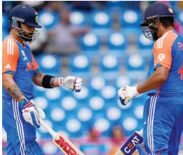
For Kohli, it will be the completion of a cycle with all three ICC white-ball trophies (2011 ODI World Cup, 2013 Champions Trophy) in

Zimbabwe series would certainly usher in a new dawn keeping in mind the 2026 T20 World Cup in India. To prepare for any global trophy, the core needs to be finalised two years in advance and in 2026, a 39-year-old Rohit or a nearly 38-year-old Kohli or even Jadeja are unlikely to fit in. At this point, with the focus firmly on the final, no one wants to use the sensitive 'R' word as far as T20Is are concerned but it is believed that if India can beat South Africa in Barbados on Saturday, both skipper Rohit and Kohli would know that in this format, they have nothing more left to achieve. There may or may not be a formal announcement as they would continue to be a part of IPL, where they are still two of the biggest brands apart from Mahendra Singh Dhoni and the non-cricketer -- Shah Rukh Khan.