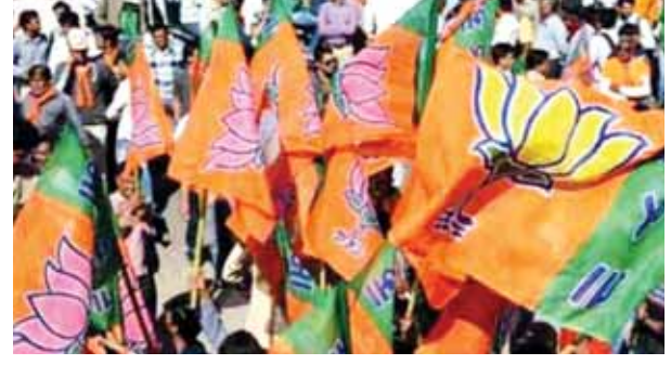
A group of people protesting, holding flags and banners.

Karnataka BJP on Thursday held a state-wide protest against the Congress government over alleged illegal money transfer scam involving a state-run corporation, and demanded Minister Siddaramaiah's resignation. BJP workers and leaders held demonstrations in front of the Deputy Commissioner's office in almost all districts in the state, party sources said.