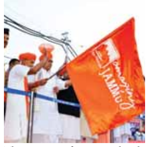
The UT Administration has made elaborate arrangements for the safe and hassle-free pilgrimage of the devotees of Shri Amarnath Ji. Lt-Gov Sinha is scheduled to perform ‘pratham pooja’ inside the holy cave shrine on day one of the yatra. To facilitate pilgrims the Shrine Board authorities have also made elaborate arrangements for ‘spot’ registration to facilitate the rush of pilgrims. According to an advisory issued by the Shri Amarnathji Shrine Board authorities, “It is mandatory for all the yatri to wear the RFID card issued by Shri Amarnathji Shrine Board (SASB) at all times during the yatra.” “No Yatri shall be allowed to enter the yatra area without an RFID card.” The Yatri has also been asked to wear comfortable clothes during the yatra period.

The first batch of 4603 pilgrims embarked on the ‘spiritual’ journey under ‘unprecedented’ security cover from Jammu-based yatri niwas in the wee hours of Friday. The convoy of the pilgrims, comprising 231 light and heavy motor vehicles, was flagged off by Lieutenant Governor Manoj Sinha soon after performing traditional prayers at the base camp. The atmosphere inside the base camp was upbeat since early morning as many pilgrims from different states were seen singing praises of Lord Shiva and chanting Vedic mantras before embarking on the journey. The Lt Governor wished all the devotees a safe and spiritually fulfilling journey and prayed for all peace, prosperity, and happiness. He blessed the Baba Amarnath ji bring peace, happiness and prosperity to everyone’s life,” he said.