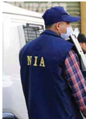
more charge sheets against

The National Investigation Agency (NIA) Friday conducted searches in Gujarat and Maharashtra on the premises of those suspected to have received money from Pakistan to spy on Indian defence establishments. The searches were conducted in a case registered by the NIA in June last year. The agency filed a charge sheet in July 2023 against two accused including an absconding Pakistani national. This was followed by two