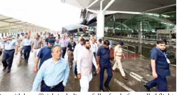
ing with key officials including the Secretary of the Ministry of Civil Aviation, Director General of Civil Aviation, Chairman of the Airports Authority of India, Director General of the Bureau of Civil Aviation Security, and Joint Secretaries of the Ministry of Civil Aviation. It was decided that 24/7 War Room Establishment & efficient management of T2 & T3 A 24/7 War Room will be established under the close monitoring of the Ministry of Civil Aviation. This War Room will ensure the

Passengers, who were scheduled to travel out of the national capital, on Friday morning from Delhi Airport Terminal-1 but could not due to the temporary shutdown following a roof collapse will get a full refund. The Ministry of Civil Aviation on Friday asked airlines to ensure that there is no abnormal surge in airfares for flights to and from the national capital amid suspension of operations at Delhi airport’s Terminal 1 following the roof collapse incident. Structural Engineers from IIT Delhi have been asked to immediately assess the incident at Delhi T1. Further examination will be decided based on their initial findings. Similarly AAI will have the Jabalpur incident examined. Following the tragedy, Union Civil Aviation Minister Ram Mohan Naidu Kinjarapu convened a high-level review meet-