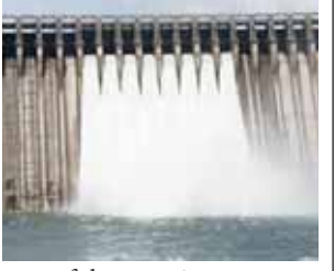
cent of the capacity. The eastern region, including Assam, Jharkhand, Odisha, West Bengal, Tripura, Nagaland, and Bihar has a total live storage capacity of 20.430 BCM in 23 reservoirs. The current storage level is 3.643 BCM or 17.83 per cent of the capacity, slightly less than the 17.84 per cent recorded last year. The western region, comprising Gujarat and Maharashtra, has 49 reservoirs with a total live storage capacity of 37.130 BCM. However, the current storage is 7.471 BCM, or 20.12 per cent of the capacity. The central region, which includes Uttar Pradesh, Uttarakhand, Madhya Pradesh, and Chhattisgarh, has a total live storage capacity of 48.227 BCM across 26 reservoirs. The current storage level is 11.693 BCM, or 24 per cent of the capacity. On the other hand, the southern region, covering Andhra Pradesh, Telangana, Karnataka, Kerala and Tamil Nadu, has a total live storage capacity of 53.334 BCM in 42 reservoirs. The current storage is 8.322 BCM, or 16 per cent of the capacity, down from 20 per cent last year.

The water levels in 150 major reservoirs across India have plummeted to just 20% of their total live storage capacity, as per the latest data from the Central Water Commission (CWC). This marks a concerning trend of declining water reserves, with the levels dropping from 21% two weeks ago and 22% the week before that. The total live storage currently available is 36.368 billion cubic meters (BCM), indicating a critical situation for water availability in the country. The CWC has reported a significant drop in live storage levels across 150 major reservoirs in India. According to the latest CWC bulletin, the total live storage available is 36.368 billion cubic meters (BCM) which is just 20 per cent of the total live storage capacity of these reservoirs. This is a significant decrease from 46.369 billion cubic meters (BCM) recorded during the same period last year and also below the normal storage of 42.645 BCM. The total live storage capacity of these reservoirs is 178.784 BCM, which is about 69.35 per cent of the estimated total live storage capacity of 257.812 BCM in the country. The northern region, comprising Himachal Pradesh, Punjab, and Rajasthan, has a total live storage capacity of 19.663 BCM in 10 reservoirs. Currently, the storage level there is 5.239 BCM or 27 per