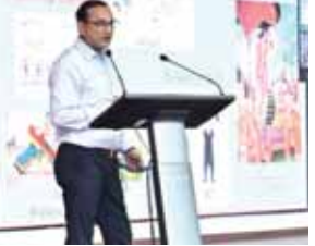
most sensitive and priority issues. He advised for better coordination with frontline staff, better motivation for them, providing proper counselling, imparting relevant training and giving importance to their mental as well as physical health. On an ending note, General Manager advised for better coordination within the various departments. He gave directions to adhere to all safety norms and ensure safety in train operations with top priority. Issues concerning to safe operations of train movements and passenger amenities related issues should be brought out and sorted out on priority basis, the General Manager stated.