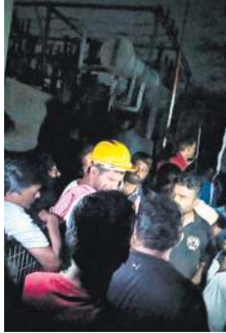
People staging a protest near the Boduppal sub-station

As per TSPDCL, unfortunately, this solution was short-lived. At 9:40 pm, a single-phase power interruption occurred on the incoming 33kV Bandlaguda to Uppal feeder due to a jumper cut. TSPDCL crews worked diligently to resolve the issues, and