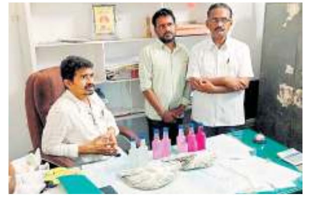
Suryapet Sub-Registrar and document writers who were trapped by ACB in Suryapet on Monday