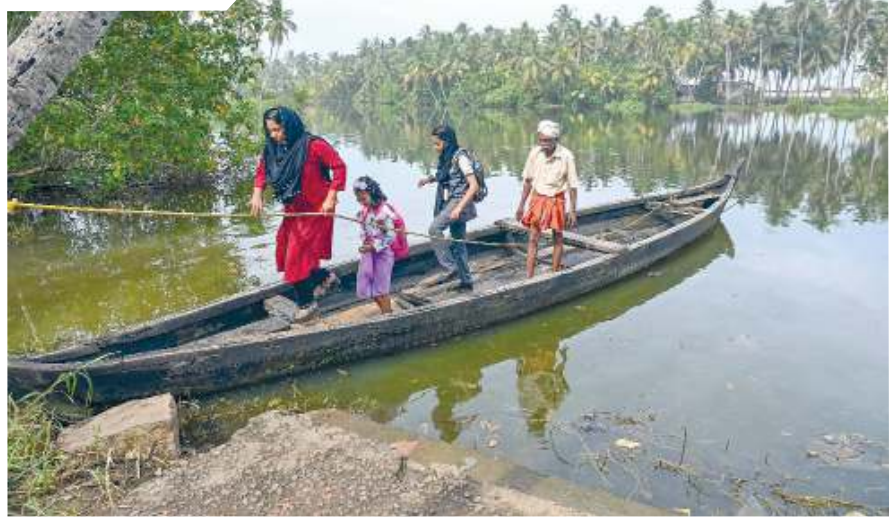
Children travel via a boat to reach their school that reopened after the summer vacation, in Thiruvananthapuram