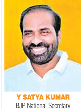
Y SATYA KUMAR BJP National Secretary

communal riots, lynching of the Sikhs, pulling the rug under the feet of the democratically-elected governments, lodging those who questioned the atrocities of government behind bars, honouring those who played the second fiddle to a single political family with plum posts, large-scale scams right from the Bofors scandal to 2G scam involving several lakhs of crores, appeasement politics and los-