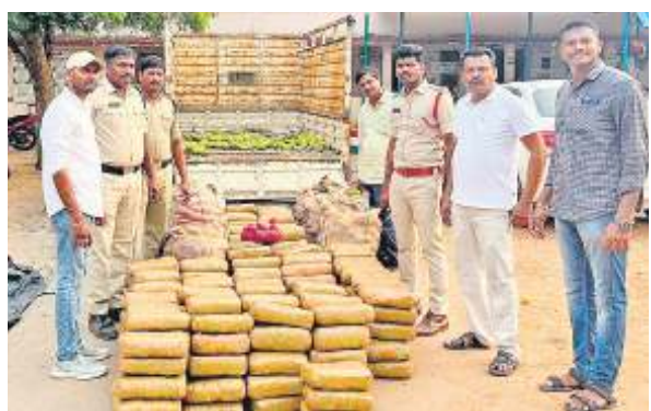
Marijuana seized by police at Mangunur in Bhadradi Kothagudem district on Monday

The case is currently under investigation. The public is reminded to report any demands for bribes by public servants to the ACB's toll-free number 1064 for prompt legal action.