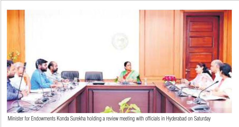
Minister for Endowments Konda Surekha holding a review meeting with officials in Hyderabad on Saturday

On Saturday, Minister Surekha conducted a comprehensive review at her office with the Commissioner of the Department of Endowments, focusing on the festival's logistics, budget allocations, and related matters. She further detailed that the sanctioned Rs 20 crore will cover expenses such as temple decorations,