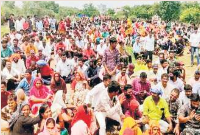
A crowd gathered to resist eviction from encroached land at Miyapur on Saturday

The Minister clarified that the Telangana Congress government is actively coordinating the central organization of this year's Ashada Bonalu festivals.