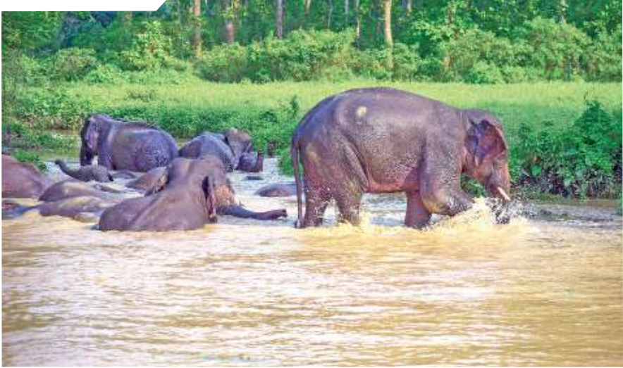
A herd of wild elephants bathes in water to get respite from the heat, in Kamrup