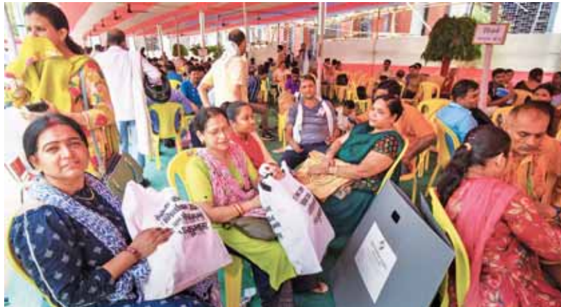
Poll officials collect election material for the last phase of Lok Sabha polls in Patna on Thursday

In Patliputra, RJD president Lalu Prasad's eldest daughter Misa Bharti is trying her luck for the third time. The BJP MP Ram Kripal Yadav, a former close aide of Prasad and ex-Union minister, is aiming at a hat-trick. The BJP also hopes that AIMIM