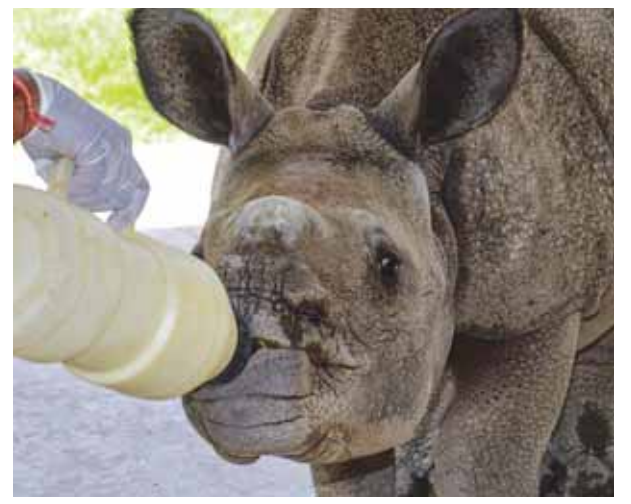
(Top) A female rhinoceros 'Gauri' being given glucose on a hot summer day, in Kanpur and (Below) a man covers his head with a scarf amid heatwave

Chief Minister Yogi said that it was also necessary to take care of the safety of livestock and wildlife amid the scorching heat. "Heatwave action plans should be effectively implemented in all zoological parks and sanctuaries. There should be adequate arrangements to keep livestock safe in the event of heatwave with proper arrangement of green fodder and water for livestock in cow shelters. The process of vaccination of animals should be continued till before the rains," he said. He said that the general public should be made aware of the symptoms of heatwave and its prevention.