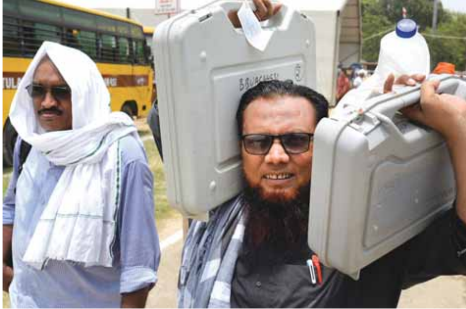
Polling officials carrying the Electronic Voting Machines (EVM) and other election material leave from a distribution centre for their respective polling booths on the eve of the seventh and last phase of the Lok Sabha elections in Varanasi on Friday.