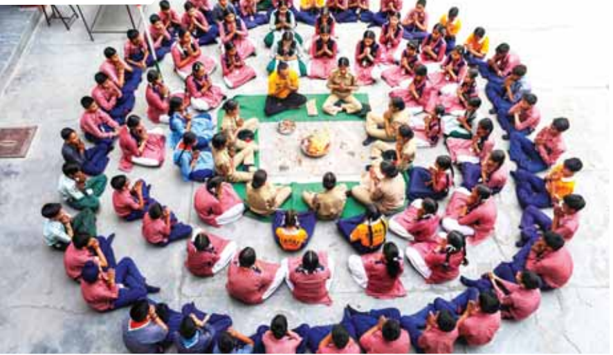
Children of a school offer prayers during a 'havan' for relief from the heatwave, in Jammu