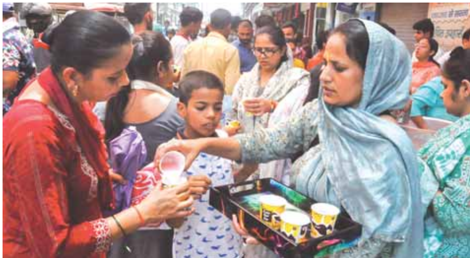
People offer sherbat to commuters during a hot summer day, in Moradabad on Friday

Lucknow recorded a maximum temperature of 45.8 degrees Celsius, Prayagraj 46.8 degrees Celsius, Sultanpur 46.2, Jhansi 47.6, Kanpur 48.2 and Fursatganj 46.4 degree Celsius.