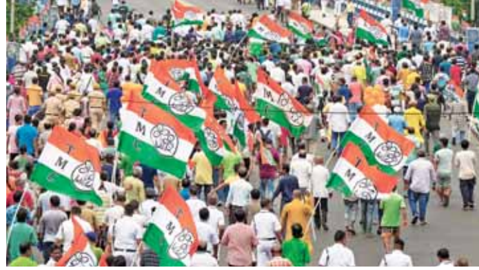
TMC supporters during a roadshow of party candidate from South Kolkata constituency Mala Roy for the last phase of Lok Sabha elections in Kolkata

nephew of Chief Minister Mamata Banerjee. The two-time TMC MP who is pitted in a tri-cornered contest against CPI (M)'s students' leader and son of the soil Pratik Ur Rahman and BJP's Abhijit Das hopes to win the seat by 3 lakh margin on account of his creating Diamond Harbour a "model constituency" a narrative often rejected by the Left that calls it "a model laboratory of violence and cold horror." Besides him TMC leader in Lok Sabha is Sudip Bandopadhyay is contesting from Kolkata North seat against BJP nominee Tapas Roy a former minister who quit the party to join the saffron outfit just before the polls started and Congress veteran and sitting Rajya Sabha member Pradip Bhattacharya. A third such seat is Dum Dum where the TMC veteran and three-time MP Saugato Roy is contesting in a fierce battle against CPI(M) stalwart Sujan Chakrabarty and BJP's Silbhadra Dutta, once a Mukul Roy protégé. Kolkata South that sent Mamata Banerjee to Parliament for six