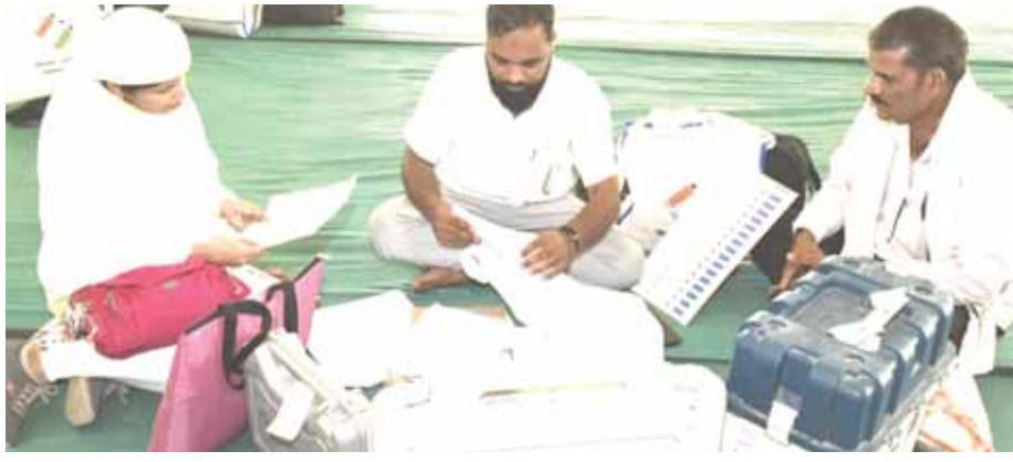
Polling staff on Friday collecting EVMs and other materials before leaving for their assigned centres/booths in Varanasi Lok Sabha constituency

In the high-profile Varanasi Lok Sabha constituency, Bharatiya Janata Party (BJP) candidate, supported by National Democratic Alliance (NDA) and Prime Minister Narendra Modi, seeking a third consecutive win is facing a challenge from six more candidates, including Congress candidate, supported by INDIA bloc, Ajay Rai and Athar Jamal