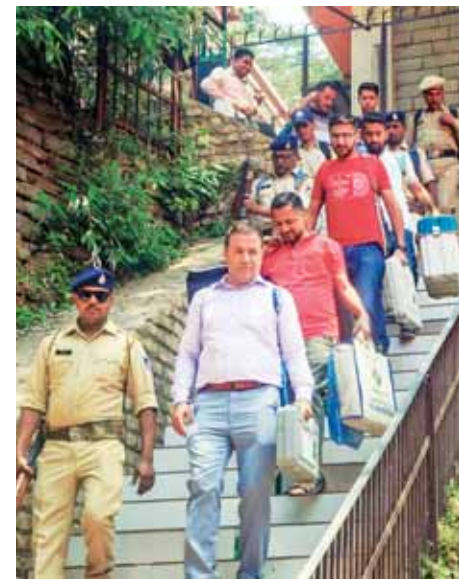
Polling officials leave with EVMs and other election materials for their respective polling booths on the eve of the seventh and last phase of Lok Sabha elections in Shimla

Sukhu attacked the BJP throughout the campaign for allegedly hatching a conspiracy to topple the democratically-elected government in Himachal Pradesh through money power and asserted that the Congress will defeat the saffron party with the power of people.