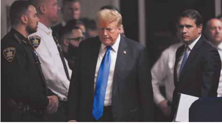
WASHINGTON

Donald Trump has been found guilty of all 34 charges of falsifying business records by a grand jury in New York, an unprecedented and historic verdict that makes him the first former president in American history to be convicted of a felony, as he makes a bid to return to the White House in November. In a landmark verdict, a panel of 12 Manhattan jurors on Thursday said they unanimously agreed that Trump, 77, falsified business records to conceal a USD 130,000 hush money payment to adult film star Stormy Daniels to influence the 2016 presidential election. It will ultimately be up to voters on November 5 to decide the significance of the guilty verdict delivered by 12 ordinary New Yorkers, which, on a legal basis, does not prevent him from being elected president again. Over a six-week trial, the court heard from 22 witnesses, including Daniels, whose alleged sexual encounter with the former president was at the centre of the case. As the verdicts were read, Trump remained silent and still. But the former president spoke to reporters outside the courtroom, calling the trial a "rigged, disgraceful trial" and saying that the "real verdict" will be rendered on Election Day. Prosecutors had argued that, by approving a scheme to disguise the money as legal expenses,