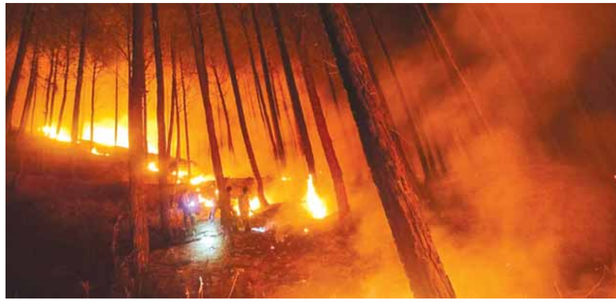
Smoke rises from a forest fire in Uttarakashi district