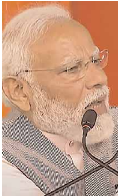
NaMo App, and Nari Vandan conferences. Similarly, Chief Minister Yogi Adityanath participated in public meetings, roadshows, and various conferences, including 13 'prabuddhajan' (intellectuals), women's

Prime Minister Narendra Modi and Chief Minister Yogi Adityanath led the election campaign in Uttar Pradesh by holding rallies and roadshows across the state. Prime Minister Modi campaigned for 58 Lok Sabha candidates through 32 rallies across UP and held roadshows in five cities, including Varanasi. Chief Minister Yogi Adityanath addressed 205 public meetings and roadshows nationwide, with 159 of them in Uttar Pradesh alone. Bharatiya Janata Party president Nadra held nine rallies in UP while Union Home Minister Amit Shah held 38 rallies and roadshows in the state. The election notification was issued on March 16, and the BJP leaders immediately began their campaigns. Chief Minister Yogi Adityanath kicked-off the party's campaign with a conference in Mathura, followed by Prime Minister Modi's first rally in Meerut on March 31. Despite the intense summer heat, all prominent BJP leaders, including the prime minister, vigorously campaigned in UP over the past two and a half months. During the campaign, Prime Minister Modi engaged with the public not only through rallies but also via roadshows, and interacted with BJP workers through the