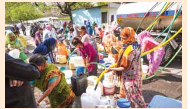
Residents fill water from a tanker amid water crisis at the Vivekanand Camp in Chanakyapuri area of New Delhi on Friday

About four lakh people have been affected in the northeastern States of Assam and Manipur, which have been hit by heavy rain and thunderstorms triggered by Cyclone Remal in the last few days. A total of 1,88,143 people have been affected by floods in Manipur following incessant rainfall in the aftermath of Cyclone Remal, a State Minister said on Thursday. It has also damaged at least 24,265 houses in the last few days, he said. The Central Water Commission said six rivers in Assam and Manipur, including Brahmaputra, and Barak, are experiencing severe flooding, putting numerous districts in the region at risk. Altogether 18,103 people have been evacuated and 56 relief camps were set up, Manipur Minister for Water Resources and Relief & Disaster Management Awangbou Newmai said. Around 401 hectares of crop have been affected, too, he said. Relief materials have been distributed to Imphal East, Imphal West, Bishupur, Noney, Churanbanpur, Senapati and Kakching, the Minister said. Continued on Page 8