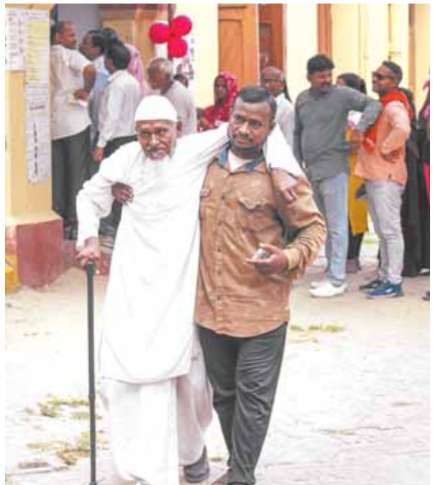
An elderly voter leaves a polling booth after casting his vote during the seventh and last phase of Lok Sabha elections, in Varanasi, on Saturday.

39.25 per cent, including 43.12 per cent in Sewapuri, 40.4 per cent in Rohania. 38.84 per cent in Varanasi North, 37.5 per cent in Varanasi South and 35.95 per cent in Varanasi Cantt. By 1 pm polling percentage was 29.28 per cent in Sewapuri, 27.64 per cent in Rohania, 25.3 per cent in Varanasi North, 20.34 per cent in Varanasi South and 23.8 per cent in Varanasi Cantt. Besides, 30.18 per cent in Ajgara and 28.20 per cent in Shivpur whereas by 9 am it was 12.91 per cent in Varanasi Lok Sabha including 14.46 per cent in Sewapuri, 13.28 per cent in Rohania, 13.82 per cent in Varanasi North, 12.03 per cent in Varanasi South and 11.88 per cent in Varanasi Cantt.