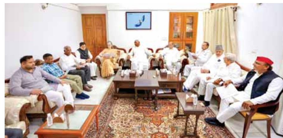
Congress leaders Mallikarjun Kharge, Sonia Gandhi, National Conference leader Farooq Abdullah, CPI(M)'s Sitaram Yechury, Samajwadi Party leader Akhilesh Yadav, RJD leader Tejashwi Yadav, AAP leaders Arvind Kejriwal and Sanjay Singh, CPI's D Raja during the INDIA Bloc's meeting in New Delhi on Friday

Kharge, along with top leaders of the Bloc including former Congress chief Sonia Gandhi, met at the residence of Congress president to discuss their strategy for the counting of votes on June 4. "INDIA Bloc will get a big majority, we have a people's survey with us," Kharge said after the Opposition meeting. He said the parties have also sought time from the Election Commission of India on Sunday for steps to be taken during counting of votes besides having conveyed their workers not to leave the counting hall till all formalities are over on June 4. Senior leaders of the Congress, Samajwadi Party,