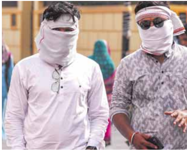
Voters cover themselves in protection against scorching sun as they arrive to cast their votes in Varanasi on Saturday.