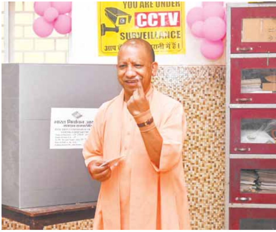
Uttar Pradesh Chief Minister Yogi Adityanath show his inked finger after casting his vote at a polling booth during the seventh and last phase of Lok Sabha elections in Gorakhpur on Saturday.

He said that over the past 10 years, everyone had witnessed a changing India, and in the last seven years, they had seen a