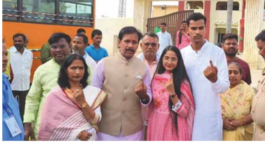
UP Minister Anil Rajbhar after casting his vote in Chandauli Lok Sabha constituency on Saturday.

39.25 per cent, including 43.12 per cent in Sewapuri, 40.4 per cent in Rohania. 38.84 per cent in Varanasi North, 37.5 per cent in Varanasi South and 35.95 per cent in Varanasi Cantt. By 1 pm polling percentage was 29.28 per cent in Sewapuri, 27.64 per cent in Rohania, 25.3 per cent in Varanasi North, 20.34 per cent in Varanasi South and 23.8 per cent in Varanasi Cantt. Besides, 30.18 per cent in Ajgara and 28.20 per cent in Shivpur whereas by 9 am it was 12.91 per cent in Varanasi Lok Sabha including 14.46 per cent in Sewapuri, 13.28 per cent in Rohania, 13.82 per cent in Varanasi North, 12.03 per cent in Varanasi South and 11.88 per cent in Varanasi Cantt.