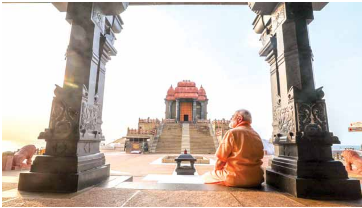
Prime Minister Narendra Modi at the Vivekananda Rock Memorial in Kanyakumari

Violence broke out between TMC and BJP supporters in Sandeshkhali in West Bengal, and complaints of EVM glitches and rigging at some booths were lodged. Barring incidents of clashes in Odisha, voting was almost peaceful. The counting of votes will be taken up on June 4. In Arunachal Pradesh and Sikkim, the counting for the