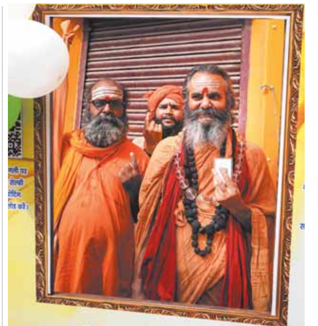
'Sadhus' show their inked fingers as they pose for pictures after casting their votes at a polling booth in Varanasi on Saturday.

stituency, the polling percentage was 56.35 per cent and the maximum voting was seen in Sewapuri 60.93 per cent, followed by 58.77 per cent in Rohania, 57.7 per cent in