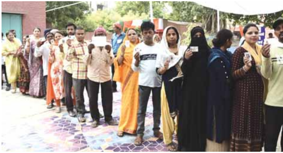
Long queue of voters in Varanasi Lok Sabha constituency on Saturday.

The polling in the high-profile Varanasi parliamentary constituency where Prime Minister Narendra Modi is seeking his third consecutive win was peaceful. The voting was almost peaceful, barring sporadic incidents of altercation and names missing from the voters list. Though enthusiasm was seen everywhere, the polling was heavy in the rural assembly segments of Varanasi Lok Sabha constituency like Rohania and Sewapuri. Similarly, the polling was heavy in two assembly segments of Chandauli parliamentary seat falling in the district. In Varanasi Lok Sabha con-