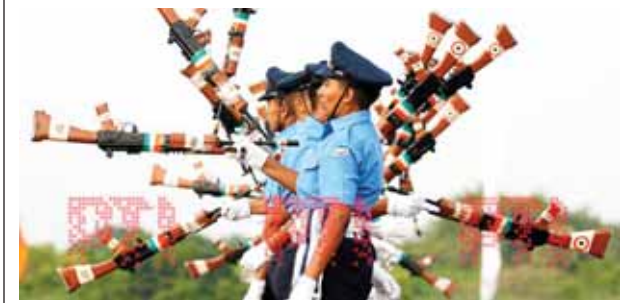
CHENNAI