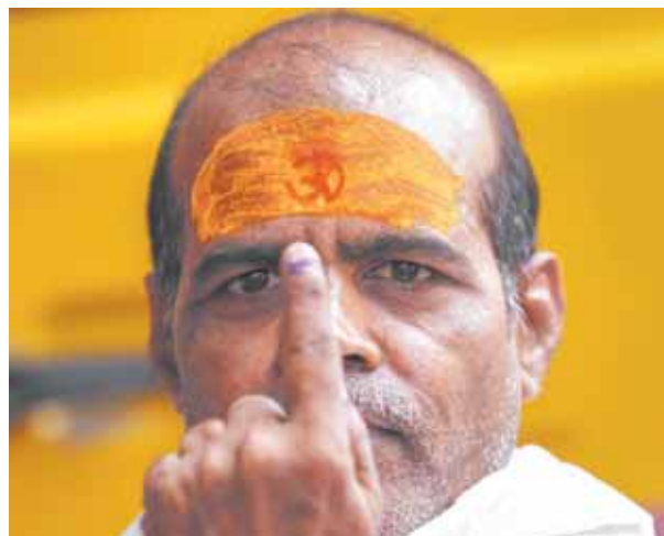
A voter shows his finger marked with indelible ink after casting vote in Varanasi, on Saturday.