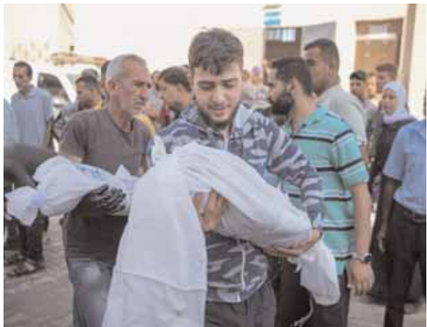
A Palestinian mourner carries the body of a child killed in Israeli bombardment of the Gaza Strip, during their funeral in Deir al Balah, Friday.

Families of Israeli hostages held by Hamas called for all parties to immediately accept a proposal detailed by US President Joe Biden to end the nearly 8-month-long war and bring their relatives home, but Israel's government said conditions for a cease-fire still must be met. Biden outlined a three-phase deal Friday proposed by Israel to Hamas, saying the militant group is "no longer capable" of carrying out another large-scale attack on Israel. He urged the Israelis and Hamas to come to an agreement to release some 100 remaining hostages, along with the bodies of around 30 more, for an extended cease-fire. Cease-fire talks ground to a halt last month after a major push by the US and other mediators to secure a deal in hopes of averting a full Israeli invasion of Gaza's southern city of Rafah. Israel says the Rafah operation is vital to uprooting Hamas