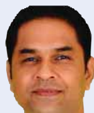
RAJYOGI BRAHMAKUMAR NIKUNJ JI

Spiritual resilience through meditation can help reform criminal behaviour