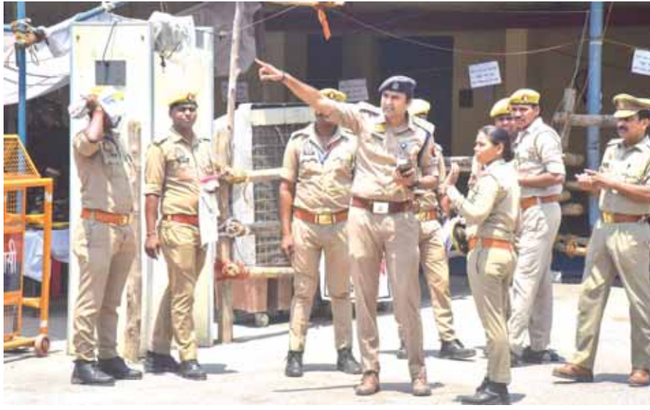
Police personnel outside a counting centre, a day before counting of votes for the Lok Sabha elections in Varanasi on Monday.

The campaign trail also saw Congress chief Mallikarjun Kharge, Bahujan Samaj Party