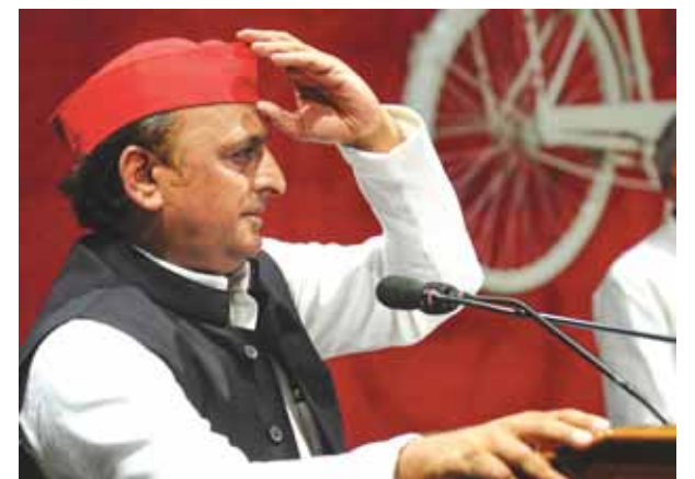
Samajwadi Party president Akhilesh Yadav addresses a press conference at party headquarters in Lucknow on Monday.

Addressing a press conference, Akhilesh Yadav attacked the BJP, raking up several issues such as Manipur violence, Lakhimpur violence, Hathras rape case, unemployment, inflation among others. He asserted that the INDIA bloc's victory will be the victory of the country and its people. At the press conference ahead of the Lok Sabha poll results on Tuesday, the former chief minister of Uttar Pradesh said the INDIA bloc's victory would be the victory of the country and