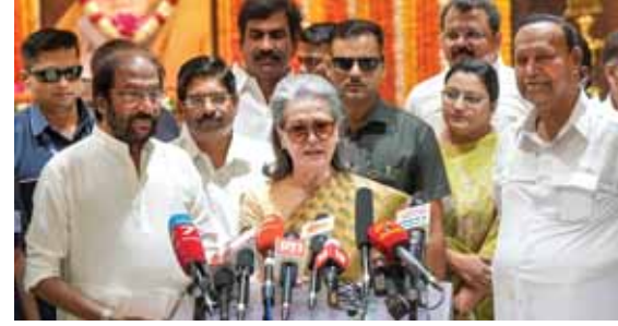
Senior Congress leader Sonia Gandhi speaks with the media during a ceremony to pay tribute to former Tamil Nadu Chief Minister M Karunanidhi on his birth anniversary, at Anna-Kalaignar Arivalayam, in New Delhi on Monday

supporters seeing them as arrangements for celebration of the INDIA Bloc's victory in the Lok Sabha polls despite exit polls suggesting otherwise. Tent-poles have been erected in the grounds of the Congress' 24, Akbar Road headquarters and giant coolers were being set up around its sprawling premises. "We are very hopeful that our results are completely opposite to what the exit polls are showing," the Congress parliamentary party chief added. Sonia Gandhi made the remarks after attending an event held at the DMK office here. She paid tributes to DMK stalwart M Karunanidhi on his 100th