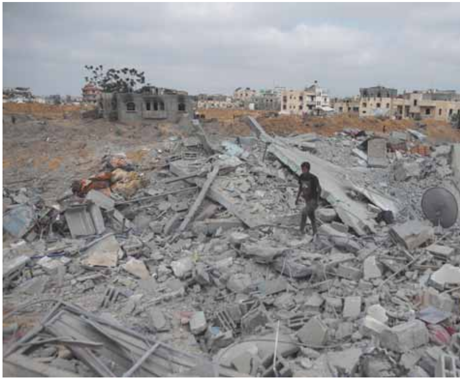
Palestinians look at the destruction after an Israeli airstrike in Khan Younis, Gaza Strip, Monday.

started more than a decade ago, but have not succeeded despite at times looking "promising". The Maldivian cabinet on Sunday also decided to appoint a special presidential envoy to identify the areas in which Palestine requires support from the Maldives and organise fundraising events to assist Palestinians through the UN Relief and Works Agency for Palestine Refugees in the Near East. The Gaza conflict began on October 7 after Hamas initiated an attack on Israel, killing over 800 and capturing 240 hostages, according to Israeli authorities. Israel launched a massive counter-offensive against the Palestinian militant group that has ruled Gaza since 2007. More than 36,000 people, including women and children, have been killed in Gaza in Israel's action, according to the Hamas-run health ministry in Gaza.