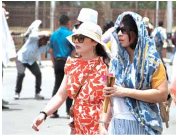
People use scarfs to shield themselves from the hot sun on Wednesday

The 2024 monsoon season in India is off to a slow start, characterised by delayed progress and uneven rainfall distribution across the country with the India Meteorological Department saying the country will witness below-normal monsoon rainfall in June this year. This is likely to impact agricultural yields and food security, especially the Kharif crop, given that it is largely sown in June and July. While southern and some northeastern regions may see normal to above-normal rains, many areas in northwest and Central India face significant shortages. With at least 52 per cent of India's cultivated area relying on monsoon rains, the implications for agriculture are considerable. The monsoon is also crucial for replenishing water reservoirs, which are essential for drinking water and power generation. In an update on the arrival of monsoons in the country, the IMD on Wednesday said, "The average June rainfall for the country as a whole is most likely to be below normal, i.e. less than 92 per cent of the Long Period Average (LPA)." Amid blistering weather being reported from parts of India