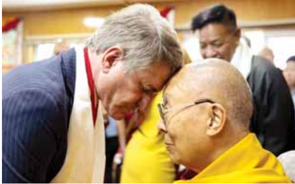
Tibetan spiritual leader Dalai Lama being greeted by US representative Michael McCaul during a meeting with US Congressional delegation at his residence, in Dharamsala

McCaul asserted that people are free in a democracy while they are enslaved in tyranny. "The Tibetan people possess a distinct religion, culture and historic identity and they should have a say in their own future. You should be able to freely practice your religion and that is why we are here