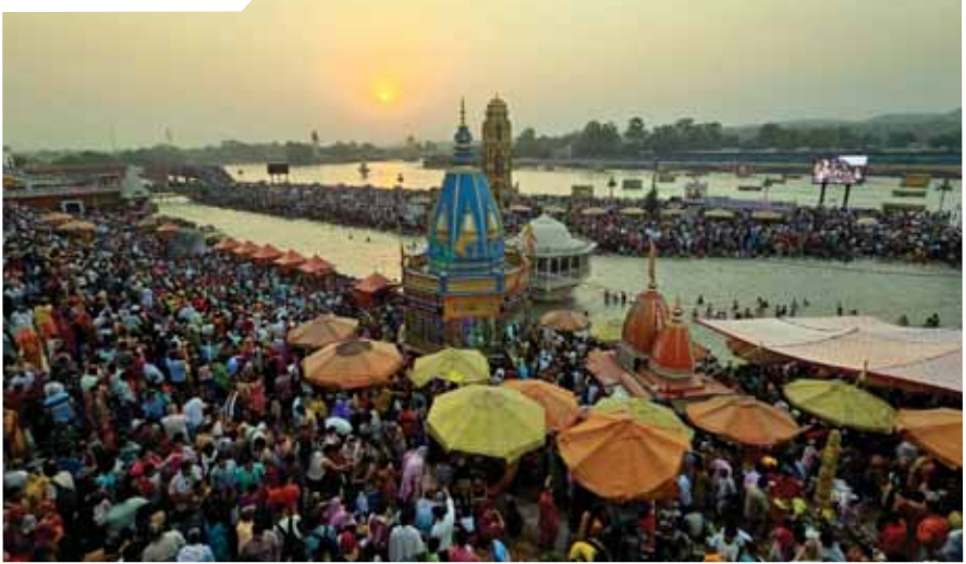
Devotees gather to take a holy dip in the Ganga river on the occasion of Ganga Dussehra, in Haridwar