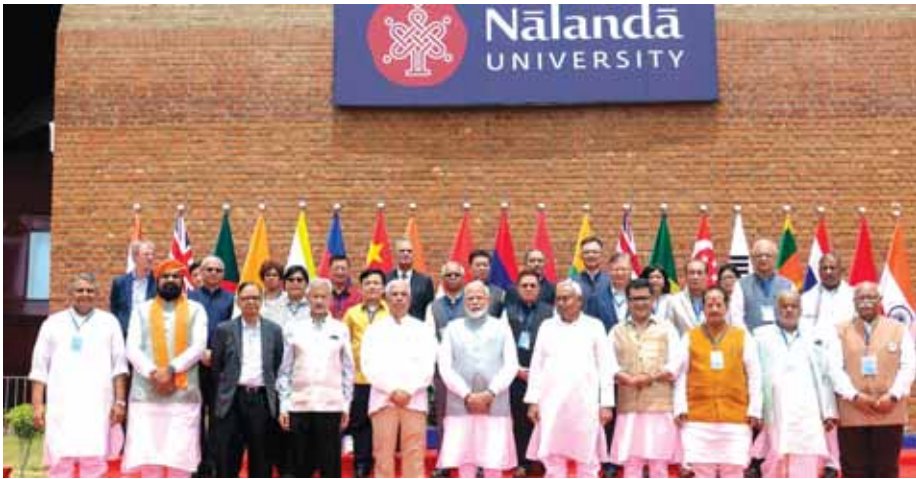
Prime Minister Narendra Modi, External Affairs Minister S Jaishankar, Bihar Governor Rajendra Arlekar, Chief Minister Nitish Kumar, Deputy CMs Samrat Choudhary and Vijay Sinha and other delegates during the inauguration of Nalanda University, in Nalanda district, Bihar on Wednesday

such a status in the ancient times when seats of learning like Nalanda and Vikramshila were flourishing," said Modi, who also made a mention of the International Yoga Day celebrations, due in a couple of days, to stress that India was continuing with cultural exchanges on a global scale. "It is my mission that India re-emerges as the world's most prominent knowledge centre. To this end, the spirit of