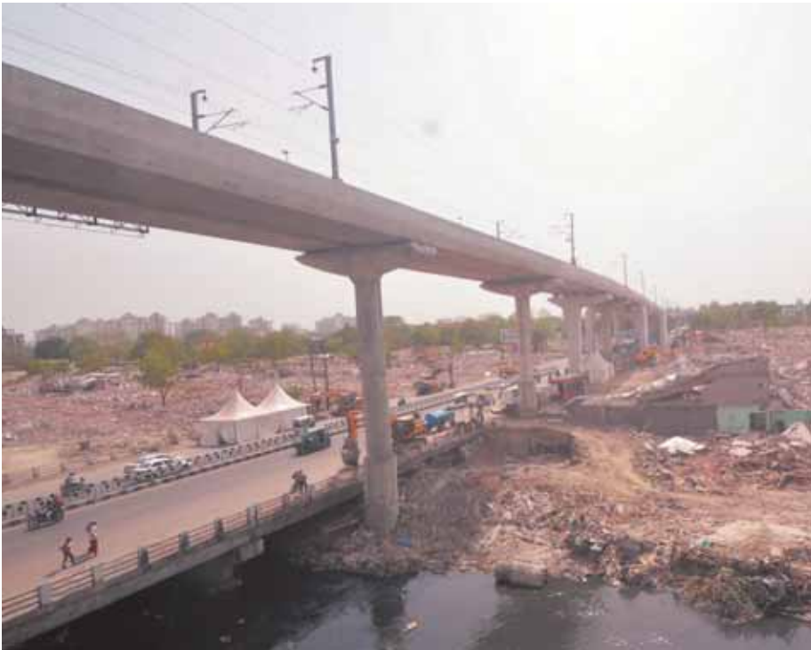
A view of Akbarnagar where the demolition drive was completed on Wednesday