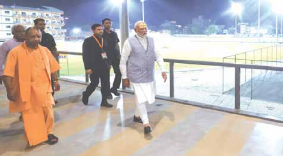
Prime Minister Narendra Modi conducting a surprise inspection at Sigra Stadium on Tuesday night.

After taking part in all the scheduled events, including Kisan Samman Sammelan, Ganga Aarti and offering prayers at Kashi Vishwanath Temple on first visit to his parliamentary constituency during his third term, Prime Minister Narendra Modi on Tuesday night made a surprise inspection of Sigra stadium, taking stock of indoor sports complex. He was accompanied by Chief Minister Yogi Adityanath. The PM stayed at BLW Officers' Guest House for the night before leaving for his visit to Nalanda in Bihar on Wednesday morning. At Sigra stadium the PM reviewed the work underway to build the stadium and sports complex in Varanasi. Once ready, it will cater to the needs of the youth and further enhance sporting culture in Varanasi. With the efforts of