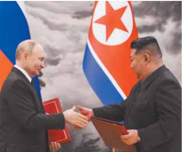
Russian President Vladimir Putin, left, and North Korea's leader Kim Jong Un exchange documents during a signing ceremony of the new partnership in Pyongyang, North Korea, on Wednesday. Putin and Kim signed a new partnership that includes a vow of mutual aid if either country is attacked, during a Wednesday summit that came as both face escalating standoffs with the West.

The two met as Putin visited North Korea for the first time in 24 years. The summit came as the US and its allies express growing concerns over an arms arrangement in which the country provides Moscow with badly needed munitions for its war in Ukraine in exchange for econom-