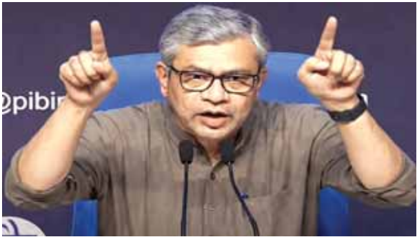
Railway Minister Ashwini Vaishnaw speaks during a Cabinet briefing on Wednesday

In its first Cabinet meeting after assuming the third consecutive term, the Modi Government 3.0 on Wednesday raised the minimum support price (MSP) for paddy by 5.35 per cent to ₹2,300 per quintal for the 2024-25 kharif marketing season. The MSP for 'common' grade paddy has been raised ₹117 to ₹2,300 per quintal, while for the 'A' grade variety it has been hiked to ₹2,320 per quintal for the upcoming Kharif season. The highest absolute increase in MSP over the previous year has been recommended for oilseeds and pulses viz nigerseed (₹983/- per quintal) followed by sesamum (₹632/- per quintal) and tur/arhar (₹550/- per quintal). The Union Cabinet has increased the MSP for all 14 crops, including paddy, ragi, bajra, jowar, maize and cotton which will have a financial implication of ₹two lakh crore for the Government and entail gain of ₹35,000 crore to farmers over the previous season. Announcing the MSP increase, Information and Broadcasting Minister Ashwini Vaishnaw said the Cabinet has approved the minimum support prices for 14 Kharif (summer) crops based on recommendations from the Commission for