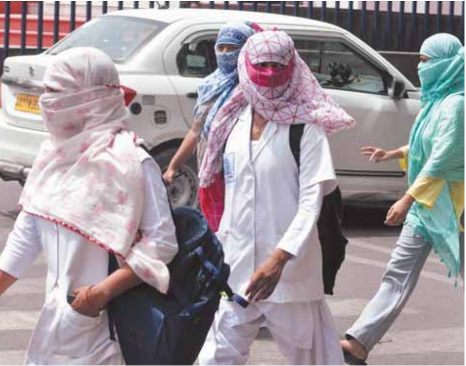
Lucknow sizzled at 43.1 degree Celsius on Wednesday. The local forecast is clear skies with hot winds blowing over. The maximum temperature is expected to be 44 degree Celsius. Heatwave conditions are likely at midday and afternoon

"INDIA bloc will stay together. Long live INDIA bloc," Akhilesh said during the alliance's meeting in New Delhi after the Lok Sabha poll results were announced on June 4. The SP-Congress combine under the INDIA bloc tasted unprecedented success in UP, surpassing both the BJP and the National Democratic Alliance tallies for the first time. Of the 80 UP Lok Sabha seats, the SP alone bagged 37 and the Congress six, adding up to 43 for the INDIA bloc, while the BJP bagged 33 and its allies three more, making it 36 for the NDA. The Congress too has confirmed that the alliance will remain in the bypolls, seen as semi-finals to the assembly elections. "The alliance will continue. We will be in play in the forthcoming bypolls also. And there will be seat-sharing discussions," said a Congress leader. The assembly constituencies where by-elections will be held soon are Karhal, Khair (Aligarh), Kundarki (Moradabad), Katehari (Ambedkar Nagar), Phulpur (Prayagraj), Ghaziabad (Ghaziabad), Majhawan (Mirzapur), Meerapur (Muzaffarnagar), and Milkipur (Ayodhya). While the Congress and SP are yet to announce their alliance for the assembly polls, given the warmth between the leaders and the seamless coordination between the cadres of the two parties, it is a foregone conclusion that the pact is likely to continue.