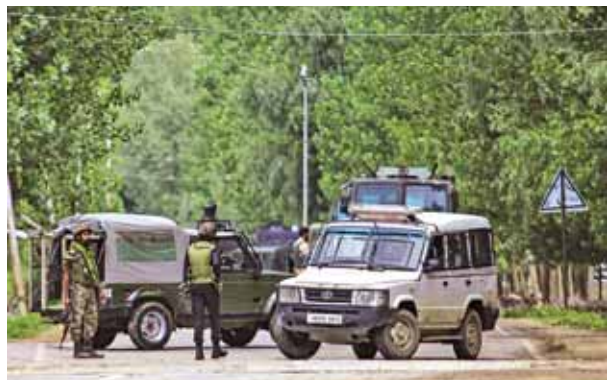
Security forces personnel during an encounter with militants, in Hadipora, Baramulla

In course of the security forces' drive to sanitise Jammu and Kashmir ahead of Prime Minister Narendra Modi's Srinagar visit for this year's International Yoga Day function on June 21, two terrorists were gunned down in the Hadipora area of PD Sopore in North Kashmir's Baramulla district. Two security personnel, including one Army jawan, also received injuries during the operation. Meanwhile, the Jammu and Kashmir Police have declared Srinagar city as a temporary 'red zone', and banned the operation of drones ahead of PM's visit. This will be Modi's first visit to Jammu and Kashmir after being sworn in as the Prime Minister for the third time. Till the time of filing of this report, the identity of the slain terrorists could not be ascertained as the security forces were still conducting searches in the area and were yet to retrieve the bodies of the slain terrorists from the encounter site. Chinar Corps, in a post on X, stated that the operation was