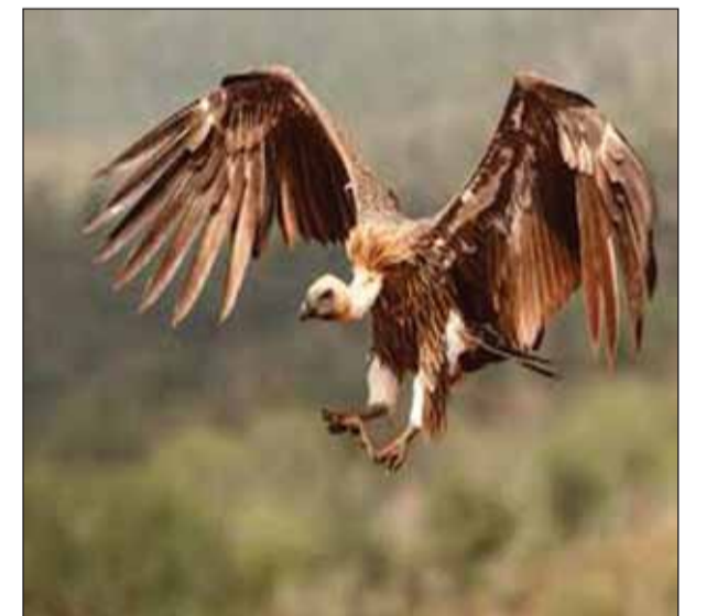
Information will also be collected about their food, water status and habitat.

Data will be prepared by knowing its location and activities through GPS tracker. Devices will be installed