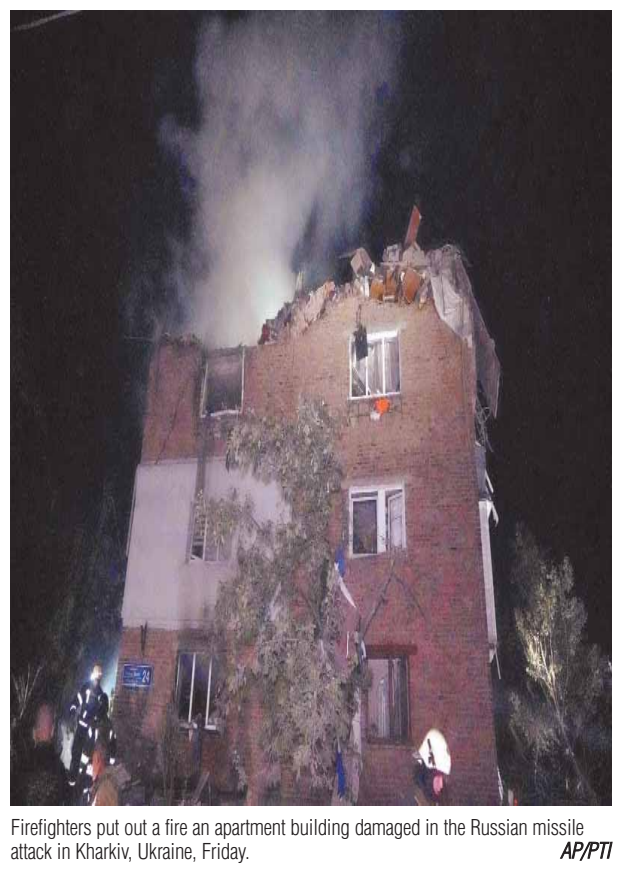
Firefighters put out a fire an apartment building damaged in the Russian missile attack in Kharkiv, Ukraine, Friday.