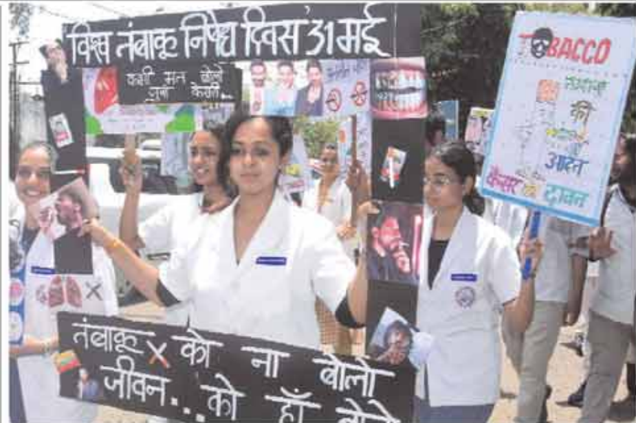
Medical students during an awareness rally on the occasion of World No Tobacco Day in Bhopal on Friday.