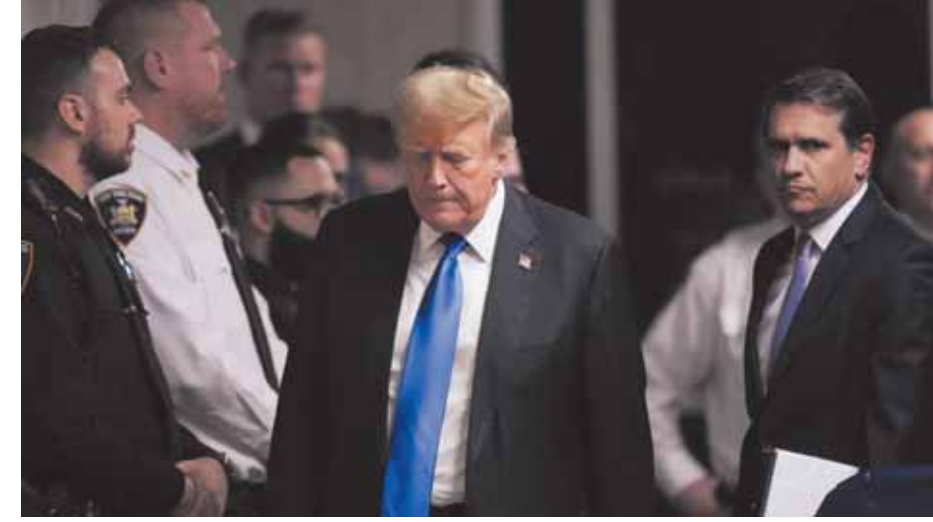
■ WASHINGTON

Donald Trump has been found guilty of all 34 charges of falsifying business records by a grand jury in New York, an unprecedented and historic verdict that makes him the first former president in American history to be convicted of a felony, as he makes a bid to return to the White House in November. In a landmark verdict, a panel of 12 Manhattan jurors on Thursday said they unanimously agreed that Trump, 77, falsified business records to conceal a USD 130,000 hush money payment to adult film star Stormy Daniels to influence the 2016 presidential election. It will ultimately be up to voters on November 5 to decide the significance of the guilty verdict delivered by 12 ordinary New Yorkers, which, on a legal basis, does not prevent him from being elected president again. Over a six-week trial, the court heard from 22 witnesses, including Daniels, whose alleged sexual encounter with the former president was at the centre of the case. As the verdicts were read, Trump remained silent and still. But the former president spoke to reporters outside the courtroom, calling the trial a "rigged, disgraceful trial" and saying that the "real verdict" will be rendered on Election Day. Prosecutors had argued that, by approving a scheme to disguise the money as legal expenses,