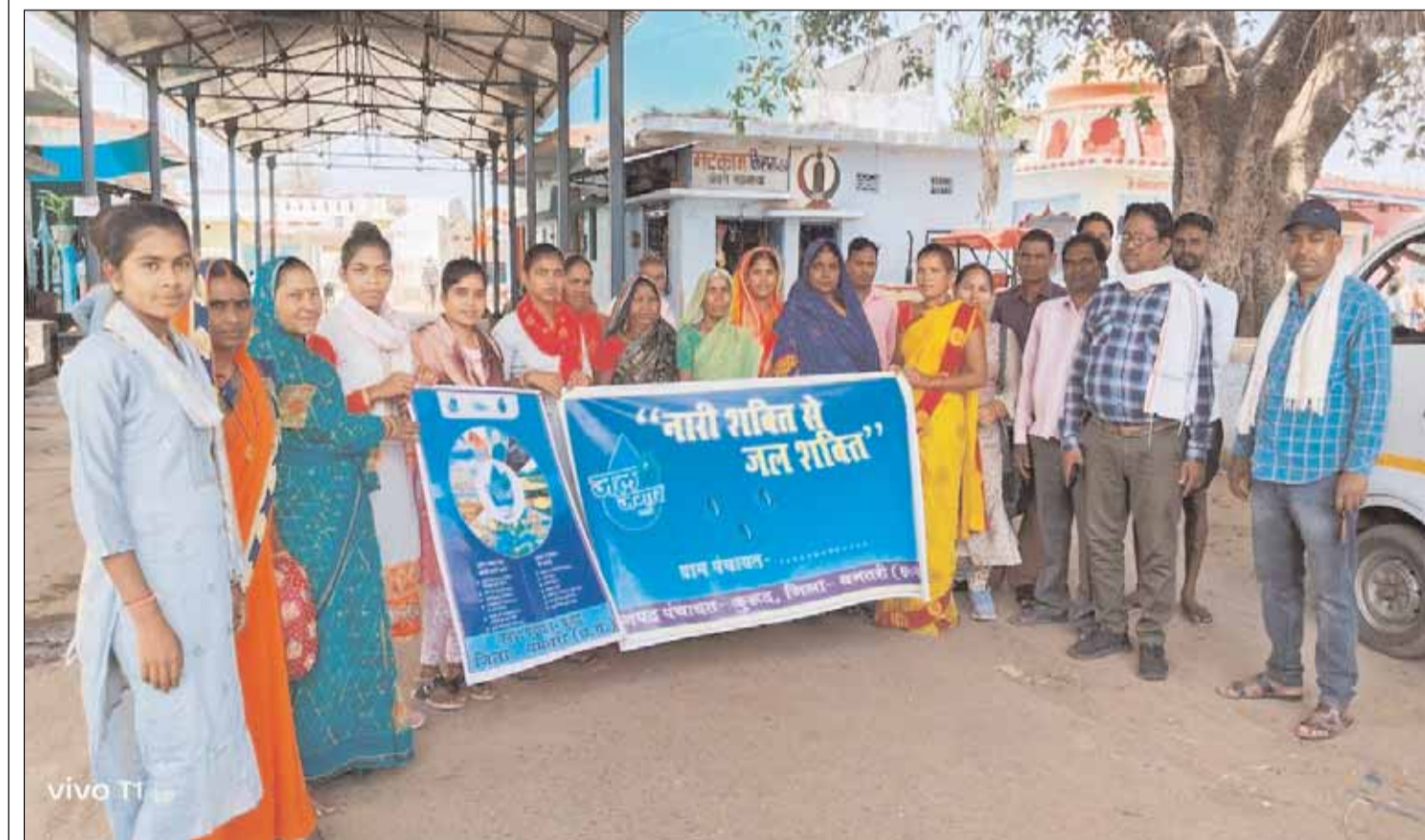
The Dhamtari district administration in Chhattisgarh on Friday organised a Jal-Jagar event to make people aware of the need for water conservation. The Ravishankar reservoir in the region has dried up and caused concern over availability of water in the state.

The first two resided in Raipur and others hailed from Rajasthan. The police intercepted a car and nabbed them near a pond in Jarway area in the outskirts of Raipur following a tip.