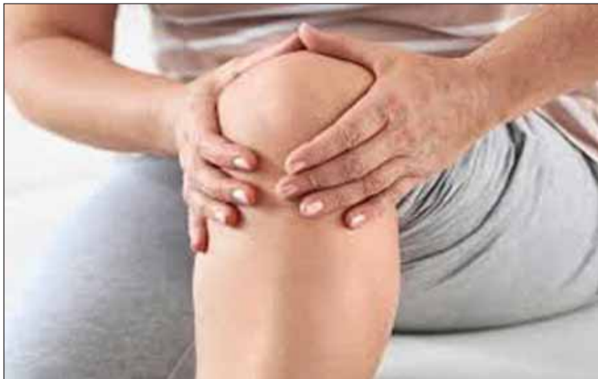
as walking, running, or playing a sport.