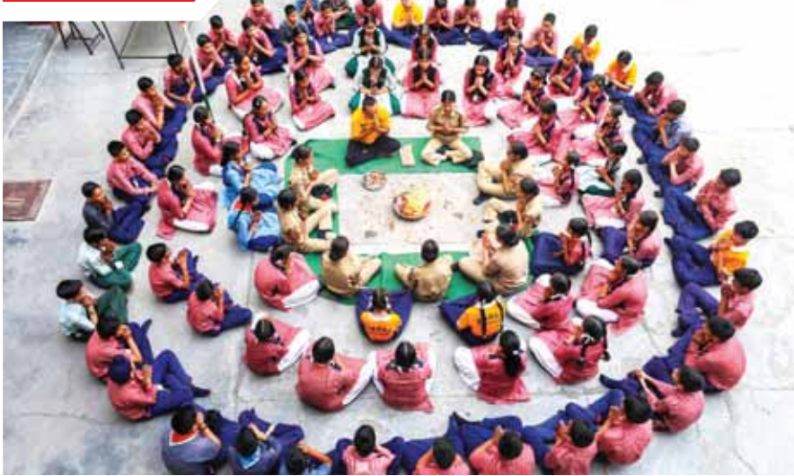
Children of a school offer prayers during a 'havan' for relief from the heatwave, in Jammu