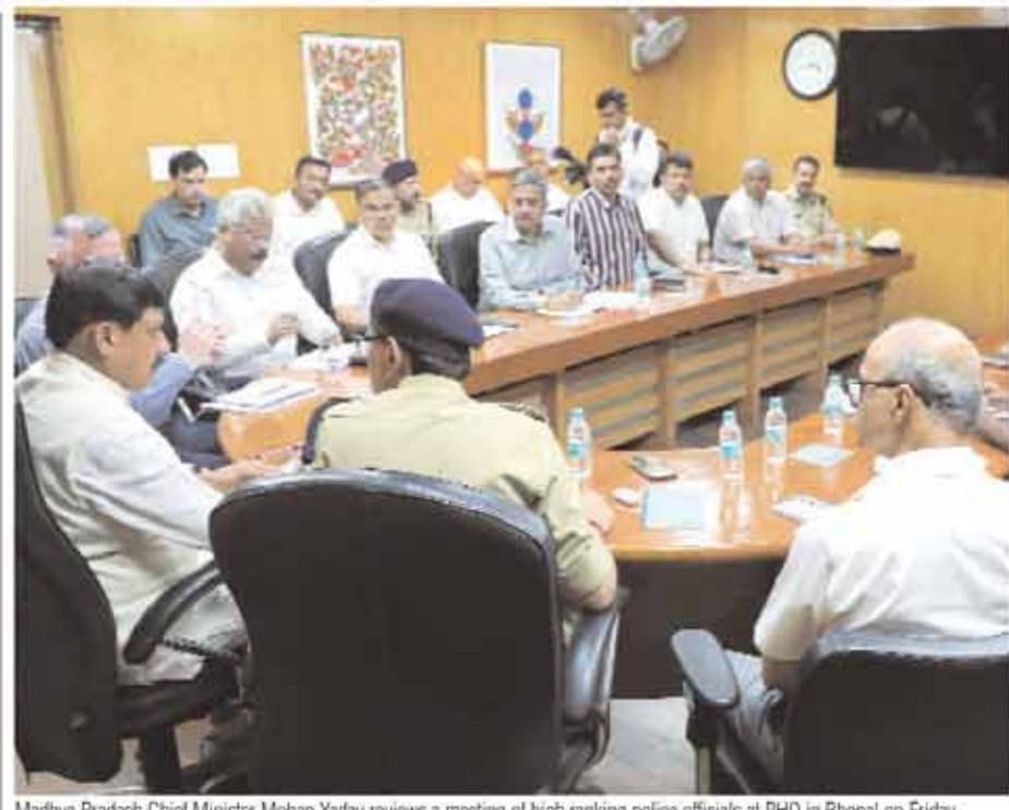
Madhya Pradesh Chief Minister Mohan Yadav reviews a meeting of high ranking police officials at PHQ in Bhopal on Friday.

against children to justice. Punishment and bail in POCSO Act, no anticipatory bail The crime under POCSO Act is considered a very serious crime. In which there is a provision to provide the harshest punishment to the guilty person whoever is found guilty of committing this crime. This act provides for punishment ranging from minimum 3 years to life imprisonment depending on the severity of the crime. After amending the POCSO Act, it was decided that if someone is found guilty of raping girls under 12 years of age, then the guilty person can be given death penalty. If a case is registered against a person for committing a crime like sexual abuse of a minor child, then he cannot be given bail in any way.