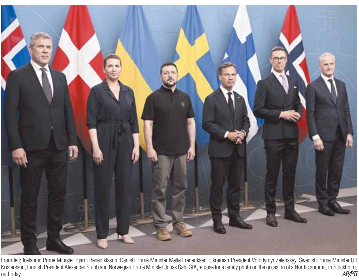
From left, Icelandic Prime Minister Bjarni Benediktsson, Danish Prime Minister Mette Frederiksen, Ukrainian President Volodymyr Zelenskyy, Swedish Prime Minister Ulf Kristersson, Finnish President Alexander Stubb and Norwegian Prime Minister Jonas Gahr Støre, re pose for a family photo on the occasion of a Nordic summit, in Stockholm

attack them," one Washington official told The Associated Press. But the officials, who requested anonymity to discuss the sensitive matter, stressed that the U.S. policy calling on Ukraine not to use American-provided ATACMS or long-range missiles and other munitions to strike offensively inside Russia has not changed. That restriction has frustrated Ukrainian officials as the military is unable to order hits on Russian troops massing across the border — Kharkiv city is only 20 kilometers (12 miles) from Russia — or Russian bases used to launch missile attacks. The question of whether to allow Ukraine to hit targets on Russian soil with Western-supplied weaponry has been a delicate issue since Moscow launched its full-scale invasion on Feb. 24, 2022. Western leaders have hesitated to take the step because it runs the risk of provoking Russian President Vladimir Putin, who has repeatedly warned that the West's direct involvement could put the world on a path to nuclear conflict.