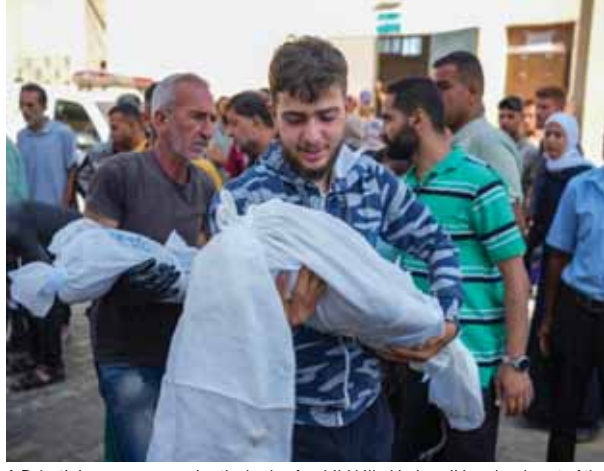
A Palestinian mourner carries the body of a child killed in Israeli bombardment of the Gaza Strip, during their funeral in Deir al Balah, Friday.

Families of Israeli hostages held by Hamas called for all parties to immediately accept a proposal detailed by US President Joe Biden to end the nearly 8-month-long war and bring their relatives home, but Israel's government said conditions for a cease-fire still must be met. Biden outlined a three-phase deal Friday proposed by Israel to Hamas, saying the militant group is "no longer capable" of carrying out another large-scale attack on Israel. He urged the Israelis and Hamas to come to an agreement to release some 100 remaining hostages, along with the bodies of around 30 more, for an extended cease-fire. Cease-fire talks ground to a halt last month after a major push by the US and other mediators to secure a deal in hopes of averting a full Israeli invasion of Gaza's southern city of Rafah. Israel says the Rafah operation is vital to uprooting Hamas