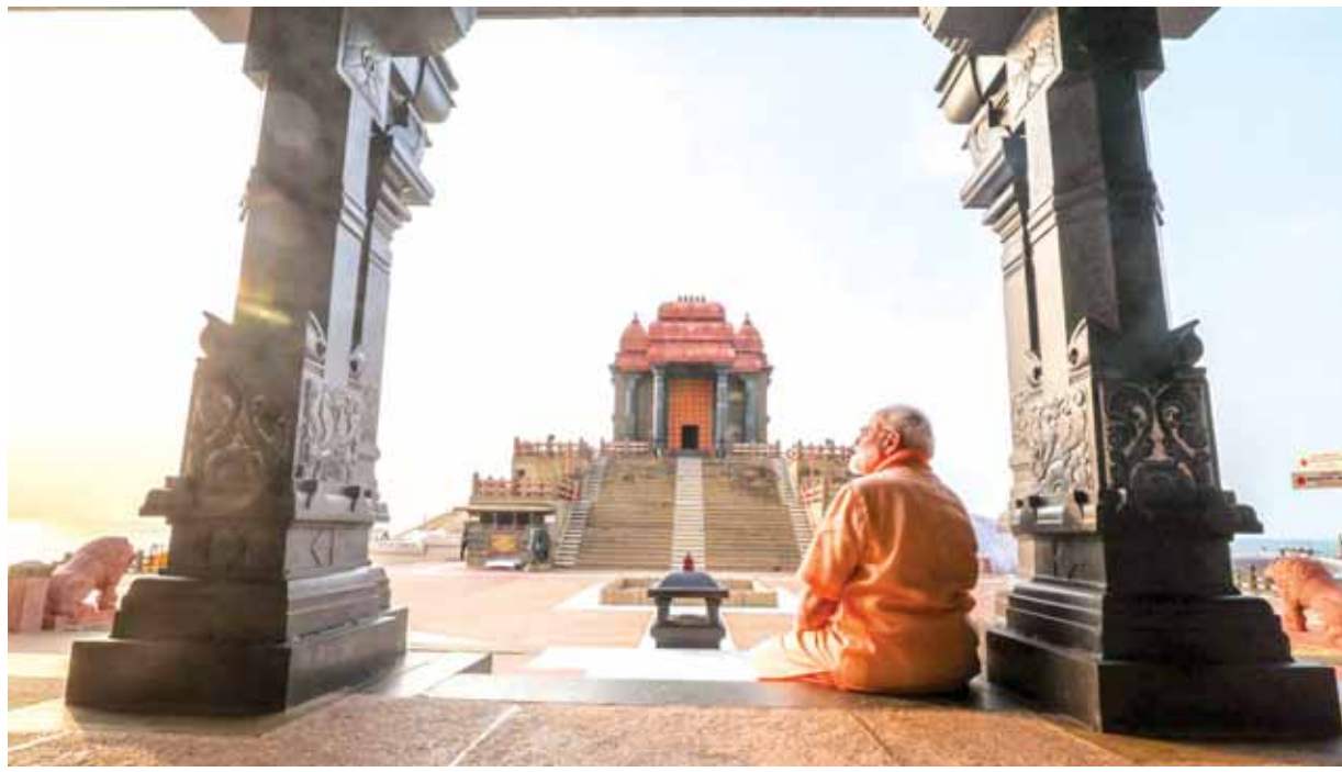
Prime Minister Narendra Modi at the Vivekananda Rock Memorial in Kanyakumari

Violence broke out between TMC and BJP supporters in Sandeshkhali in West Bengal, and complaints of EVM glitches and rigging at some booths were lodged. Barring incidents of clashes in Odisha, voting was almost peaceful. The counting of votes will be taken up on June 4. In Arunachal Pradesh and Sikkim, the counting for the