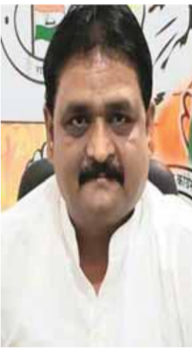
increased. Due to the mismanagement of the Sai government, the economic condition of the state is deteriorating, he said.

The government abolished the registry exemption, abolished the e-way bill, and now the price of electricity has