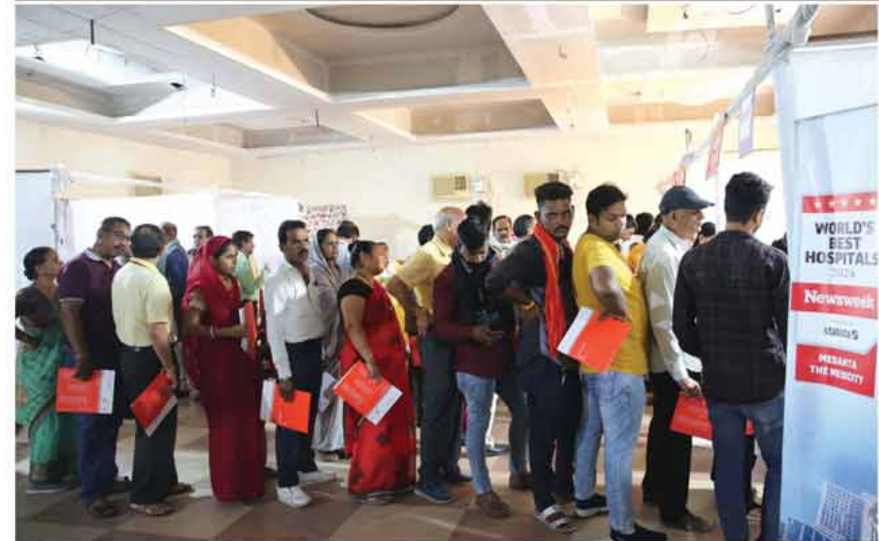
People wait in a queue to get their health checked during a free health check-up camp in South-West state assembly constituency at Gujarati Bhawan in Bhopal on Saturday.