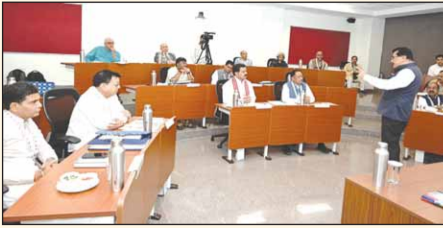
and best practices with the experts, he said. Intellectual dialogues took place featuring subject matter