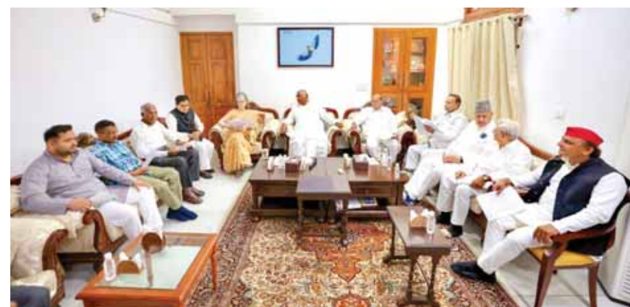
Congress leaders Mallikarjun Kharge, Sonia Gandhi, National Conference leader Farooq Abdullah, CPI(M)'s Sitaram Yechury, Samajwadi Party leader Akhilesh Yadav, RJD leader Tejashwi Yadav, AAP leaders Arvind Kejriwal and Sanjay Singh, CPI's D Raja during the INDIA Bloc's meeting in New Delhi on Friday

Kharge, along with top leaders of the Bloc including former Congress chief Sonia Gandhi, met at the residence of Congress president to discuss their strategy for the counting of votes on June 4. "INDIA Bloc will get a big majority, we have a people's survey with us," Kharge said after the Opposition meeting. He said the parties have also sought time from the Election Commission of India on Sunday for steps to be taken during counting of votes besides having conveyed their workers not to leave the counting hall till all formalities are over on June 4. Senior leaders of the Congress, Samajwadi Party,