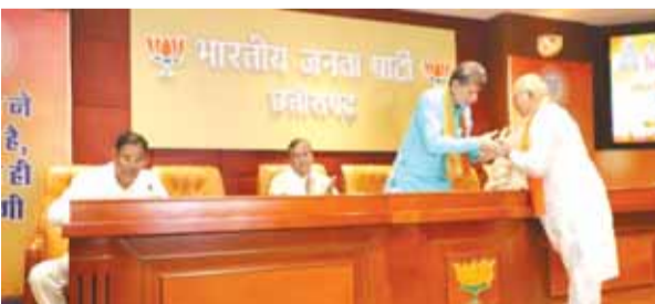
in Chhattisgarh and strengthen Modiji," he said.

He said this at a party meeting held at the Kushabhau Thackeray Complex in Raipur. "We will win all the seats