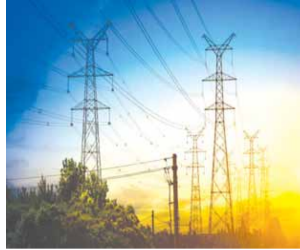
have a revenue deficit of Rs 1,819 crore at the current rate for 2024-25.

As a result, the distribution company is estimated to