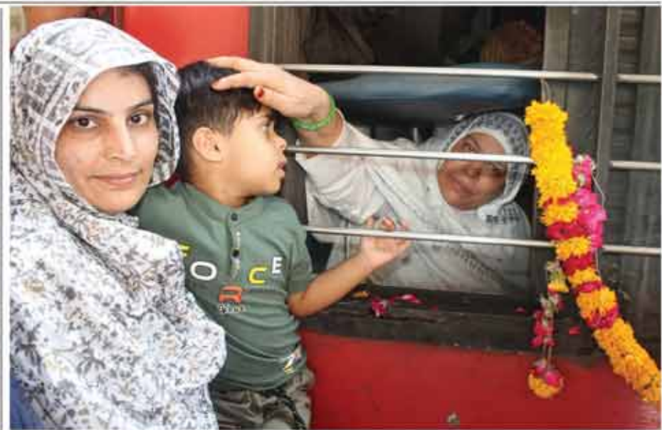
Haj pilgrims being given a warm send off by their relatives and family members as they board a train to leave for an annual journey to Mecca at railway station in Bhopal on Saturday.