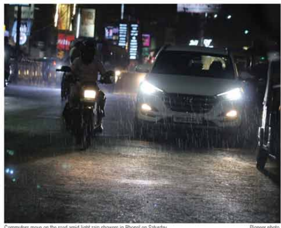
Commuters move on the road amid light rain showers in Bhopal on Saturday.

degrees was recorded here. On the eighth day of Nautapa in Raisen, winds and clouds have caused a drop in the day temperature. The temperature has dropped by two degrees compared to the past days. The temperature at 2 pm on Saturday was 41 degrees. According to the Meteorological Department, a light dust storm may occur in Morena, Sheopur Kalan, Shivpuri, Ashoknagar, Sagar, Vidisha, Raisen, Mauganj, Sidhi, Singrauli and Panna in the afternoon. At the same time, there is also a possibility of lightning. Clouds have been looming over Sagar since morning. Sunshine and shade continue amidst the clouds. The winds are hot. The temperature of Sagar was around 40 degrees at 1 pm.