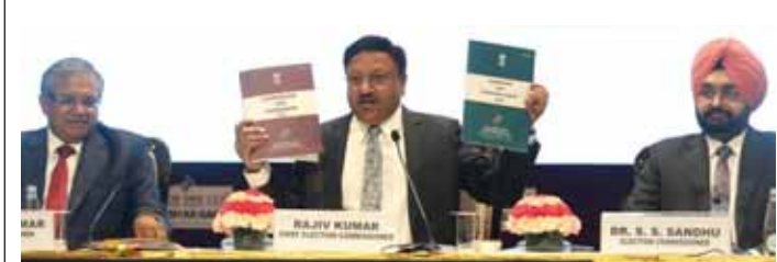
Chief Election Commissioner of India Rajiv Kumar with Election Commissioners Gyanesh Kumar and Dr SS Sandhu during a Press conference, in New Delhi, on Monday

mark of 272 seats needed to form the Government. The Congress and other INDIA Bloc parties have trashed the exit polls, claiming that these surveys were a work of "fantasy" and asserting that the opposition alliance will form the next Government. Further, the Congress led INDIA Bloc on Monday said the Election Commission (EC) has agreed to its request of counting the postal ballots first on June 4, when the results of the Lok Sabha polls are scheduled to be declared, and stressed that this is the participatory manner of promoting the spirit of democracy in a non-adversarial fashion.