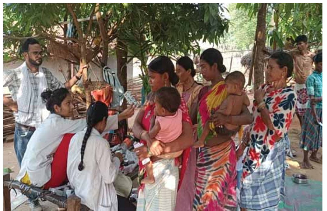
Health Department personnel traversed about 30 km on foot to provide healthcare to the residents of a remote village, Badepalli, in Chhattisgarh's Dantewada on Monday. They provided free treatment to 196 villagers.

The people have voted for freedom from the Modi government's 10 years of misrule, rising inflation, unemployment, failing economy, economic inequality and corruption, he said.