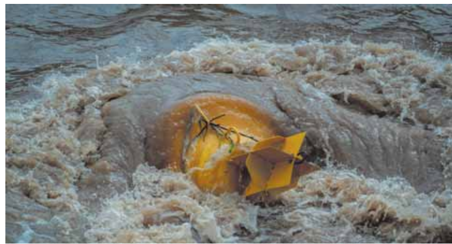
A buoy is pictured as the river Neckar has left its banks in Heidelberg, Germany on Monday. Big parts of southern Germany have been flooded after heavy rainfalls during the last days. In background the castle.

The floods caused extensive transport disruption, with long-distance rail routes to Munich from the north and west out of action on Monday. Scholz visited Reichertshofen, north of Munich, inspecting a sandbagged river bank and meeting regional officials including Markus Söder, Bavaria's governor. Söder said that the situation "remains critical and tense," with water receding in some places but new flooding and evacuations elsewhere. He noted that water levels are expected to rise in the city of Regensburg and further down the Danube. Scholz said that "this is not just one event like there have been for centuries," and that a succession of floods in recent times shows "we cannot neglect the task of halting man-made climate change".