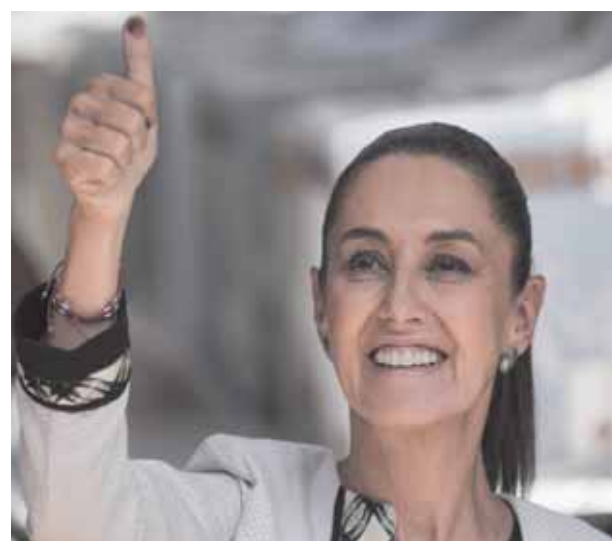
Ruling party presidential candidate Claudia Sheinbaum shows her ink-stained thumb after voting during general elections in Mexico City, Sunday.

Claudia Sheinbaum claimed victory in Mexico's presidential election, becoming the first woman selected for the job by promising to continue the political course set by her populist predecessor despite widespread discontent with persistent cartel violence and disappointing economic performance. The climate scientist and former Mexico City mayor was the favored successor of outgoing President Andrés Manuel López Obrador. But her cool temper offers a sharp contrast in style — and a break with Mexico's male-dominated political culture.