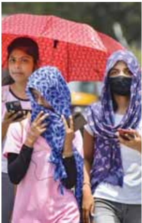
Residents beat the heat with dupatta and umbrella in Delhi File photo

The Centre for Holistic Development (CHD), an NGO working for the homeless, claimed that deaths of 192 homeless people due to extreme heat were recorded in Delhi