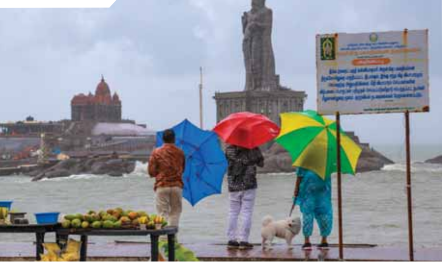
People use umbrellas to shield themselves during rains, in Kanyakumari