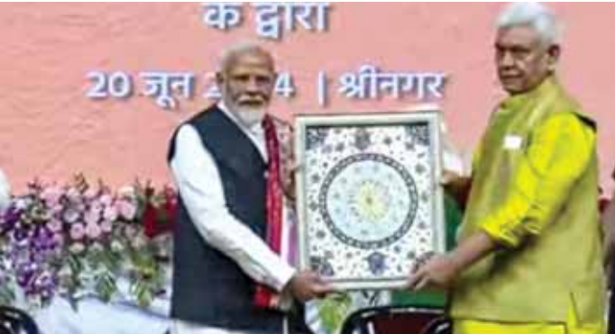
Prime Minister Narendra Modi being felicitated by Jammu and Kashmir Lieutenant Governor Manoj Sinha during "Empowering Youth, Transforming J&K" event, in Srinagar, on Thursday

Addressing a gathering at the 'Empowering Youth, Transforming J&K' event in Srinagar, Modi said the Union Government has taken the recent terror attacks very seriously. "I assure you that we will not hesitate to teach a lesson to the enemies of Jammu & Kashmir." Referring to the much-awaited Assembly polls the Prime Minister said, "The people of Jammu and Kashmir elect their representatives at the local level, through them you find ways to solve problems, what can be better than this? Therefore, now the preparations for the Assembly elections have also started. The time is not far when you will elect the new Government of Jammu and Kashmir with your votes. That day will also come soon