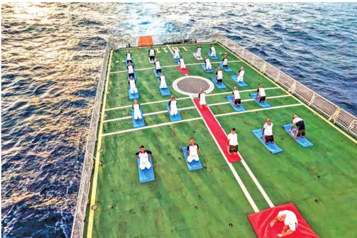
Indian Coast Guard (ICG) personnel perform yoga aboard ICG's ship Samarth during preparations on the eve of the International Day Of Yoga