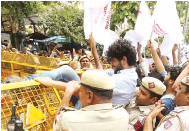
Students stage a protest over the NEET-UG and UGC-NET examinations issue (L) and Congress leader Rahul Gandhi at a Press conference at AICC Headquarters on Thursday

A day after the UGC-NET was cancelled, Education Ministry officials on Thursday said no complaints were received about the exam but a suo motu action was taken on the basis of inputs