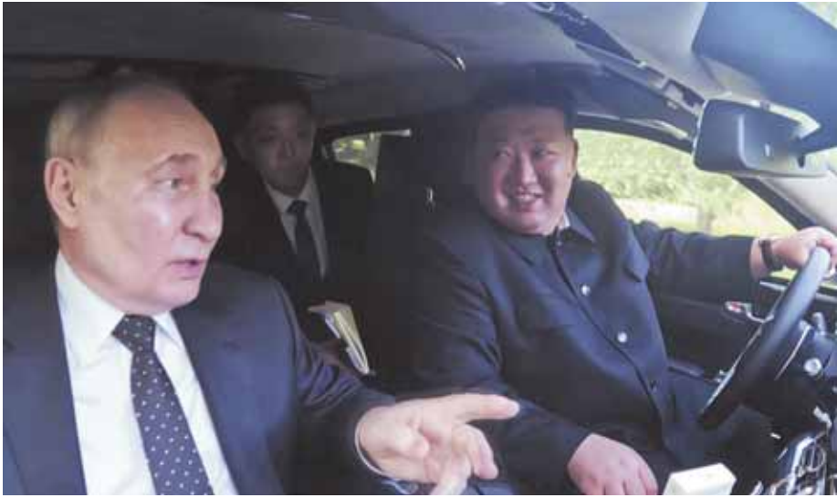
In this photo provided by the North Korean government, North Korean leader Kim Jong Un, right, drives a car which was presented by Russia's President Vladimir Putin, left, at a garden of the Kumsusan State Guest House in Pyongyang, North Korea Wednesday.

Putin also met Vietnam's most powerful politician, Communist Party General