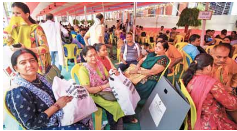
Poll officials collect election material for the last phase of Lok Sabha polls in Patna on Thursday