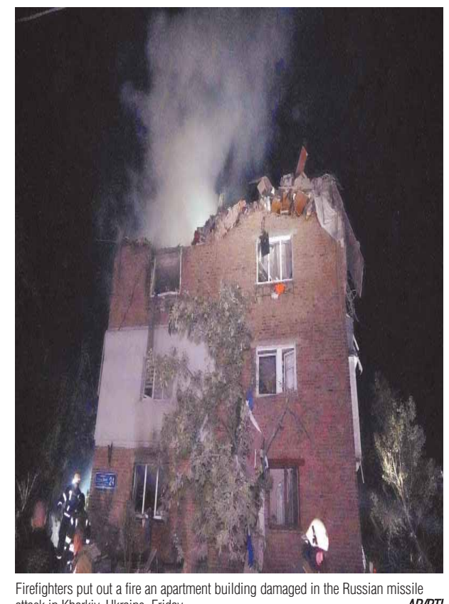
Firefighters put out a fire an apartment building damaged in the Russian missile attack in Kharkiv, Ukraine, Friday.