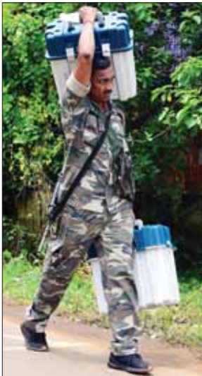
Polling officials and security personnel with the election materials leave for their designated polling stations on the eve of the seventh and last phase of Lok sabha elections in Dumka, Jharkhand on Friday.

He said that security forces have been deployed at every booth to ensure fair and fear-free voting. The border of Bihar and West Bengal connected to the election area has been sealed. Bike riding quick response team has also been deployed. He informed that a driver of a private bus connected with