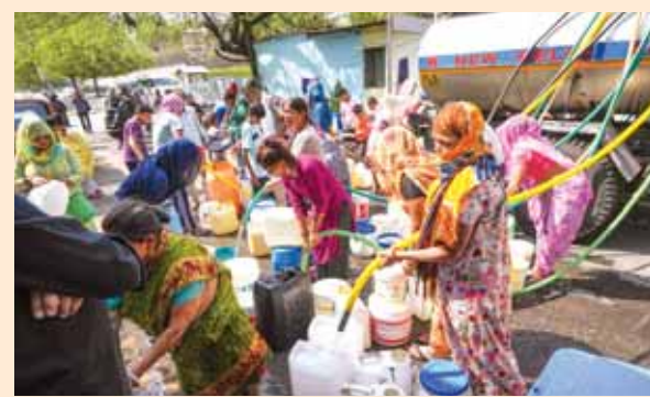
Residents fill water from a tanker amid water crisis at the Vivekanand Camp in Chanakyapuri area of New Delhi on Friday

About four lakh people have been affected in the northeastern States of Assam and Manipur, which have been hit by heavy rain and thunderstorms triggered by Cyclone Remal in the last few days. A total of 1,88,143 people have been affected by floods in Manipur following incessant rainfall in the aftermath of Cyclone Remal, a State Minister said on Thursday. It has also damaged at least 24,265 houses in the last few days, he said. The Central Water Commission said six rivers in Assam and Manipur, including Brahmaputra, and Barak, are experiencing severe flooding, putting numerous districts in the region at risk. Altogether 18,103 people have been evacuated and 56 relief camps were set up, Manipur Minister for Water Resources and Relief & Disaster Management Awangbou Newmai said. Around 401 hectares of crop have been affected, too, he said. Relief materials have been distributed to Imphal East, Imphal West, Bishnupur, Noney, Churanchanpur, Senapati and Kakching, the Minister said.