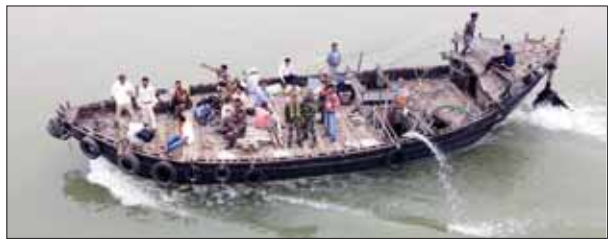
Electoral officers with VVPATs / EVMs are on their way by boats on the river Ganga to the respective polling booths under tight security arrangements to conduct the on-going last phase (7th) in India as well as last phase (4th) in Jharkhand state, to be held tomorrow (1st June 2024), during the Lok-Sabha Election-2024 in Sahibganj district of Jharkhand on Friday.