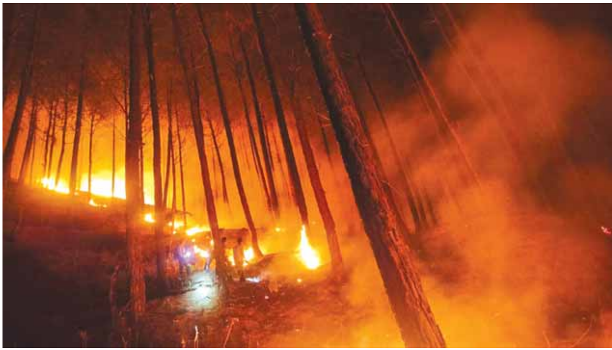
Smoke rises from a forest fire in Uttarakashi district

Severe heatwave sweeping Northwest and Central India is increasingly becoming a public health crisis in India with around 71 people succumbing to heat-related illness especially sunstroke since March 1 till date even as Uttarakhand and Jammu region reported forest fires adding complexity to the ongoing situation on Friday. The reports of deaths and illness cases due to heatwaves continue to surface every day. Tragically, on Friday, as several pockets of Northwest and Central India turned into a baking pan with temperatures soaring as high as 45 degrees Celsius, it proved fatal particularly to the polling personnel. The Jammu and Kashmir Disaster Management Authority (JKDMA) which is mobilising resources, including drones, to combat the fires has issued an extreme forest fire risk warning for the coming week as temperatures soar and the dry conditions persist. Fourteen people, including 10 polling personnel lost their lives to heatwave in the last 24 hours in Bihar alone, while four persons succumbed to sunstroke in Jharkhand. In the eastern State 1,326 people were hospitalised due to the health risks posed by the intense heatwave. Uttar Pradesh's authorities also reported the death of 13 poll