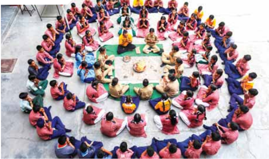
Children of a school offer prayers during a 'havan' for relief from the heatwave, in Jammu