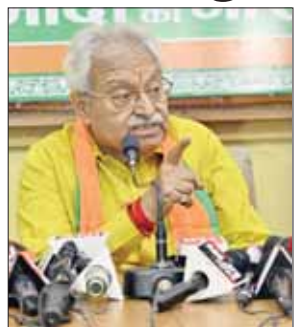
BJP State in-charge and Chief Whip in Rajya Sabha, Dr. Laxmikant Vajpayee during a press conference in Ranchi on Friday.