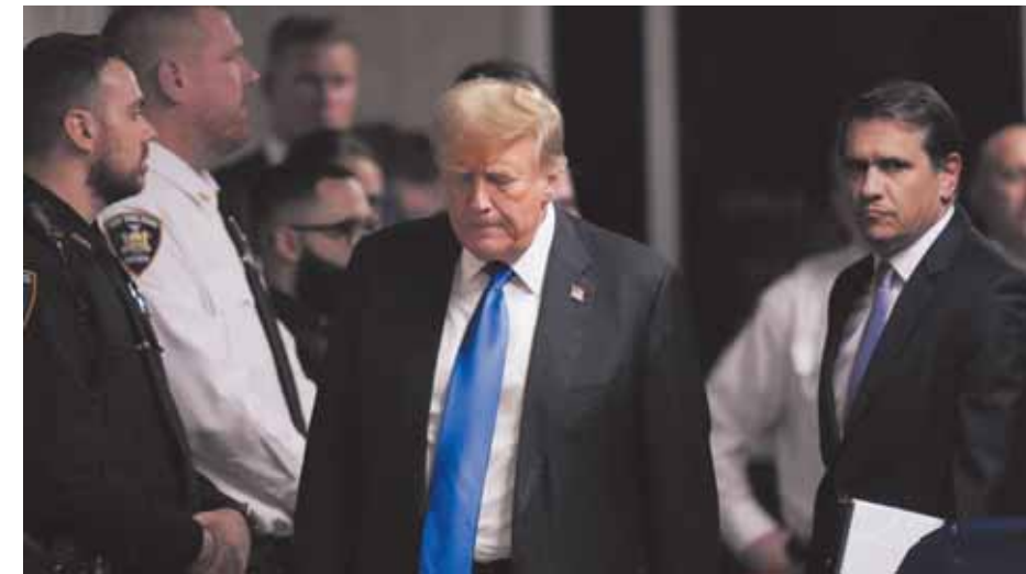
WASHINGTON

Donald Trump has been found guilty of all 34 charges of falsifying business records by a grand jury in New York, an unprecedented and historic verdict that makes him the first former president in American history to be convicted of a felony, as he makes a bid to return to the White House in November. In a landmark verdict, a panel of 12 Manhattan jurors on Thursday said they unanimously agreed that Trump, 77, falsified business records to conceal a USD 130,000 hush money payment to adult film star Stormy Daniels to influence the 2016 presidential election. It will ultimately be up to voters on November 5 to decide the significance of the guilty verdict delivered by 12 ordinary New Yorkers, which, on a legal basis, does not prevent him from being elected president again. Over a six-week trial, the court heard from 22 witnesses, including Daniels, whose alleged sexual encounter with the former president was at the centre of the case. As the verdicts were read, Trump remained silent and still. But the former president spoke to reporters outside the courtroom, calling the trial a "rigged, disgraceful trial" and saying that the "real verdict" will be rendered on Election Day. Prosecutors had argued that, by approving a scheme to disguise the money as legal expenses,