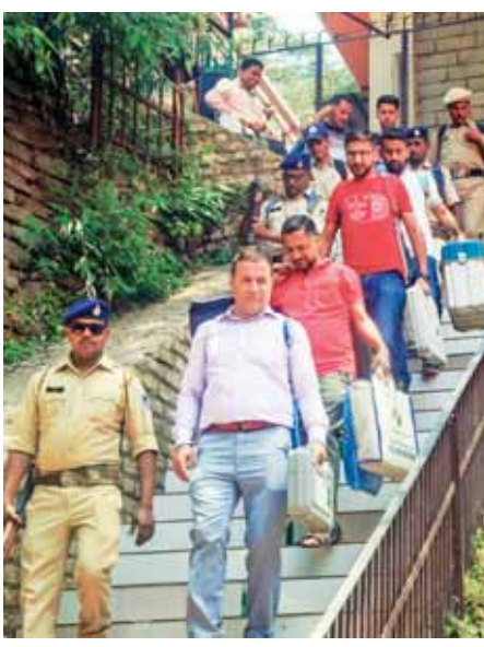
Polling officials leave with EVMs and other election materials for their respective polling booths on the eve of the seventh and last phase of Lok Sabha elections in Shimla

The BJP made the yet-to-be implemented promises of the Congress government in the state, "Modi teesri bar" (Narendra Modi as the prime minister for a third time) and the construction of a Ram temple in Ayodhya its poll planks. It also dubbed the Congress as "anti-Ram" for refusing the invitation for the consecration ceremony of the temple. The Congress hit out at the Agniveer scheme for short-term military recruitment, alleged a threat to democracy and horse-trading by the BJP during its campaign. It also talked about unemployment and inflation in the country. Apple was another issue that was raised from different perspectives by both the Congress and the BJP. The Congress has included the demands of apple growers for 100 per cent import duty on their produce, abolition of the Goods and Services Tax (GST) on farm inputs and equipment, loan waiver and subsidies on fertilisers and pesticides in its manifesto, while the BJP maintain that it has introduced several schemes and initiatives for the apple farmers, such as Kisan Samman Nidhi and solar fencing.