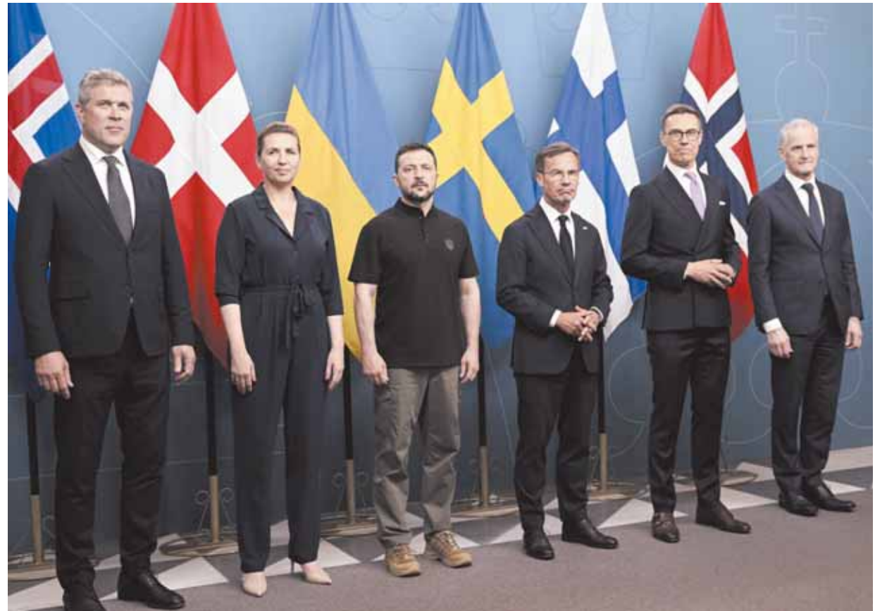
From left, Icelandic Prime Minister Bjarni Benediktsson, Danish Prime Minister Mette Frederiksen, Ukrainian President Volodymyr Zelenskyy, Swedish Prime Minister Ulf Kristersson, Finnish President Alexander Stubb and Norwegian Prime Minister Jonas Gahr Støre, re pose for a family photo on the occasion of a Nordic summit, in Stockholm

attack them," one Washington official told The Associated Press. But the officials, who requested anonymity to discuss the sensitive matter, stressed that the U.S. policy calling on Ukraine not to use American-provided ATACMS or long-range missiles and other munitions to strike offensively inside Russia has not changed. That restriction has frustrated Ukrainian officials as the military is unable to order hits on Russian troops massing across the border — Kharkiv city is only 20 kilometers (12 miles) from Russia — or Russian bases used to launch missile attacks. The question of whether to allow Ukraine to hit targets on Russian soil with Western-supplied weaponry has been a delicate issue since Moscow launched its full-scale invasion on Feb. 24, 2022. Western leaders have hesitated to take the step because it runs the risk of provoking Russian President Vladimir Putin, who has repeatedly warned that the West's direct involvement could put the world on a path to nuclear conflict.