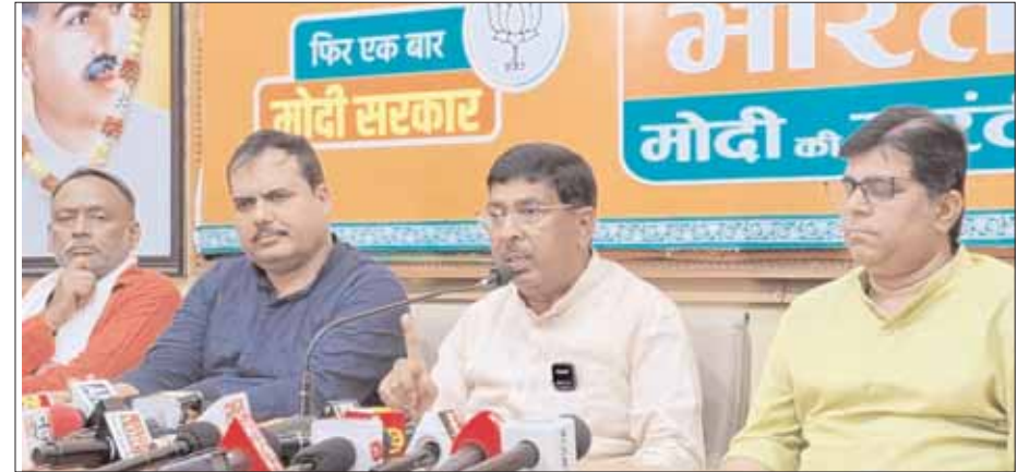
Rajya Sabha MP Aditya Sahu along with others during a press conference at the party office in Ranchi on Saturday.

In the 2019 elections, NDA got 12 seats in the state with the blessings of the public. The way the central government, under the leader-