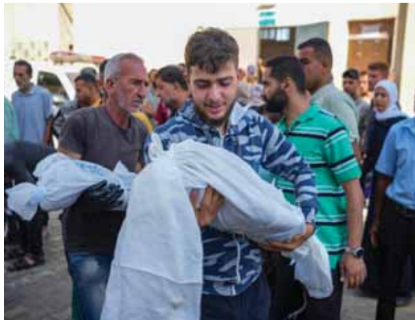
A Palestinian mourner carries the body of a child killed in Israeli bombardment of the Gaza Strip, during their funeral in Deir al Balah, Friday.

Families of Israeli hostages held by Hamas called for all parties to immediately accept a proposal detailed by US President Joe Biden to end the nearly 8-month-long war and bring their relatives home, but Israel's government said conditions for a cease-fire still must be met. Biden outlined a three-phase deal Friday proposed by Israel to Hamas, saying the militant group is "no longer capable" of carrying out another large-scale attack on Israel. He urged the Israelis and Hamas to come to an agreement to release some 100 remaining hostages, along with the bodies of around 30 more, for an extended cease-fire. Cease-fire talks ground to a halt last month after a major push by the US and other mediators to secure a deal in hopes of averting a full Israeli invasion of Gaza's southern city of Rafah. Israel says the Rafah operation is vital to uprooting Hamas