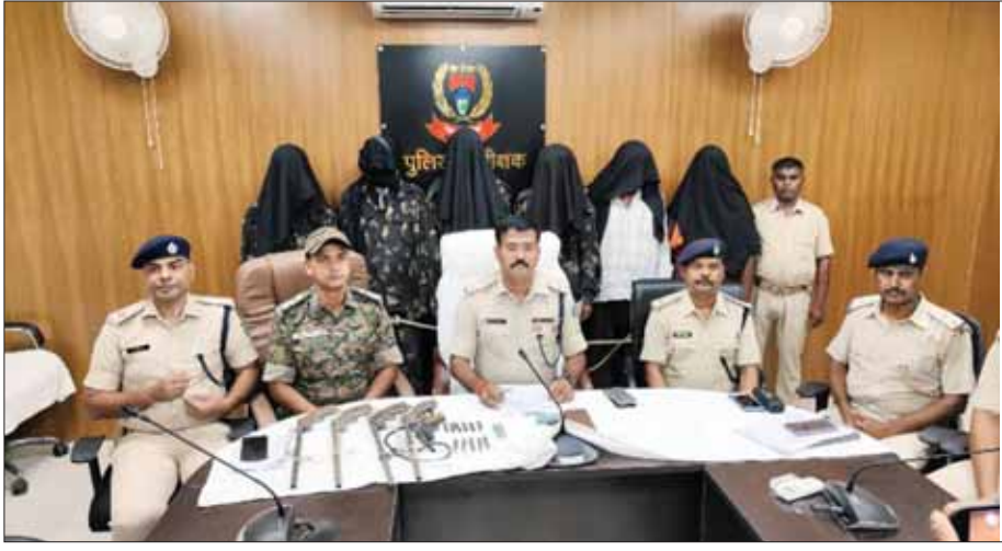
Tongapani during the raid, on seeing the police, 04 (four) uniformed armed men started running away. They were chased and caught by the police officers and armed

When the raiding team reached the forest area of