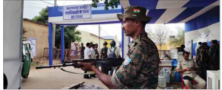
A security person stands guard outside the counting centre in Ranchi on Monday.

Most of the exit poll has predicted a sweeping victory for the ruling BJP-led National Democratic Alliance (NDA) in the general election, surpassing its numbers in 2019. Some exit polls said the NDA was likely to touch the 400 figure, one of Prime