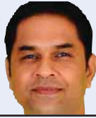
RAJYOGI BRAHMAKUMAR NIKUNJ JI

Spiritual resilience through meditation can help reform criminal behaviour