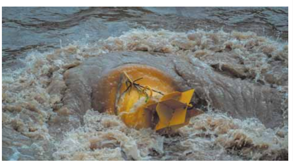
A buoy is pictured as the river Neckar has left its banks in Heidelberg, Germany on Monday. Big parts of southern Germany have been flooded after heavy rainfalls during the last days. In background the castle.

The floods caused extensive transport disruption, with long-distance rail routes to Munich from the north and west out of action on Monday. Scholz visited Reichertshofen, north of Munich, inspecting a sandbagged river bank and meeting regional officials including Markus Söder, Bavaria's governor. Söder said that the situation "remains critical and tense," with water receding in some places but new flooding and evacuations elsewhere. He noted that water levels are expected to rise in the city of Regensburg and further down the Danube. Scholz said that "this is not just one event like there have been for centuries," and that a succession of floods in recent times shows "we cannot neglect the task of halting man-made climate change".