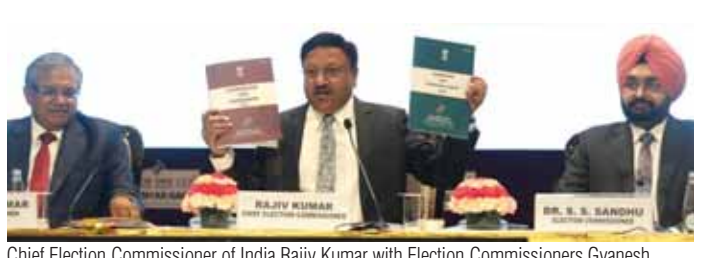
Chief Election Commissioner of India Rajiv Kumar with Election Commissioners Gyanesh Kumar and Dr SS Sandhu during a Press conference, in New Delhi, on Monday

birth anniversary. Most exit polls have predicted that Prime Minister Narendra Modi will retain power for a third straight term, with the BJP-led NDA expected to win a big majority in the Lok Sabha polls. While some exit polls have given the NDA more than 400 seats, most have predicted that it will win over 350, which is way above the majority