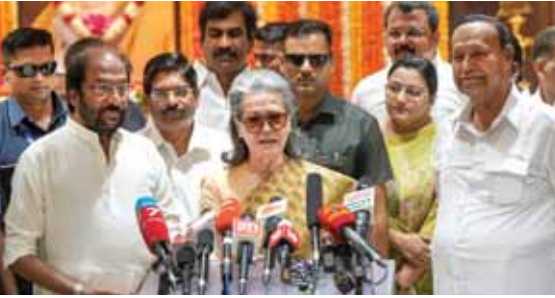
Senior Congress leader Sonia Gandhi speaks with the media during a ceremony to pay tribute to former Tamil Nadu Chief Minister M Karunanidhi on his birth anniversary, at Anna-Kalaignar Arivalayam, in New Delhi on Monday

PIONEER NEWS SERVICE ■ NEW DELHI mark of 272 seats needed to form the Government. The Congress and other INDIA Bloc parties have trashed the exit polls, claiming that these surveys were a work of "fantasy" and asserting that the opposition alliance will form the next Government. Further, the Congress led INDIA Bloc on Monday said the Election Commission (EC) has agreed to its request of counting the postal ballots first on June 4, when the results of the Lok Sabha polls are scheduled to be declared, and stressed that this is the participatory manner of promoting the spirit of democracy in a non-adversarial fashion.