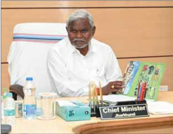
Chief Minister Champai Soren during a meeting at Project building in Ranchi on Thursday.

Chief Minister Champai Soren today said that the State government is committed to empowering farmers. In this direction, there are many schemes for the betterment of agriculture and farmers. Make sure that the benefits of these schemes reach the farmers, because the prosperity of farmers will strengthen the rural economy of the state. The CM was holding a high-level review meeting of various schemes and programs run by the Agriculture, Animal Husbandry and Cooperative Department. During this, the officials informed the Chief Minister about the progress related to important schemes related to agriculture. Soren said that the State government has a plan to waive loans up to two lakh rupees under the Jharkhand Agriculture Loan Waiver Scheme. Earlier, loans up to Rs 50 thousand of farmers were waived. In such a situation, those farmers who have outstanding agricultural loans, talk to the banks for their NPA waiver, so that maximum num-