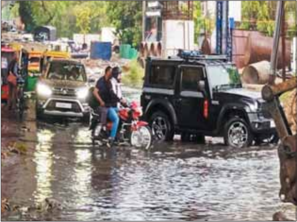
Vehicles wade through a waterlogged street after rains in Ranchi on Thursday.