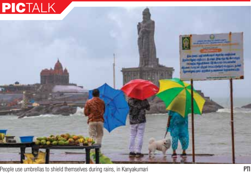
People use umbrellas to shield themselves during rains, in Kanyakumari

and unpredictable market prices, further exacerbates the financial instability of farmers. These factors underscore the need for interventions that go beyond MSP hikes to address the underlying challenges faced by farmers. While the MSP increase is a positive step, it alone is unlikely to resolve the multifaceted issues confronting the agricultural sector. Comprehensive reforms are essential to ensure sustainable improvements in the livelihoods of farmers. To achieve this, the Government must consider a holistic approach that includes enhancing agricultural infrastructure, improving access to credit and providing insurance against crop failures. Encouraging crop diversification and improving market access can also help mitigate risks associated with price volatility and reduce farmers' reliance on a few staple crops. Strengthening procurement systems to ensure timely procurement and fair pricing is crucial to making the MSP more effective. The Cabinet's approval of increased MSP for 14 Kharif crops, though inadequate, is a welcome development that reflects the Government's recognition of the pressing challenges faced by the agricultural sector. A concerted effort to implement systemic reforms alongside fair pricing mechanisms is essential for the advancement of India's farmers and the agricultural sector as a whole..