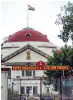
Patna High Court building.