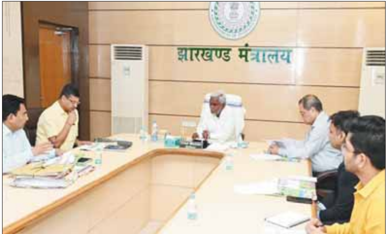
Chief Minister Champai Soren holds a review meeting with senior officials at Project building in Ranchi on Thursday.

Chief Minister Champai Soren today conducted a high-level review of the updated work progress of the Women, Child Development and Social Security Department in the presence of officials in the Jharkhand Ministry. In the meeting, the CM directed the officials to start the "Mukhyamantri Behan Beti Swablamban Protsahan Yojana" in the state soon. He told the officials that under this scheme, financial assistance will be provided to poor needy women of all classes of communities above 25 years and below 50 years of age. The CM said that our government is committed to ensuring better education, continuous improvement in the health and nutrition level of women of Jharkhand state, women empowerment, decisive role of women in the family. Soren directed the officials that the department should ensure to make all its preparations on a war footing so that the benefit of "Mukhyamantri Behan Beti Swablamban Protsahan Yojana" starts reaching eligible