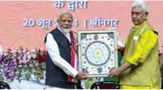
Prime Minister Narendra Modi being felicitated by Jammu and Kashmir Lieutenant Governor Manoj Sinha during "Empowering Youth, Transforming J&K" event, in Srinagar, on Thursday

Addressing a gathering at the 'Empowering Youth, Transforming J&K' event in Srinagar, Modi said the Union Government has taken the recent terror attacks very seriously. "I assure you that we will not hesitate to teach a lesson to the enemies of Jammu & Kashmir." Referring to the much-awaited Assembly polls the Prime Minister said, "The people of Jammu and Kashmir elect their representatives at the local level, through them you find ways to solve problems, what can be better than this? Therefore, now the preparations for the Assembly elections have also started. The time is not far when you will elect the new Government of Jammu and Kashmir with your votes. That day will also come soon