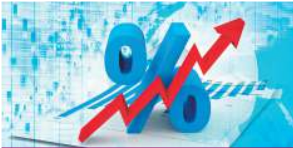
The meeting of the Reserve Bank Governor Shaktikanta Das headed MPC is scheduled for June 5 to 7. The decision will be announced on June 7 (Friday). Results of the Lok Sabha elections will be announced on June 4.

Reserve Bank of India (RBI) is unlikely to cut the benchmark interest rate at its upcoming monetary policy review meeting, taking place soon after the announcement of the Lok Sabha election results, amid inflation challenges, said experts. The Monetary Policy Committee (MPC) may also refrain from rate cut as economic growth is picking up, notwithstanding the elevated interest rate of 6.5 per cent (repo) prevailing since February 2023. The meeting of the Reserve Bank Governor Shaktikanta Das headed MPC is scheduled for June 5 to 7. The decision will be announced on June 7 (Friday). Results of the Lok Sabha elections will be announced on June 4. The central bank last hiked the repo rate to 6.5 per cent in