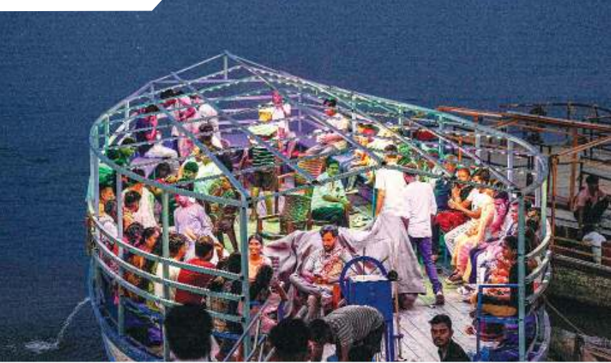
People take a boat ride on the Ganga at Assi Ghat, in Varanasi