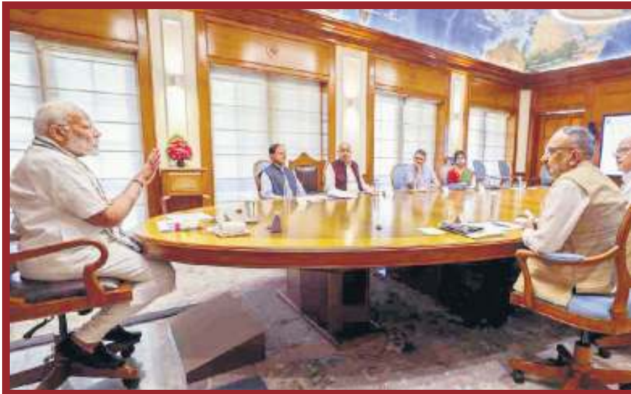
In the meeting to review the heatwave conditions in parts of the country, Modi instructed officials that proper drills for preventing and handling incidents of fire must be undertaken on a regular basis, according to an official statement.

He also said that regular drills for the maintenance of fire lines in forests and productive