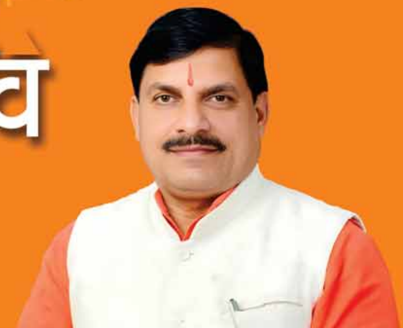
डॉ. मोहन यादव, मुख्यमंत्री