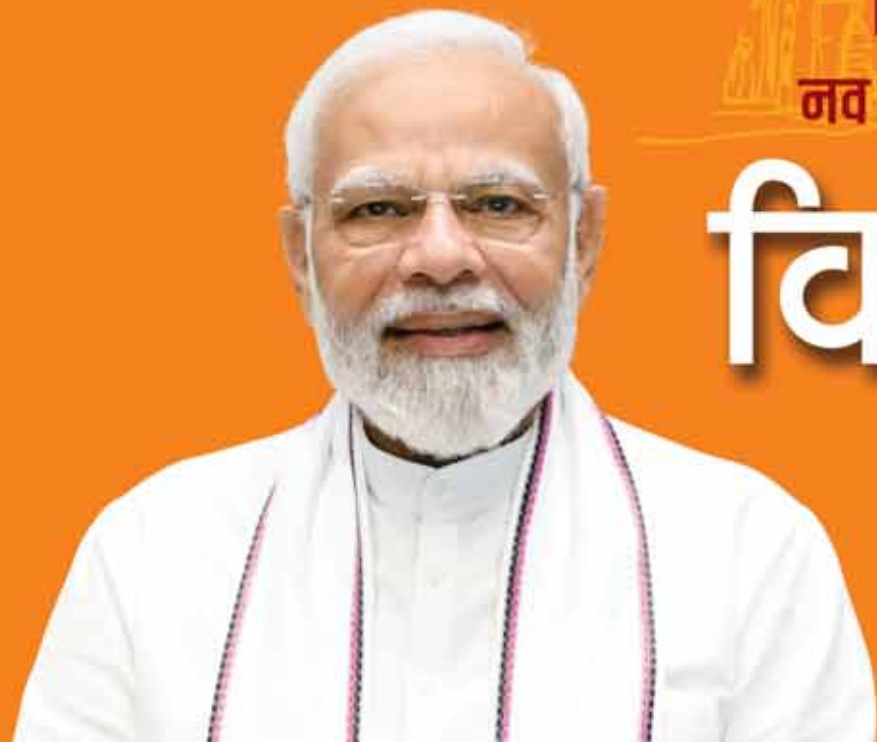
नरेन्द्र मोदी, प्रधानमंत्री