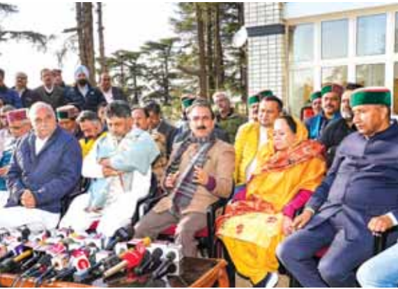
Himachal Pradesh Chief Minister, Karnataka Deputy Chief Minister DK Shivakumar, former Chhattisgarh Chief Minister Bhupesh Baghel, former Haryana Chief Minister Bhupinder Singh Hooda, HP Congress Committee (HPCC) president Pratibha Singh with central observers and others during a Press conference in Shimla on Thursday