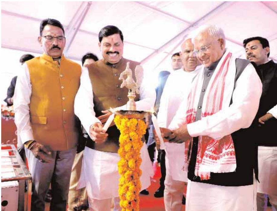
Madhya Pradesh Governor Mangubhai Patel, Chief Minister Mohan Yadav during a programme 'Viksit Bharat Viksit Madhya Pradesh' at Lal Parade Ground in Bhopal on Thursday.

land, arrangements for transfer of name have been made. Farmers will not have to make rounds of Patwari and Tehsildar for nomination transfer. Madhya Pradesh government has now started the system of cyber tehsil, under which the name will start appearing in the account as soon as one applies for name transfer and now the revenue cases will be resolved within the stipulated time. Hurting public sentiments will not be tolerated. Chief Minister Dr. Yadav said that our government is a people's government. The government is of villages, poor and farmers. Running a government means serving the people and alleviating their pain, suffering and solving their problems. Our government is working on enhancing respect and honour of the people.