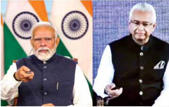
Prime Minister Narendra Modi and his Mauritian counterpart Pravind Jugnauth jointly inaugurate several India-assisted development projects at the Agalega Island in Mauritius, via a video conference, on Thursday

announced that Mauritius will be the first country to join India's Jan Aushadhi scheme, which is an initiative aimed at providing quality medicines at affordable prices. In his remarks, Modi flagged concerns over challenges in the Indian Ocean region and said India and Mauritius are "natural partners" in the maritime domain to deal with them. "Many traditional and non-traditional challenges are emerging in the Indian Ocean Region. All these challenges affect our economy. India and Mauritius are natural partners in the field of maritime security to deal with the challenges," he said at the virtual ceremony. "We are actively working to ensure