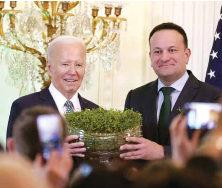
Ireland’s Prime Minister Leo Varadkar, right, presents President Joe Biden with a bowl of Shamrocks during a St. Patrick’s Day reception in the East Room of the White House, Sunday.