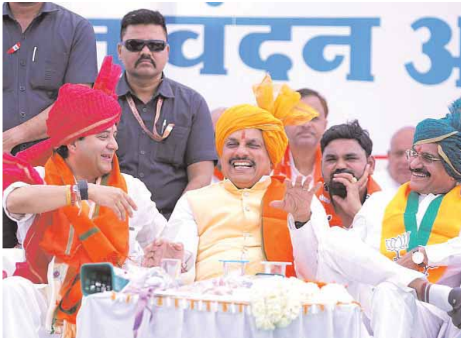
Madhya Pradesh Chief Minister Mohan Yadav, with Union Minister for Civil Aviation and BJP candidate from Guna Lok Sabha seat Jyotiraditya Scindia and BJP State President VD Sharma during Yadav Community convention in Isagarh, Ashoknagar district Madhya Pradesh on Thursday.