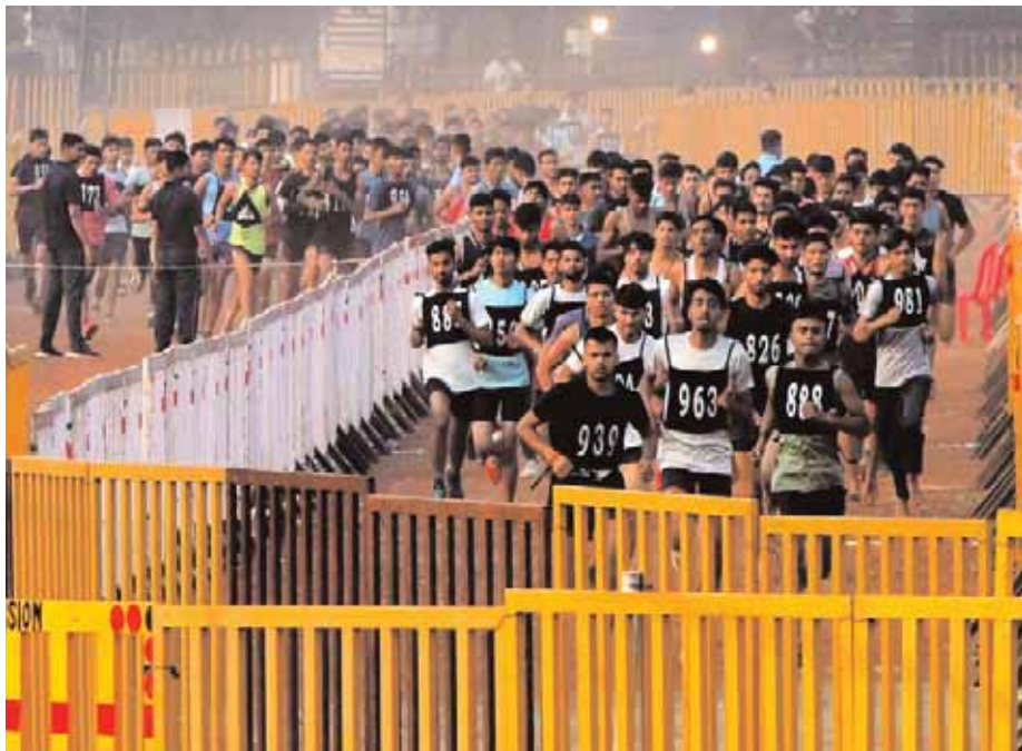
Aspirants take part in an Indian Army Recruitment Rally-2024, under Agnipath scheme, at Lal parade ground in Bhopal on Thursday.

NCCSA chairman (read CM) and despite reminders from member secretary of the panel to expedite the same before Kejriwal was arrested by ED, the file had not moved,” the AAP government said in a statement. The alleged incident took place on January 31 where the student levelled allegations against her professor of sexual harassment during a viva examination. An FIR under sections 354A (assault or criminal force to woman with intent to outrage her modesty), and 509 (word, gesture or act intended to insult the modesty of a woman) of the Indian Penal Code has been registered against the accused. The accused was subsequently apprehended in the matter.