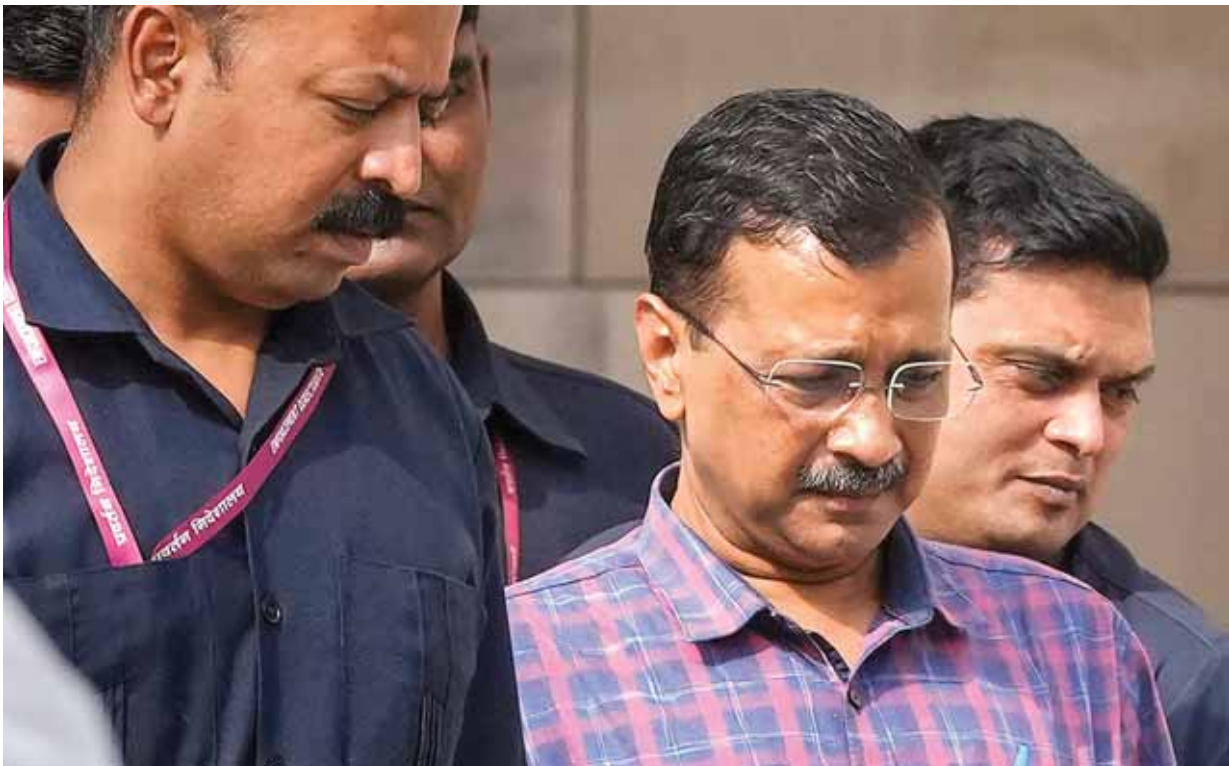
Delhi Chief Minister and AAP convenor Arvind Kejriwal comes out of the Rouse Avenue Court after he was produced by the Enforcement Directorate in the excise policy-linked money laundering case, in New Delhi, on Thursday