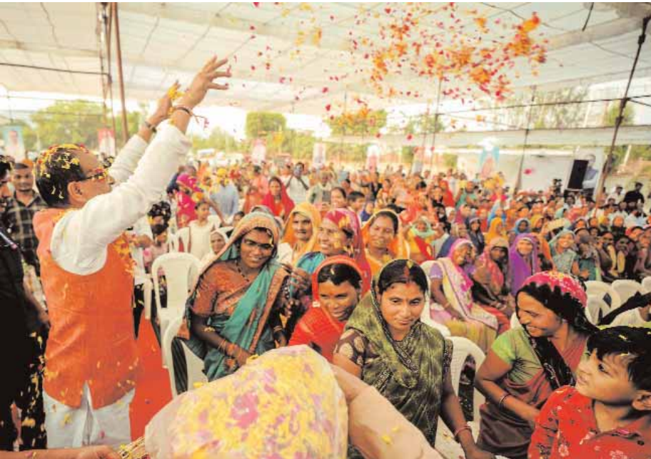
Former Madhya Pradesh Chief Minister Shivraj Singh Chouhan participates in a Holi Milan Samaroh during his election campaign in Budhni state assembly constituency for the upcoming Lok Sabha elections in Budhni, Sehore district Madhya Pradesh on Thursday.