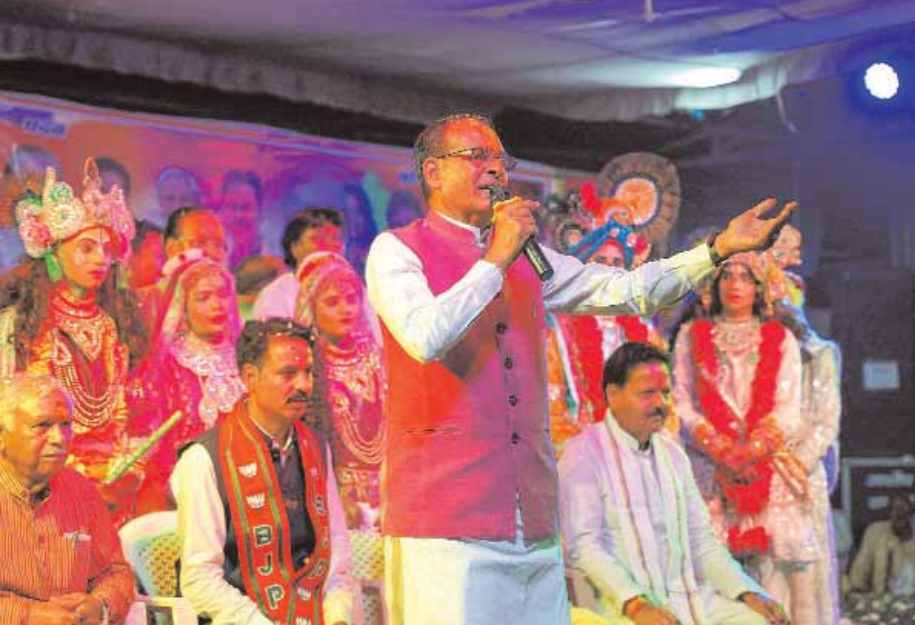
Former Madhya Pradesh Chief Minister Shivraj Singh Chouhan in a Holi Milan programme during his election campaign for the upcoming Lok Sabha elections in Raisen, Madhya Pradesh on Friday.