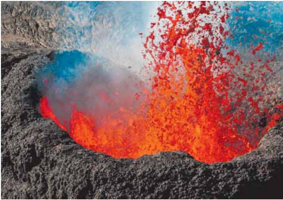
Lava erupt near the town of Grindavik, Iceland on Thursday.

cers, who had him lean against the car and made him open the trunk while they called the car rental agency before letting him go. "Though I understood that I had no choice but to put up with this abuse, it was a terrible way to be treated, a humiliating way to feel," Gossett wrote in his memoir. "I realized this was happening because I was Black and had been showing off with a fancy car — which, in their view, I had no right to be driving." After dinner at the hotel, he went for a walk and was stopped a block away by a police officer, who told him he broke a law prohibiting walking around residential Beverly Hills after 9 p.m. Two other officers arrived and Gossett said he was chained to a tree and handcuffed for three hours. He was eventually freed when the original police car returned.