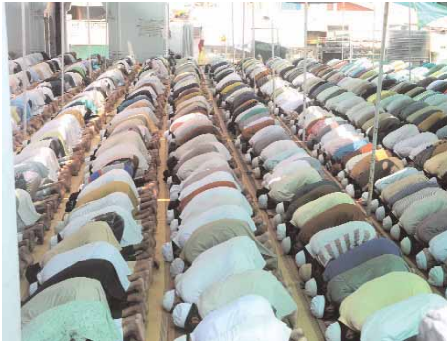
Muslim devotees offer prayer on the third Friday during the holy month of Ramadan at Jama Masjid in Bhopal on Friday.

Thursday the day temperature had reached 40.5 degrees Celsius. The weather changed suddenly on Friday. It remained cloudy till 9 am. After this there was bright sunshine. However, the weather is expected to change in the afternoon. There is an alert of rain and strong wind in the forecast of the Meteorological Department. It was extremely hot in Bhopal on Thursday. Due to this the day temperature reached 40.5 degrees Celsius. If we look at the March data of the last 11 years, Bhopal was the hottest in March for the fourth time. Earlier, the temperature was 40.8 degrees on March 31, 2017, 40.8 degrees on March 31, 2019, and 41 degrees on March 30, 2021. A drop in temperature may be seen on Friday.