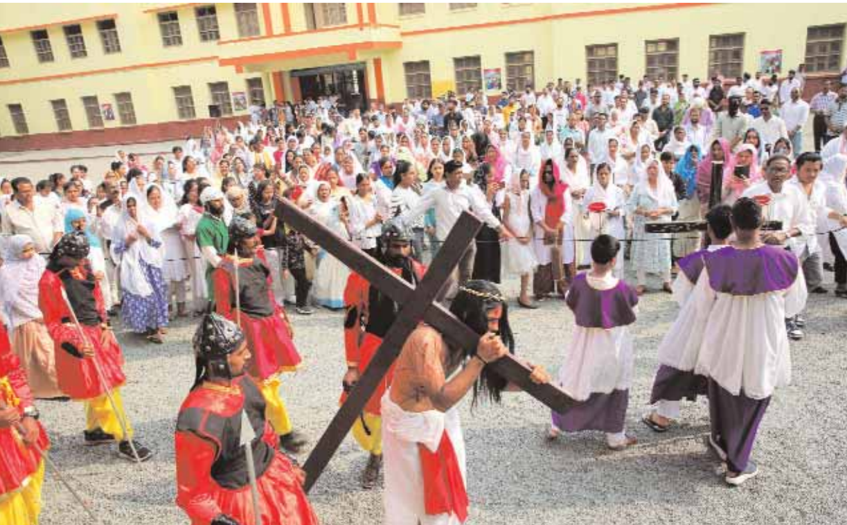
Christian devotees re-enact the scene of crucifixion of Jesus Christ during a religious procession on Good Friday at St Francis Assisi Cathedral Church, in Bhopal on Friday.