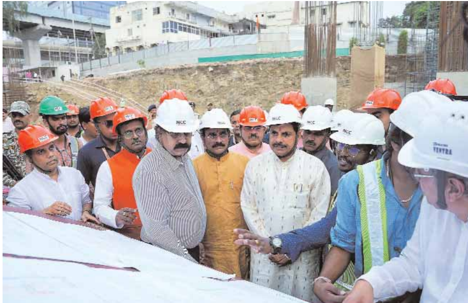
Madhya Pradesh Chief Minister Mohan Yadav and BJP State President VD Sharma inspect the under-construction building of BJP State headquarters in Bhopal on Friday.

stituencies. Three auxiliary polling stations each have been made in Gwalior Rural, Raghogarh, Bhopal South-West and Mandsaur , four each in Guna-Chhindwara, Bhopal Central, Barwah and Indore-4 and five each in Gwalior, Gwalior South, Dabra and Berasia assembly constituencies. Seven auxiliary polling stations have been made in Jabalpur East, eight each in Narela and Depalpur, nine each in Ujjain South and Ujjain North, 18 in Indore-1, 18 in Indore-2, 19 in Sanwer, 20 in Dr. Ambedkar Nagar (Mhow), 29 in Huzur, 50 in Indore-5 and 53 in Rau assembly constituency.