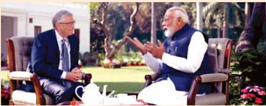
Prime Minister Narendra Modi with Microsoft co-founder Bill Gates during a meeting at his residence in New Delhi on Friday