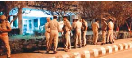
Security personnel stand guard at Government Medical College where gangster-turned-politician Mukhtar Ansari was admitted, in Banda, on Thursday

Mukhtar Ansari, a mafia-turned lawmaker, passed away on Thursday after suffering a heart attack while in custody at Banda jail. A senior police official confirmed that Mukhtar collapsed in his barrack within the jail premises due to a heart attack. He was swiftly transported to a hospital in Banda, where medical personnel attempted to revive him. However, Mukhtar ultimately succumbed to cardiac arrest, as reported by a medical bulletin issued by Rani Durgawati Medical College. Following Mukhtar's demise, authorities have heightened security measures across various regions, including Lucknow, Mau, Ghazipur, and Varanasi. State-wide enforcement of Section 144 has been initiated in response to the situation. This tragic incident occurred amidst concerns over Mukhtar's declining