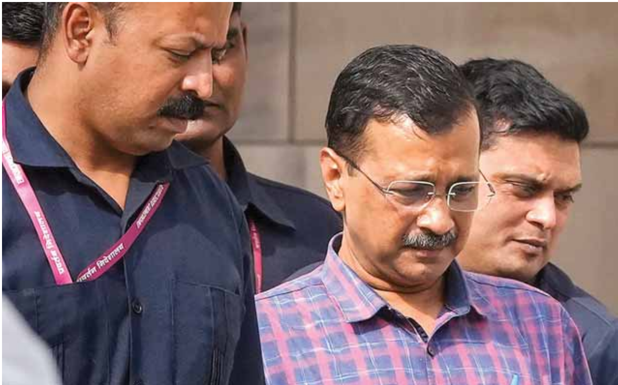
Delhi Chief Minister and AAP convenor Arvind Kejriwal comes out of the Rouse Avenue Court after he was produced by the Enforcement Directorate in the excise policy-linked money laundering case, in New Delhi, on Thursday