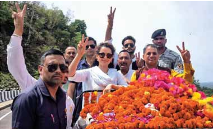
BJP candidate actor Kangana Ranaut during a roadshow ahead of Lok Sabha elections, in Mandi

“Development is BJP's main agenda and we will spare no effort to win the elections under the guidance of Prime Minister Modi,” she said, adding that the “people of Mandi will tell what is in their hearts”. This was Ranaut's first public appearance in her constituency after getting the BJP ticket on March 24. In October 2022, Ranaut had said she was open to contesting from Mandi if the BJP offered her a ticket. Crediting PM Modi with a “change in the country” since 2014, Ranaut had said a feeling of pride and nationalism prevails among every Indian. At present, the Mandi Lok Sabha seat is being represented by Himachal Pradesh Congress Committee president Pratibha Singh, wife of former chief