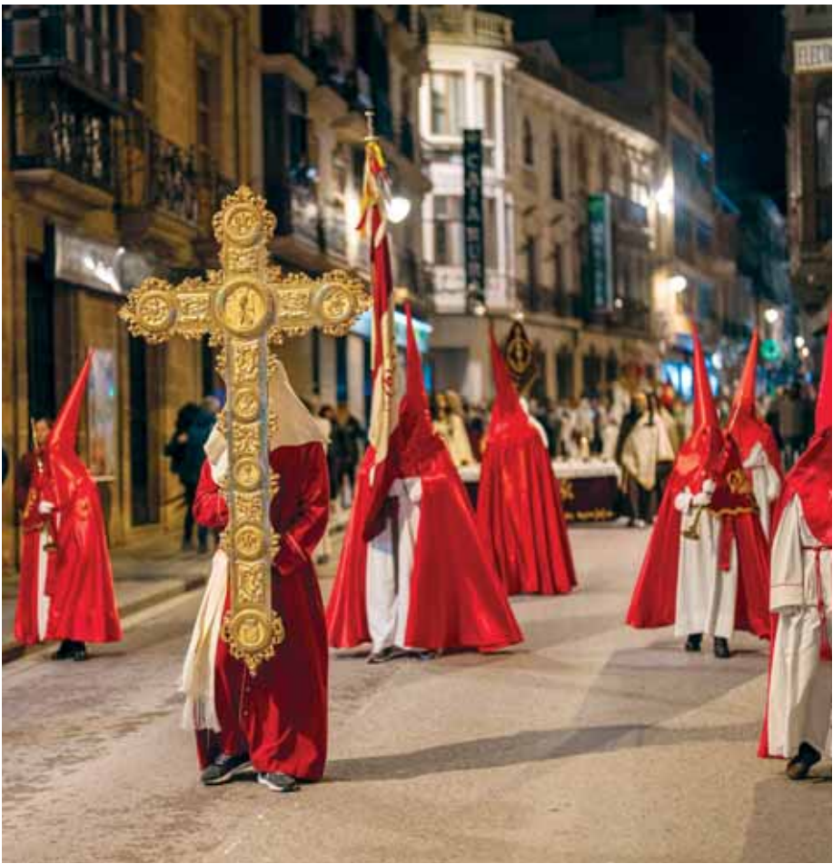
Members of “Muy Antigua Hermandad del Señor de la Humildad y María Santísima de los Dolores” Catholic brotherhood walk during a Holy Week procession in the southern city of Alcalá la Real, Spain, on Thursday