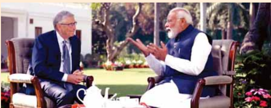
Prime Minister Narendra Modi with Microsoft co-founder Bill Gates during a meeting at his residence in New Delhi on Friday