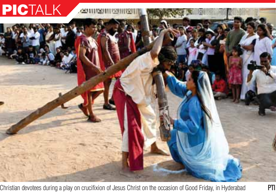
Christian devotees during a play on crucifixion of Jesus Christ on the occasion of Good Friday, in Hyderabad

curbing rising pay and pension expenses. Despite the offered benefits, concerns have arisen regarding its potential impact on military ethos, professionalism and operational efficiency. Questions linger regarding the maintenance of unit cohesion, the readiness of inexperienced Agniveers for live operational scenarios and the long-term attractiveness of military service. Critics question the scheme's impact on the regimental system of the Indian Infantry and advocate for rigorous testing before full implementation. While some argue for gradual induction to mitigate adverse effects, others emphasise the need for empirical evaluation to safeguard military standards. Broadly speaking, the scheme has not gone down well with the aspiring youth. They feel that most of them would be left without a job in their prime. Moreover, the Gurkhas of Nepal have summarily rejected this scheme and are now looking for options in other countries. This seriously jeopardises India's defence muscle. It has been almost four years since the scheme was launched, and it is the first time the Government has shown its openness to make amendments. The Congress has already termed it an election gimmick. Whatever the reasons, it would be good if the Govt returns to the drawing board and reconsiders the various issues in national interest.