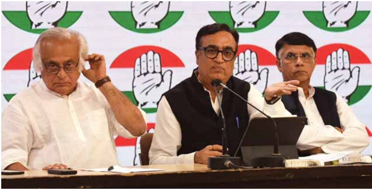
Congress leaders Jairam Ramesh, Ajay Maken and Pawan Khara during a Press conference in New Delhi on Friday