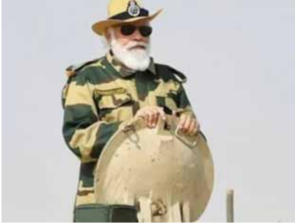
Chauhan will be present at the exercise, it was learnt.

As regards the exercise, it was learnt Prime Minister Modi may urge the military leadership to develop strategies and tactics suited to Indian conditions security challenges. The top military brass including Chief of Defence Staff(CDS)General Anil