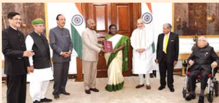
Ram Nath Kovind, chairman of the High-Level Committee (HLC) on 'One Nation, One Election', presents the report to President Droupadi Murmu, in New Delhi, on Thursday. Union Ministers Amit Shah and Arjun Ram Meghwal, DPAP leader Ghulam Nabi Azad are also seen