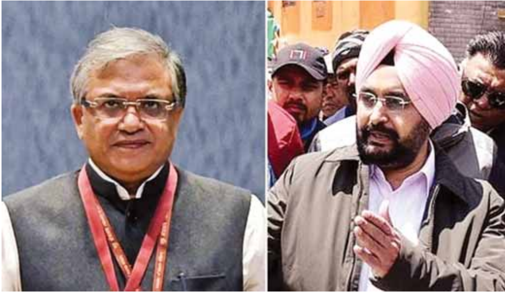
Former IAS officers Gyanesh Kumar and Sukhbir Singh Sandhu

The decks are cleared for the announcement of Lok Sabha elections schedule after former IAS officers Gyanesh Kumar and Sukhbir Singh Sandhu were on Thursday appointed as Election Commissioners completing the quorum of the election watchdog which was necessitated due to the sudden resignation of Arun Goel as the lone EC last week. The Nirvachan Sadan was left with only Chief Election Commissioner (CEC) Rajiv Kumar while one was already vacant and with the two appointments, now the body is complete to take the call to announce the poll schedule. Sources said general elections can be announced on Friday following which the model code of conduct will come into effect. The Legislative Department of the Ministry of Law and Justice issued a notification announcing the appointments. "In exercise of powers conferred by section 4 of the Chief Election Commissioner and other Election Commissioners (Appointment, Conditions of Service and Term of Office) Act, 2023 (Act No. 49 of 2023), the President is pleased to appoint Gyanesh Kumar, IAS (Retd) and Dr Sukhbir Singh Sandhu, IAS(Retd) as Election