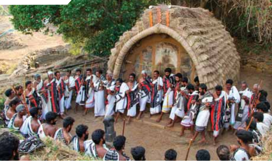
Members of Toda tribal community during the celebrations of temple festival at Mallikorai Mund, in Ooty