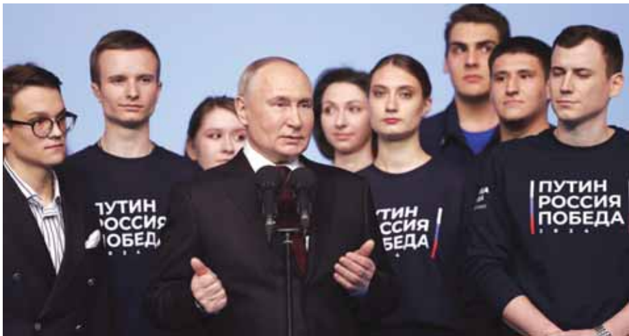
Russian President Vladimir Putin speaks during a visit to his campaign headquarters after a presidential election in Moscow, Russia, on Sunday