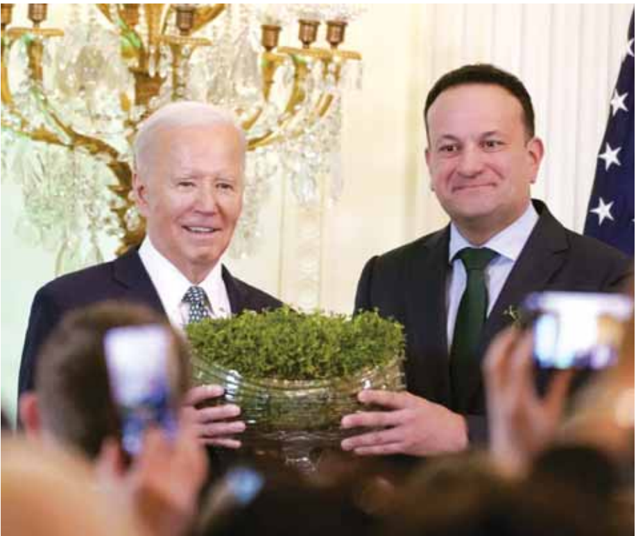
Ireland’s Prime Minister Leo Varadkar, right, presents President Joe Biden with a bowl of Shamrocks during a St. Patrick’s Day reception in the East Room of the White House, Sunday.