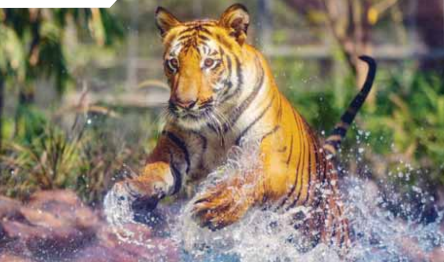
A Royal Bengal Tiger at the Byculla zoo on the World Wildlife Day, in Mumbai