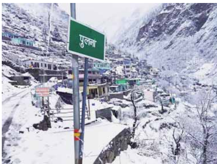
Pulna in Chamoli district covered in a blanket of snow after fresh snowfall in the higher reaches on Sunday

20,000 non-residential property taxpayers. He said, "We have a target of collecting over Rs 60 crore this financial year and observing the hike in the number of taxpayers, we will certainly achieve it." He also informed that the MCD collected Rs 4.5 crore as property tax in 2014 and now, it will be collecting over Rs 60 crore in 2024. This growth is tremendous and it will continue further in the coming years too, he added.