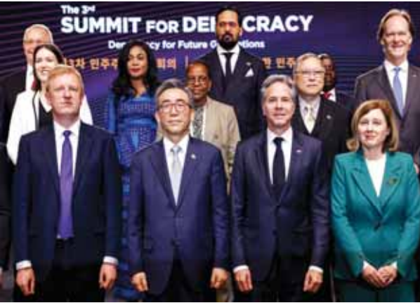
US Secretary of State Antony Blinken, bottom second right, South Korean Foreign Minister Cho Tae-yul, bottom second left, Britain’s Deputy Prime Minister Oliver Dowden, bottom left, and other leaders pose for a photo at the third Summit for Democracy in Seoul, South Korea.

speed of 50 kilometres (about 30 miles) per hour. The US State Department condemned the launches, saying they pose a threat to the North’s neighbours and undermine regional security. A State Department statement said the US commitment to the defence of South Korea and Japan remain “ironclad.” The US stations a total of 80,000 troops in South Korea and Japan, the backbone of its military presence in the Asia-Pacific region. During the South Korea-US military drills that ended on Thursday, North Korean leader Kim Jong Un guided a series of military training exercises involving tanks, artillery guns and paratroopers and called for greater war fighting capabilities. The 11-day South Korean-US drills involved a computer-simulated command post training and 48 kinds of field exercises, twice the number conducted last year. The North didn’t perform any missile tests during its rivals’ training, however. Its missile tests are considered much bigger provocations as North Korea has been pushing hard to mount nuclear warheads on its missiles targeting the US mainland and its allies. Many experts say North Korea already has nuclear-armed missiles capable of reaching all of South Korea