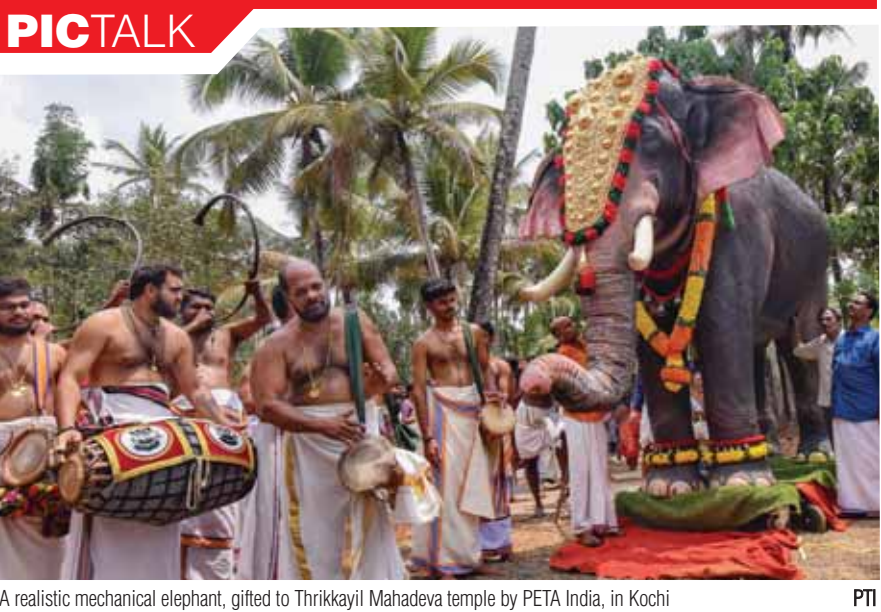
A realistic mechanical elephant, gifted to Thirikkayil Mahadeva temple by PETA India, in Kochi

Many Russians view Putin as a bulwark against perceived foreign aggression, which has further enhanced his popularity. Putin can gain support and unity from the electorate by portraying himself as a global champion of Russian interests, which will validate his authority in public eyes. In addition, Putin has adeptly appropriated State institutions and utilised his command over the security apparatus to guarantee election results that are advantageous to his Government. Incidents of political persecution, like the detention of well-known activists and opposition figures such as Alexei Navalny, serve as a sobering reminder of what happens when you challenge Putin's authority. Putin aims to preserve control over important State power levers in order to secure his ongoing supremacy in Russian politics. Putin's complex campaign of manipulation, disinformation and pressure is part of his effort to gain legitimacy in the Russian elections. Putin aims to hold on to power and create an air of legitimacy by managing the election process, enhancing his public persona and taking advantage of international crises. Nonetheless, the enduring opposition and the diminishing confidence in Governmental establishments underscore the vulnerability of Putin's governance, implying that the pursuit of legitimacy is a continuous conflict in Russian politics.