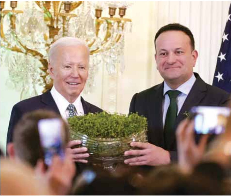
Ireland’s Prime Minister Leo Varadkar, right, presents President Joe Biden with a bowl of Shamrocks during a St. Patrick’s Day reception in the East Room of the White House, Sunday.