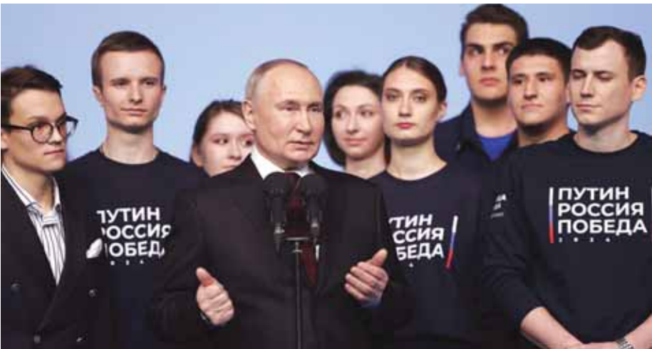
Russian President Vladimir Putin speaks during a visit to his campaign headquarters after a presidential election in Moscow, Russia, on Sunday

the Great, who ruled during the 18th century. As early results came in, Putin hailed them as an indication of “trust” and “hope” in him — while critics saw them as another reflection of the preordained nature of the election. “Of course, we have lots of tasks ahead. But I want to make it clear for everyone: When we were consolidated, no one has ever managed to frighten us, to suppress our will and our self-conscience. They failed in the past and they will fail in the future,” he said at a meeting with his campaign staff after polls closed. Any public criticism of Putin or his war in Ukraine has been stifled. Independent media have been crippled. His fiercest political foe, Alexei Navalny, died in an Arctic prison last month, and other critics are either in jail or in exile. Beyond the fact that voters had virtually no choice, independent monitoring of the election was extremely limited. Russia's Central Election Commission said Monday that with nearly 100% of precincts counted, Putin got 87% of the vote. Central Election Commission chief Ella Pamfilova said that nearly 76 million voters cast their ballots