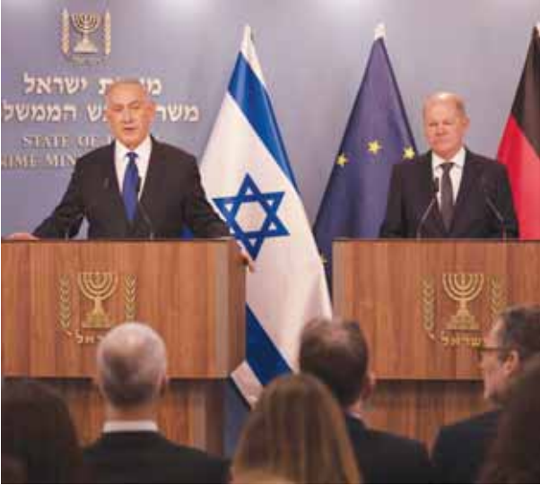
Israeli Prime Minister Benjamin Netanyahu, left, delivers his speech after a meeting with German Chancellor Olaf Scholz in Jerusalem, Sunday.