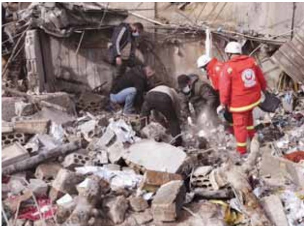
Paramedic workers search for victims in the rubble of a paramedic center that was destroyed by an Israeli airstrike early Wednesday in Hebbariye village, south Lebanon on Wednesday.

An Israeli airstrike on a paramedics centre linked to a Lebanese Sunni Muslim group in south Lebanon killed seven of its members early on Wednesday and triggered a rocket attack from Lebanon that killed one person in northern Israel, officials said. The strike on the village of Hebbariye came after a day of airstrikes and rocket attacks between Israel's military and Lebanon's Hezbollah group along the Lebanon-Israel border, raising concerns of further escalation along the frontier that has been active for the past five months of the Israel-Hamas war. The airstrike after midnight on Tuesday hit an office of the Islamic Emergency and Relief Corps, according to the Lebanese Ambulance Association. It was one of the deadliest single attacks since violence erupted along the border. The paramedics association list-