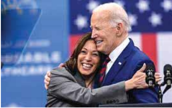
RALEIGH (NORTH CAROLINA)

President Joe Biden and Vice-President Kamala Harris on Tuesday promoted their healthcare agenda in the battleground state of North Carolina, arguing that Democrats like themselves would preserve access to care while Republicans would reverse gains made over the past decade and a half. Fourteen years after President Barack Obama signed the Affordable Care Act into law, the White House still sees health care as a winning issue during a campaign in which Biden has sometimes found himself on the defensive when it comes to immigration or the economy. Republicans have opposed Biden's signature initiatives to lower medical costs, and they've seized opportunities to restrict abortion rights after the US Supreme Court overturned Roe v Wade. "It's sick. Now they want to quote, his words, terminate the ACA, as my predecessor says," Biden said, referring to Republican former President Donald Trump. "If that were ever to happen, we'd also terminate a lot of lives as well. But we're not going to let that happen, are we? We're not going to let that happen." North Carolina was Biden's final stop on a tour of battleground states after his State of the Union address this month, which jump-started a frenzied travel schedule as the Democratic president makes his case for a second term in a likely rematch with Trump, the presumptive Republican nominee. The state is also a healthcare success story for the president. The American Rescue