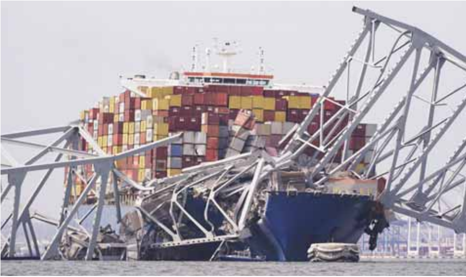
A Coast Guard cutter passes a cargo ship that is stuck under the part of the structure of the Francis Scott Key Bridge after the ship hit the bridge Tuesday in Baltimore.