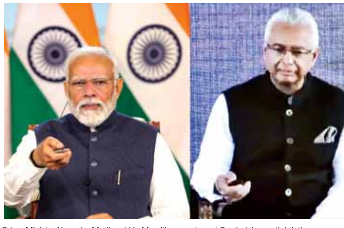
Prime Minister Narendra Modi and his Mauritian counterpart Pravind Jugnauth jointly inaugurate several India-assisted development projects at the Agalega Island in Mauritius, via a video conference, on Thursday

announced that Mauritius will be the first country to join India's Jan Aushadhi scheme, which is an initiative aimed at providing quality medicines at affordable prices. In his remarks, Modi flagged concerns over challenges in the Indian Ocean region and said India and Mauritius are "natural partners" in the maritime domain to deal with them. "Many traditional and non-traditional challenges are emerging in the Indian Ocean Region. All these challenges affect our economy. India and Mauritius are natural partners in the field of maritime security to deal with the challenges," he said at the virtual ceremony. "We are actively working to ensure