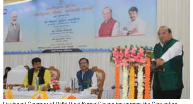
Lieutenant Governor of Delhi Vinai Kumar Saxena inaugurates the Convention Centre, District Centre, in Shastri Park.

STAFF REPORTER ■ NEW DELHI Delhi Lieutenant Governor Vinai Kumar Saxena on Thursday inaugurated the Convention Centre at District Centre at Shastri Park, in north east Delhi. The Convention Centre will serve as a vital hub for public gatherings, cultural, religious activities and marriage functions and will facilitate the general public of the densely populated area of Shastri Park, Seelampur, Gautampuri, Ghonda Chauhan, and Brahmpuri. The total cost of the project is Rs 6 crore. BJP MP Manoj Tiwari, was also present during the event. Speaking at the inauguration, Lt Governor said, "Earlier, people living in the colonies here had to travel long distances for weddings, parties or any other functions, and had to spend a lot of money for the same. He hope that the construction of this convention centre will help a lot in reducing this problem." Saxena further said, people