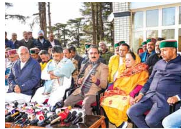
Himachal Pradesh Chief Minister, Karnataka Deputy Chief Minister DK Shivakumar, former Chhattisgarh Chief Minister Bhupesh Baghel, former Haryana Chief Minister Bhupinder Singh Hooda, HP Congress Committee (HFCC) president Pratibha Singh with central observers and others during a Press conference in Shimla on Thursday

With Himachal Pradesh Chief Minister Sukhvinder Singh Sukhu taking responsibility for Congress leader Abhishek Manu Singhvi's defeat in the Rajya Sabha polls, Priyanka Gandhi, a member of Congress' first family, once again proved to be the saviour for the party in preserving the Government in the state. After intense deliberations within the party, the nominated central observers, and Priyanka, who serves as general secretary without any specific charge, Himachal Pradesh Assembly Speaker Kuldeep Singh Pathania on Thursday disqualified six Congress MLAs who had cross-voted in the recent Rajya Sabha polls for the lone seat in the state. They had also abstained from voting on Budget in the Assembly, defying a party whip to vote in favour of the Government on the Finance Bill. The ruling Congress had sought their disqualification on this ground. Following the