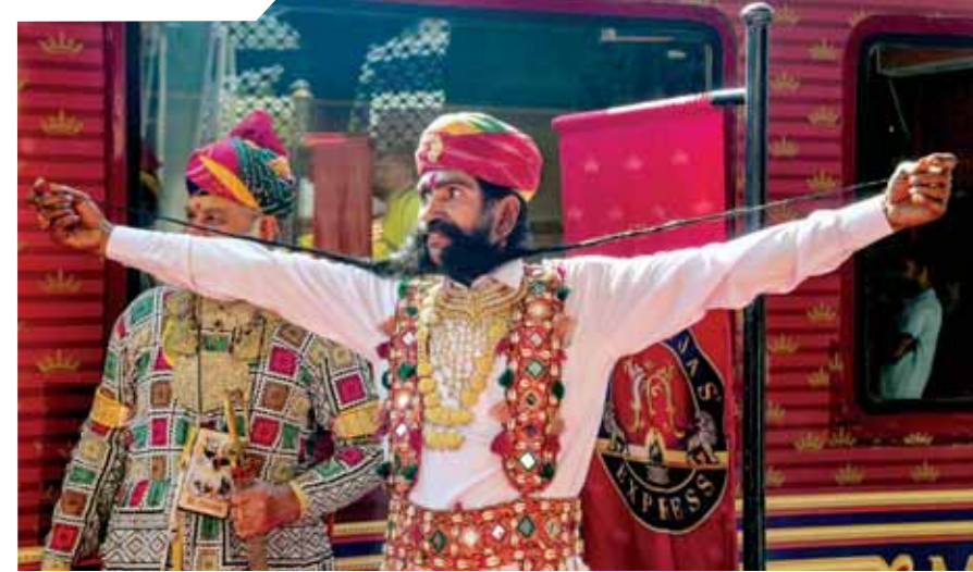
A local artiste with long mustache poses for photos, in Bikaner