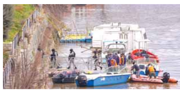
Marine Commandos (MARCOS) leave after patrolling the Jhelum river ahead of Prime Minister Narendra Modi's visit to Kashmir valley, in Srinagar on Wednesday

There has been a delay in the formalisation of Lok Sabha seat-sharing arrangement in Maharashtra. The BJP announced its first list of 19 candidates on Saturday. However, it did not announce its candidates for Maharashtra, as the party had not formalised its seat tie-up with its alliance partners — Shiv Sena (Shinde) and NCP (AP). The State BJP leaders, including Devendra Fadnis, wanted Shah to intervene and firm up the seat-sharing arrangement with the Shinde Sena and Ajit Pawar BJP. During his two rounds of talks, Shinde hammered out a seat-sharing deal with the Shinde Sena and NCP (AP) on Tuesday night and Monday morning.