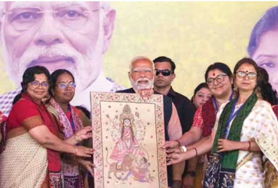
Prime Minister Narendra Modi during the 'Nari Shakti Vandan Abhinandan' programme, at Barasat in North 24 Parganas district, on Wednesday

Mamata Banerjee Government for promoting atrocities against women, as seen at Sandeshkhali block in North 24 Parganas. "What happened to the mothers and sisters of Sandeshkhali - which hit the national headlines after women here recently rose up in revolt against land-grab and sexual assault against them - was a matter of shame," he said. "The TMC has committed a big sin by protecting the people who had insulted our women. It is a matter of big shame, and I am sure the incident at Sandeshkhali has angered the women of Bengal. "This anger will not remain limited to Sandeshkhali; the storm that brewed there will engulf the entire State," the PM said. Addressing an all-women's rally named Nari Shakti Vandan Abhinandan at Barasat in North 24 Parganas, Modi criticised how corruption and abuse of women had become the hallmark of the Indian National Democratic Inclusive Alliance and its constituent TMC. Targeting the INDIA leaders the PM said, "Realising that the National Democratic Alliance was coming back to