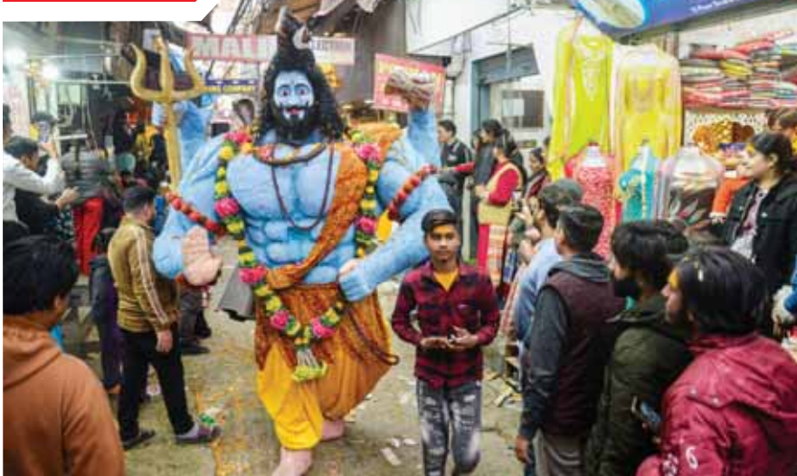
An artiste dressed as Lord Shiva takes part in a religious procession ahead of the 'Maha Shivratri,' in Jalandhar