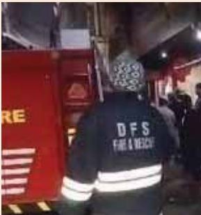
The charred bodies of the 11 victims, 10 men and a woman, were recovered from the factory, which also houses chemical godowns. The fire, which was preceded by a blast, had spread to nearby buildings, including a drug rehabilitation centre and eight shops. A police constable also sustained injuries, including burns, in the blaze. In another incident in February, an 83-year-old woman died and her granddaughter sustained injuries after they jumped off the fourth floor of a residential building in southwest Delhi's Dwarka when a fire broke out in their apartment.

At least 39 people have died and more than 100 have suffered injuries in fire incidents in the national Capital so far this year, officials data on Thursday. According to data released by the Delhi Fire Services (DFS), 16 people lost their lives in fire in January, another 16 in February and seven in March till Thursday. Fire incidents led to 51 injuries in January, 42 in February and 14 until March 14, it stated. From January 1 to March 14, the DFS has received 2,682 fire-related calls. On Thursday, two children and a married couple died due to suffocation after a massive fire broke out in a residential building in the Shastri Nagar area of Delhi's Shahdara. In another major incident, 11 people died in an explosion and subsequent blaze in a paint factory at Dayalpur market in outer Delhi's Alipur. Four people were injured in the fire that broke out on February 15.