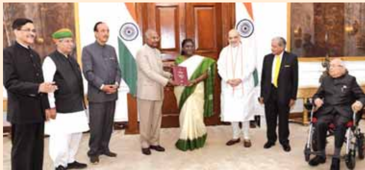
Ram Nath Kovind, chairman of the High-Level Committee (HLC) on 'One Nation, One Election', presents the report to President Droupadi Murmu, in New Delhi, on Thursday. Union Ministers Amit Shah and Arjun Ram Meghwal, DPAP leader Ghulam Nabi Azad are also seen