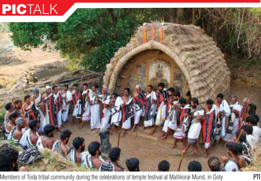
Members of Toda tribal community during the celebrations of temple festival at Mallikorai Mund, in Ooty

Addressing concerns related to federalism and democratic principles while ensuring the synchronisation of electoral cycles poses a formidable challenge. Even if the recommendations are accepted, it would be a long road to actualisation of ‘One Nation, One Election.’ Besides, simultaneous elections might dilute the regional narrative, leading to a focus primarily on national issues. The Kovind panel’s report provides insights into mitigating this risk and preserving the essence of federalism within the framework of simultaneous elections. Also, elections incur substantial costs for the exchequer; simultaneous elections could potentially reduce this financial burden. However, the initial investment required for synchronisation, including infrastructure development and voter education, needs careful consideration. The analysis of financial implications will influence the decision regarding the feasibility of this reform. It would indeed be a good idea to reach a political consensus as every party is a stakeholder. The implications of this report extend beyond administrative efficiency to encompass constitutional, political and financial dimensions. As stakeholders await the findings and recommendations, it is imperative to engage in constructive dialogue to address concerns and chart a path forward that upholds the democratic ethos while enhancing the effectiveness of governance.