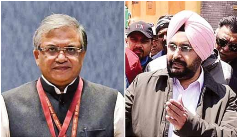
Former IAS officers Gyanesh Kumar and Sukhbir Singh Sandhu

The decks are cleared for the announcement of Lok Sabha elections schedule after former IAS officers Gyanesh Kumar and Sukhbir Singh Sandhu were on Thursday appointed as Election Commissioners completing the quorum of the election watchdog which was necessitated due to the sudden resignation of Arun Goel as the lone EC last week. The Nirvachan Sadan was left with only Chief Election Commissioner (CEC) Rajiv Kumar while one was already vacant and with the two appointments, now the body is complete to take the call to announce the poll schedule. Sources said general elections can be announced on Friday following which the model code of conduct will come into effect. The Legislative Department of the Ministry of Law and Justice issued a notification announcing the appointments. "In exercise of powers conferred by section 4 of the Chief Election Commissioner and other Election Commissioners (Appointment, Conditions of Service and Term of Office) Act, 2023 (Act No. 49 of 2023), the President is pleased to appoint Gyanesh Kumar, IAS (Retd) and Dr Sukhbir Singh Sandhu, IAS(Retd) as Election