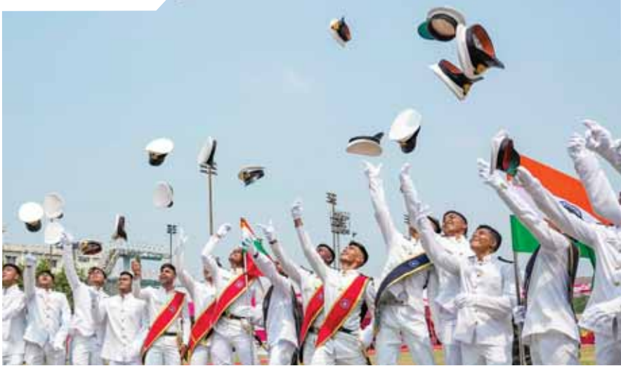
Cadets celebrate during the passing out ceremony of class 2020-2024 of B. Tech Marine Engineering, in Kolkata