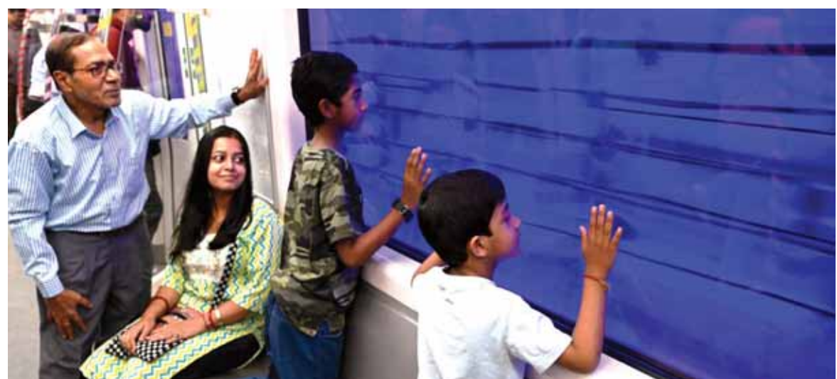
Commercial services of the country's first underwater metro train commenced in Kolkata on Friday with hundreds of passengers erupting into jubilation on their first ride. A train began its journey from the Howrah Maidan station on the East-West metro corridor of Kolkata at 7 am with loud cheers and claps from commuters, while another started from Esplanade station at the same time. The commercial services began after Prime Minister Narendra Modi had on March 6 inaugurated the Howrah Maidan-Esplanade section of Kolkata Metro's East-West corridor