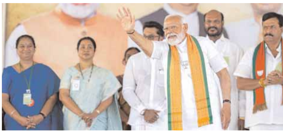
Prime Minister Narendra Modi waves to supporters during a public meeting, ahead of the Lok Sabha election, in Kanyakumari, on Friday