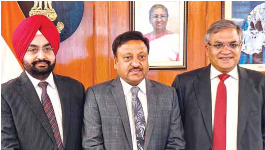
Chief Election Commissioner of India (CEC) Rajiv Kumar with the two newly-appointed Election Commissioners Sukhbir Singh Sandhu and Gyanesh Kumar

The EC will also announce the dates for the Assembly elections scheduled in Odisha, Sikkim, Arunachal Pradesh and Andhra Pradesh. Jammu and Kashmir, and Ladakh, are also set to vote, in line with a Supreme Court order directing the conduct of Assembly polls by September 30 as the first step towards restoration of statehood.