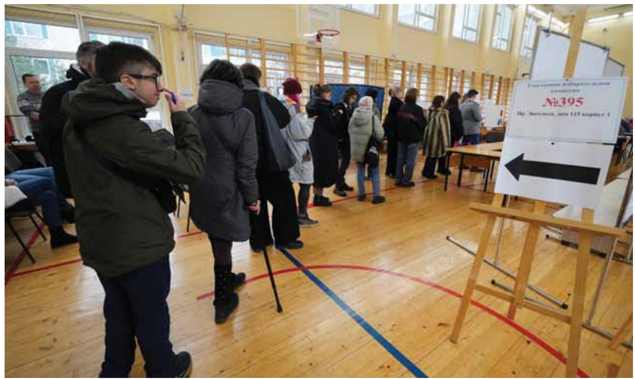
Voters queue at a polling station in St Petersburg, Russia, at noon local time on Sunday

military personnel with civilians and continue the operations of two helicopters and a Dornier aircraft provided to the country for humanitarian and medical evacuation services. Muizzu's administration has also said that it would review more than 100 agreements signed with India by the previous governments. Muizzu "affirmed the importance of the Maldives navigating its course towards self-reliance and remaining an independent and sovereign nation in every aspect," the press release said on Friday. Muizzu said that Maldives' independence and sovereignty "must be in the common interest of the entire populace, despite varying ideologies". He added that this would not impede the Maldives' close relations with all countries. Muizzu has affirmed that no Indian military personnel, not even those in civilian clothing, would be present inside his country after May 10.