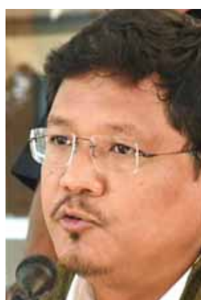
@narendramodi Ji secures over 400 seats. Thank you so much Shri @SangmaConrad Ji," Sarma posted on X. The BJP has named Union Earth Sciences Minister Kiren Rijiju for the Arunachal West Lok Sabha seat and Tapir Gao as its candidate for the Arunachal East seat. Polling will be held in the two seats in the first phase on April 19. The NPP, which leads the ruling coalition in Meghalaya, had won five seats in the last assembly elections in Arunachal Pradesh.

The NPP is a part of the BJP-led NDA at the Centre. "The National People's Party has decided not to contest the two Lok Sabha seats in Arunachal Pradesh. Being partners in the NDA, the NPP National Committee has decided to support NDA candidates in Arunachal Pradesh and has directed its State Committee to extend support to the NDA candidates," Sangma posted on X. Hailing Sangma's decision, Assam Chief Minister Himanta Biswa Sarma said such commitment of NDA partners will ensure over 400 seats in the Lok Sabha elections for the ruling alliance. "Such unparalleled commitment among our partners will ensure the NDA under the leadership of Hon'ble Prime Minister Shri