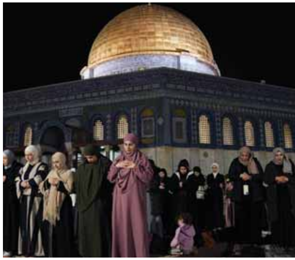
Muslim worshippers perform "tarawih," an extra lengthy prayer held during the Muslim holy month of Ramadan, next to the Dome of Rock at the Al-Aqsa Mosque compound in the Old City of Jerusalem on Saturday.

US Senate Majority Leader Chuck Schumer, the highest-ranking Jewish official in the country and a strong Israel supporter, then called on Israel to hold a new election, saying Netanyahu had "lost his way."