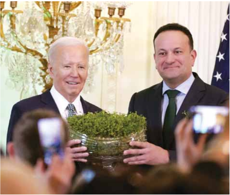
Ireland’s Prime Minister Leo Varadkar, right, presents President Joe Biden with a bowl of Shamrocks during a St. Patrick’s Day reception in the East Room of the White House, Sunday.