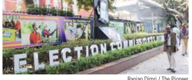
Ranjan Dimri / The Pioneer

The Election Commission (EC) on Thursday uploaded the complete electoral bond data given to it by the State Bank of India on orders of the Supreme Court. The data includes bond numbers that can link donors with the political parties they contributed to. As per latest data, Trinamool Congress got at least Rs 540 crore worth electoral bonds from Future Gaming, making it the biggest beneficiary of donations made by 'lottery king' Santiago Martin, who also donated to the DMK, the YSR Congress, the BJP and the Congress.