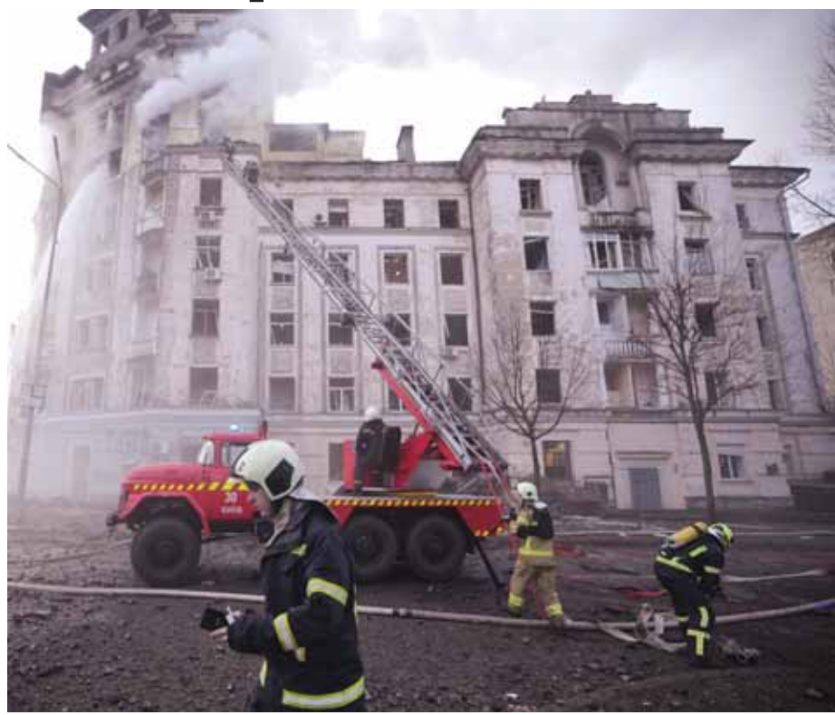
Firefighters work at the site after a Russian attack in Kyiv, Ukraine, Thursday.