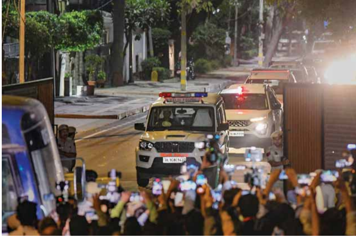
Delhi Chief Minister Arvind Kejriwal being taken away from his residence after he was arrested by the Enforcement Directorate in an excise policy-linked money laundering case in New Delhi on Thursday

Kejriwal was arrested from his residence on Flag Staff Road in Civil Lines and later taken to the ED headquarters at Lok Nayak Bhawan in the Capital. Officials said upon reaching the AAP leader's residence, the ED team informed the staff that it had a search warrant to raid Kejriwal's premises. They also mentioned that the team would serve summons and request Kejriwal to join the probe. Sources said Kejriwal's mobile phone has been seized by the agency, and there has been no communication between him and his family. As ED officials carried out their operation inside the CM's residence, additional Delhi Police personnel, Rapid Action Force (RAF), and CRPF teams were deployed at the Chief Minister's residence. The additional deployment was made as the ED sought extra security measures in anticipation of protests by AAP supporters. The Delhi Police stepped up security and deployed personnel in large numbers along with paramilitary force in anti-riot gear around the Chief Minister's residence in the Civil Lines area as an ED team reached there. "The deployment has been made in anticipation of a gathering and protest of AAP workers near his residence," a police officer said.