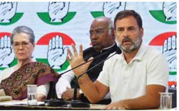
Congress president Mallikarjun Kharge and party leaders Sonia Gandhi and Rahul Gandhi during a media briefing at AICC headquarters in New Delhi on Thursday