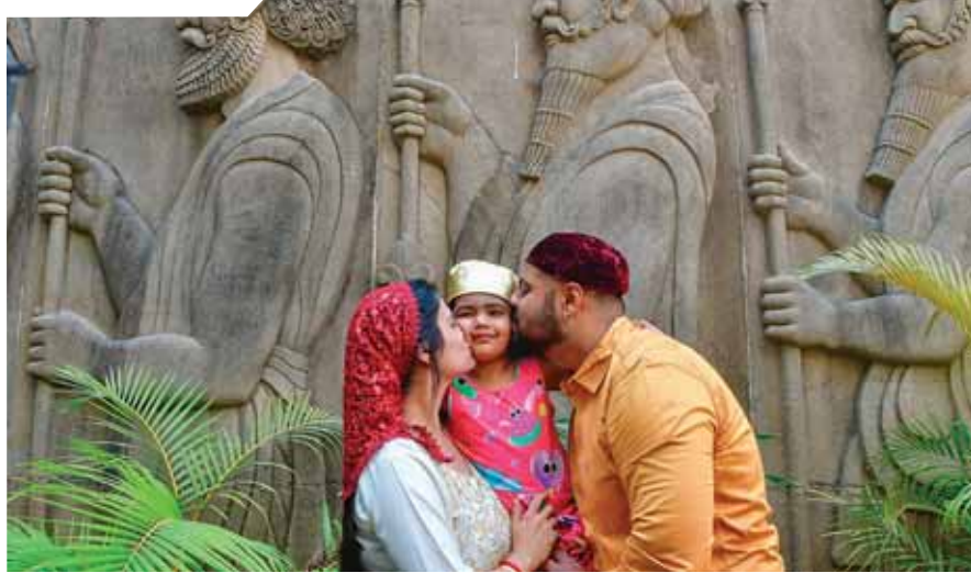
Parsi community members visit a fire temple on the occasion of 'Navroz', the Parsi New Year, in Mumbai