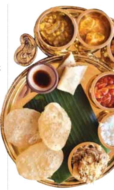
The Bengal Buffet (L to R) Narkel cholera dal, lau malai curry, dhokar dalna, rui maacher jhol, mutton rezala, Gondhoraj lanka Murgji, Gobindo Bhog Rice, Kolkata Biryani, Phulko luchi, Mishiti Doi, tomato chutney and Paati Shapta