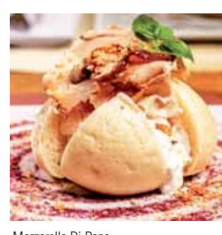
Mozzarella Di Pane