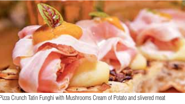
Pizza Crunch Tatin Funghi with Mushrooms Cream of Potato and slivered meat