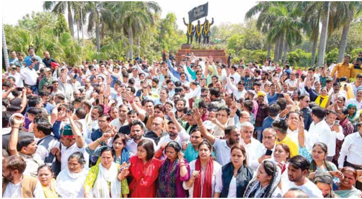
AAP workers and supporters at Shaheed Park during a protest over the arrest of Delhi Chief Minister Arvind Kejriwal in connection with an excise policy-linked money-laundering case in New Delhi on Saturday

Amidst the political turmoil in the AAP-led Delhi Government, the party is now fighting for its "survival" as its party headquarters has been allegedly sealed. With the Lok Sabha elections round the corner, its leaders have sought an appointment from the Election Commission (EC) to ensure equal opportunities for all parties in the Lok Sabha elections. The AAP has demanded that the poll watchdog should take notice of the entire incident. In another setback to Arvind Kejriwal, the Delhi High Court has refused to give urgent listing of the plea filed by the Chief Minister and AAP national convener Kejriwal challenging his arrest and custody in the case. In the second day of arrest of Kejriwal, the protesting leaders of the Aam Aadmi Party (AAP) raised concerns on Saturday regarding the alleged "sealing" of the party's office at Deen Dayal Upadhyaya Marg in Delhi and claimed that Ministers are being stopped from going to the office a charge which the Delhi Police denied. The AAP also accused the Narendra Modi Government at the Centre of engaging in systematic intimidation by preventing free movement of party leaders ahead of the Lok Sabha elections.