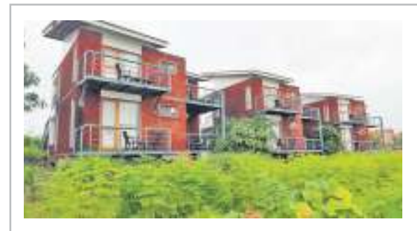
The Bison Resort in Madhya Pradesh's Narmadapuram

"As ambassadors of our country's hospitality and development, all our tourist facilities should actively involve themselves in enhanc-