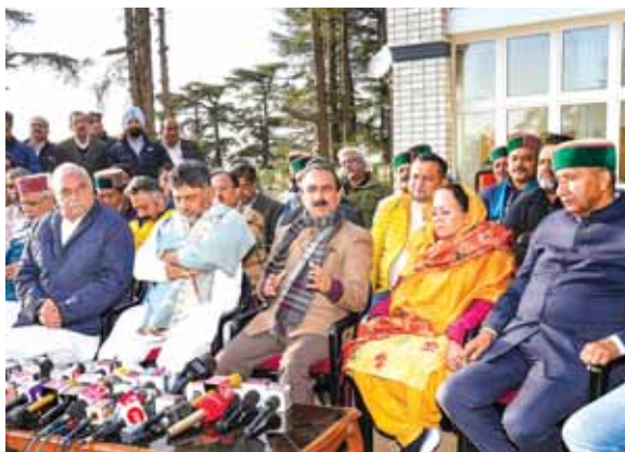
Himachal Pradesh Chief Minister, Karnataka Deputy Chief Minister DK Shivakumar, former Chhattisgarh Chief Minister Bhupesh Baghel, former Haryana Chief Minister Bhupinder Singh Hooda, HP Congress Committee (HPCC) president Pratibha Singh with central observers and others during a Press conference in Shimla on Thursday

They had also abstained from voting on Budget in the Assembly, defying a party whip to vote in favour of the Government on the Finance Bill. The ruling Congress had sought their disqualification on this ground. Following the