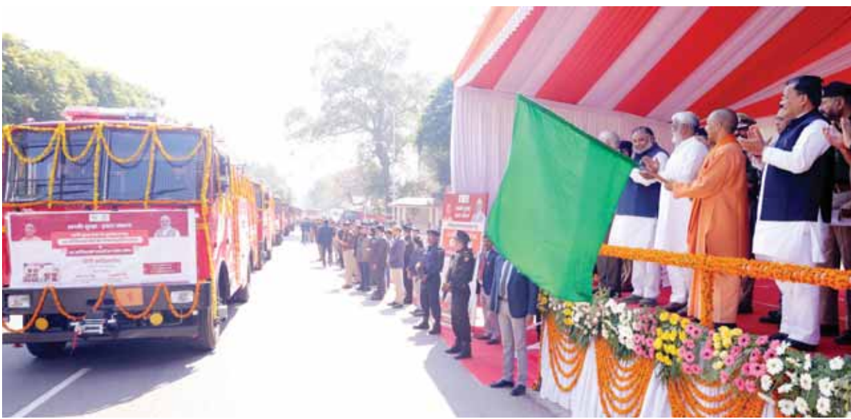
Chief Minister Yogi Adityanath flagging off firefighting vehicles on Thursday

Chief Minister Yogi emphasised the need to prioritise reducing the response times for fire tenders to mitigate loss of life and property. Significant enhancements have been made in this area in recent years, resulting in the