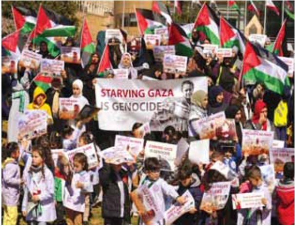
Palestinians living in Lebanon hold placards and their national flags during a protest to demand a ceasefire and support Palestinians in the Gaza Strip, in front of the headquarters of U.N. Economic and Social Commission for Western Asia (ESCWA) in Beirut, Lebanon on Thursday.

Israeli officials acknowledged that troops opened fire, saying they did so after the crowd approached in a threatening way. The officials insisted on anonymity to give details about what happened, after the military said in a statement that “dozens were killed and injured from pushing, trampling and being run over by the trucks”. Gaza City and the surrounding areas in the enclave’s north were the first targets of Israel’s air, sea and ground offensive, launched in response to Hamas’ Oct 7 attack. The area has suffered widespread devastation and has been largely isolated during the conflict. Trucks carrying food reached northern Gaza this week, the first major aid delivery to the area in a month, officials said