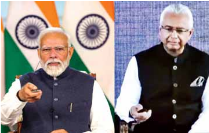
Prime Minister Narendra Modi and his Mauritian counterpart Pravind Jugnauth jointly inaugurate several India-assisted development projects at the Agalega Island in Mauritius, via a video conference, on Thursday

ensure security, prosperity and stability in the Indian Ocean Region. We are cooperating together in all areas like monitoring of exclusive economic zone, joint patrolling, hydrography, and humanitarian assistance and disaster relief," he said. Modi's comments came amid increasing concerns in New Delhi over China's growing military forays into the Indian Ocean region which is largely considered as the backyard of the Indian Navy.