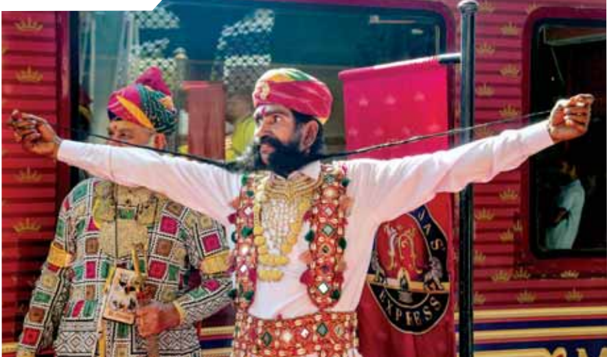
A local artiste with long mustache poses for photos, in Bikaner